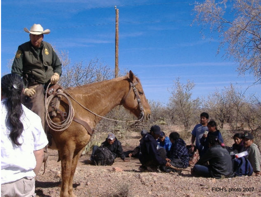
Arrests witnessed by FIDH's mission in the Reservation of Tohono O'odham, Arizona.

As previously mentioned 54 , in line with the U.S. border militarization and enforcement strategy, the number of B.P. agents has considerably grown over the years, as the amount of spending on border enforcement has increased more than five-fold since 1994. As of January 2008, 14,923 B.P. agents – four times more than in 1990, and 21% more than in 2006 – are deployed and patrol nearly 6,000 miles of international land borders and over 2,000 miles of coastal waters. In the Tucson sector alone, B.P. officials informed us 55 that while there were only 70 agents deployed in the Tucson Sector in 1993, today there are more than 400. That sector is today the most important B.P. sector, both in terms of human and material resources. The B.P. is equipped with significant infrastructure, including temporary vehicle barriers, unmanned aerial vehicles, night vision cameras, trucks equipped with watchtowers (see picture below), and helicopters. Also, high technology tools such as infra-red cameras and ground sensors are dispersed in the desert areas. When sensors indicate a presence, the closest B.P. agent is immediately sent on-site. Although horses or cows trigger the sensors, the B.P. insisted that this equipment was useful to “catch” border-crossers. Traffic checkpoints are also in place – there are 6 of them for the El Paso