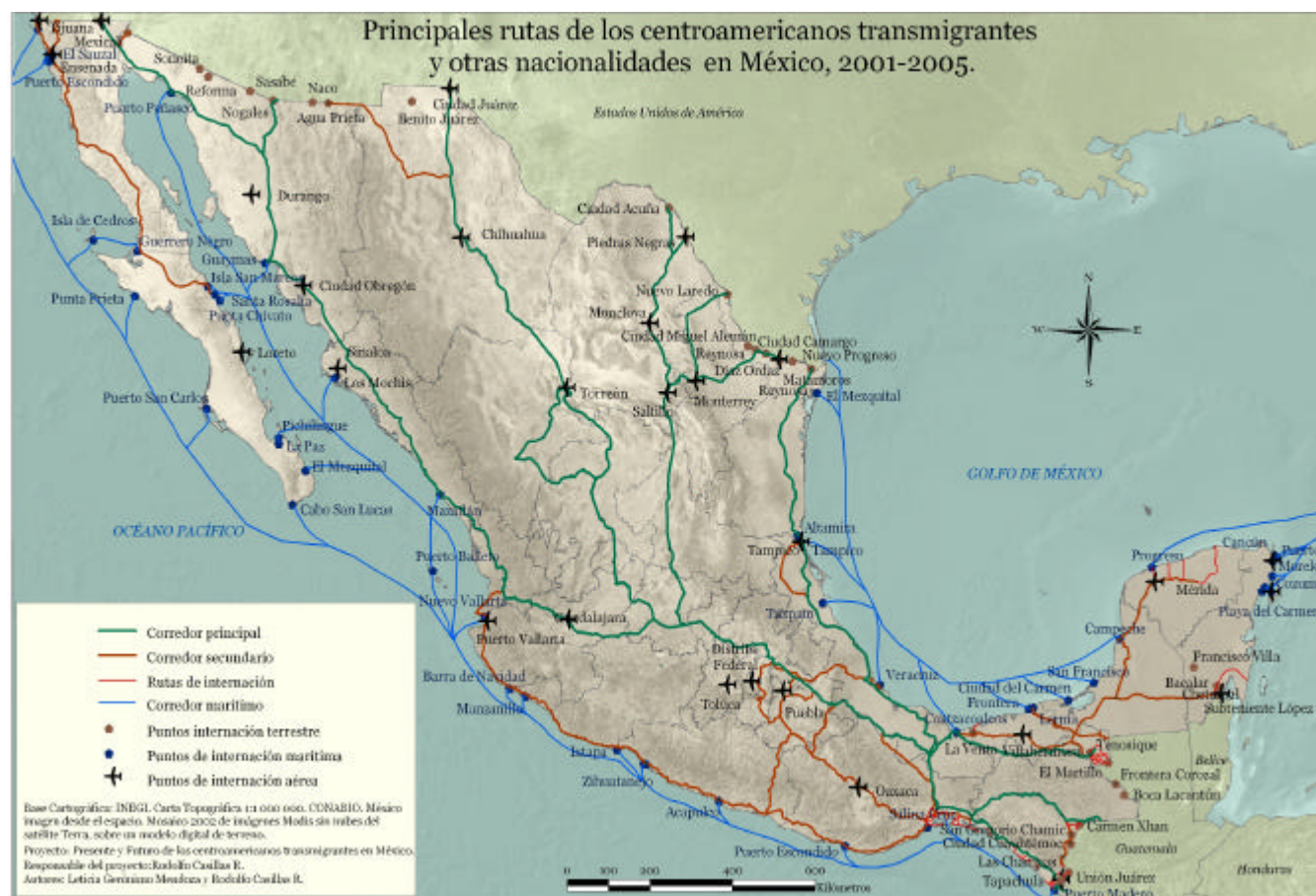
A simple and anonymous life: Central Americans transmigrants in Mexico, Mexico, edited by the National Commission of Human Rights (CNDH) and the International Organization for Migrations (IOM), 2007.