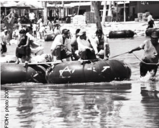
Migrants crossing illegally the border between Guatemala and Mexico.

For these migrants, uncertainty starts in Tecún Umán, border city between Guatemala and Mexico characterized by a population that carries out work activities related to the border; such as tricycle drivers, currency exchangers, boatpeople who transport persons and goods from one side of Suchiate River 25 to the other in boats made of tires.