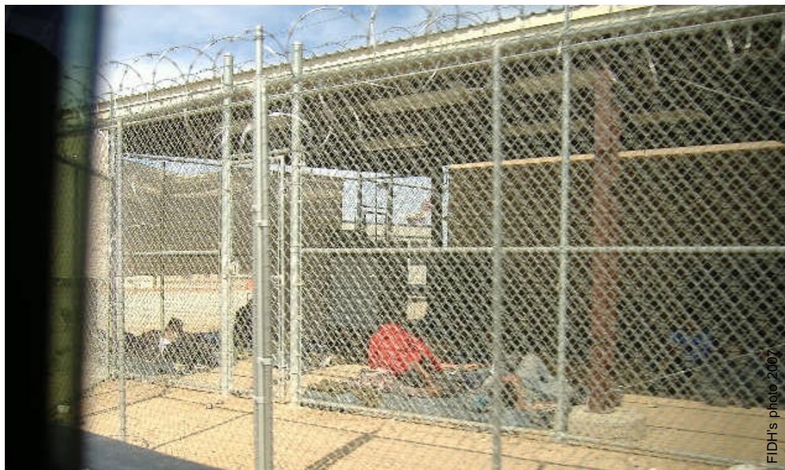
FIDH's photo 2007