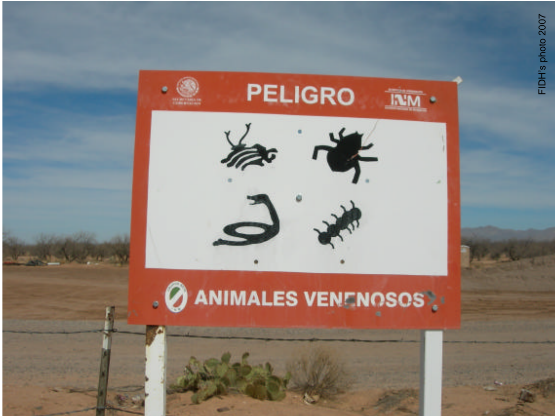
Advertisement of the National Migration Institute of Mexico (INM)

Once they arrive in Arriaga, hundreds of migrants, men, women and children get hold of the exterior of cargo trains that go from Arriaga to Ixtepec and then take other trains to different places in the northern border. As we will see later on, during this long journey migrants suffer amputations as a result of falling off the trains or being thrown out of them.