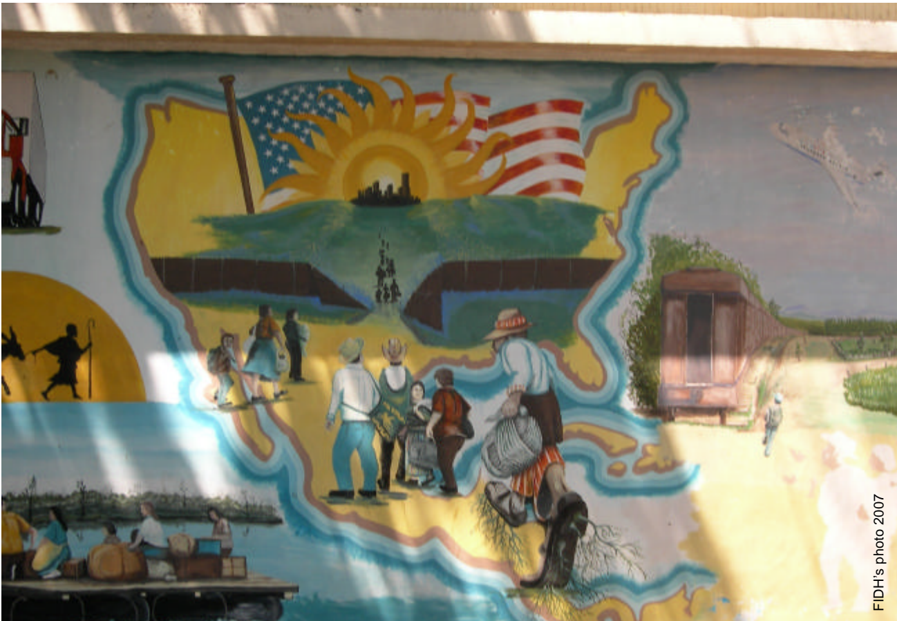
Mural at the migrants' house in Tecún Umán.

Migrations towards the United States coming from Mexico and Central American countries (mainly Guatemala, El Salvador, Honduras and Nicaragua) are in line with the long history of relations between these two parts of the American continent; but nowadays there are new factors that explain the changes involved in the migration causes and the policies that have governed them for the last ten years.