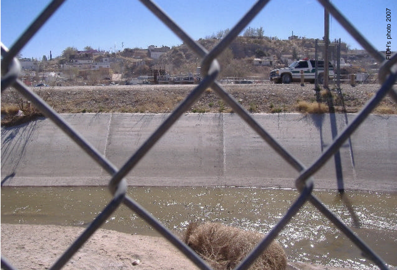
A Border Patrol Jeep stands watch over the U.S.-Mexico border in El Paso, Texas.

According to a report by the Department of Justice, this strategy aimed at making the border crossing every day more difficult and expensive. At the beginning it was about stopping immigration of undocumented people in the urban areas where the border crossings were traditionally concentrated and then deploy the operations in further regions where the terrain was thought to be so difficult and dangerous that it would deter future candidates from starting the journey. The prospect of a rise in the number of deaths was officially taken as a complementary deterrence argument.