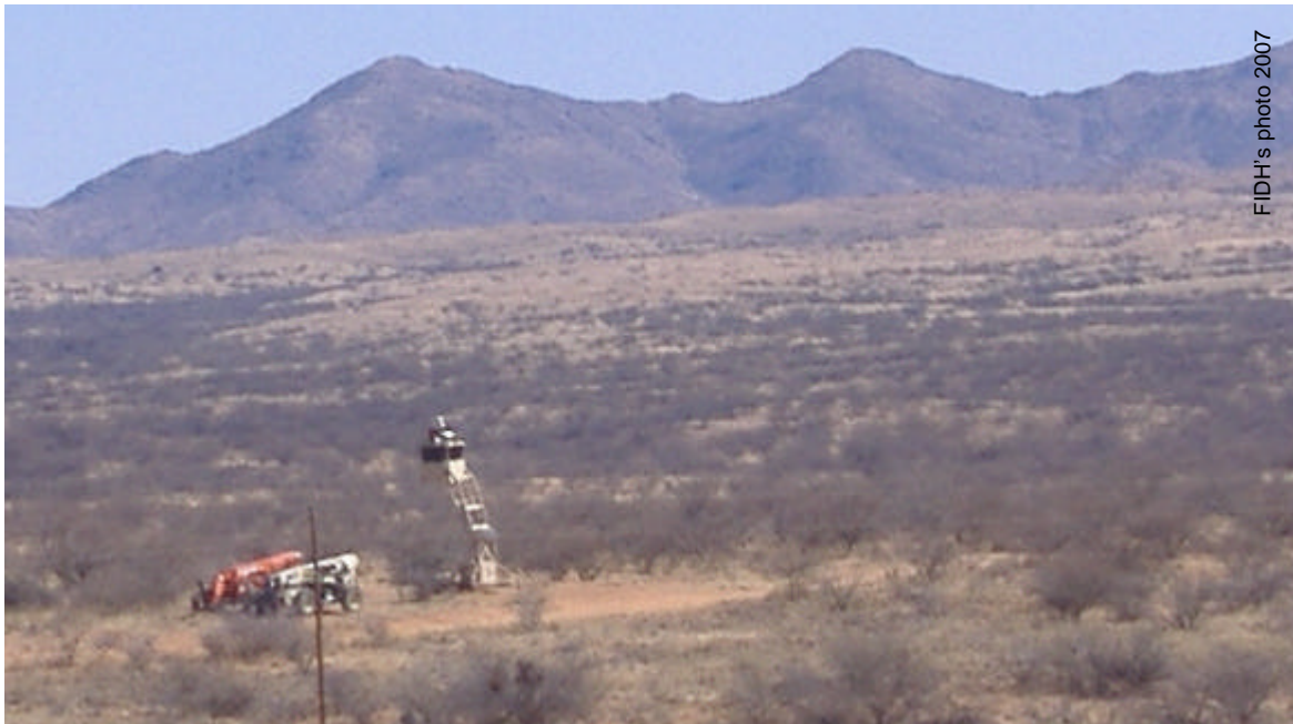
A Border Patrol agent in a small watchtower is looking out for migrants a few miles away from Sasabe's port of entry in Arizona.

led to an appreciable rise in processing of undocumented migrants at the borders 13 nor has stopped the spectacular growth of the population officially considered illegal, a population that will be tripled in 15 years.