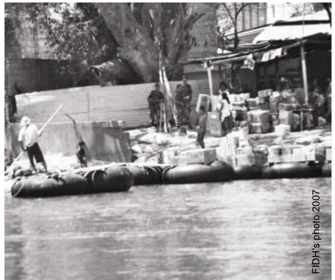
Military officers keep watch on the border on the Mexican side.

of the river, which are supposed to protect the border and its surrounding areas, constituted by a huge market located throughout several streets next to the river. Actually, they pretend not to see the smuggling that takes place right in front of them. Boatpeople have the obvious consent of the authorities on both countries, favoring goods smuggling. During these trips from one side of the river to the other migrants infiltrate without being detected. Sometimes officers stop migrants or smugglers crossing on the boats to ask for money before letting them go.