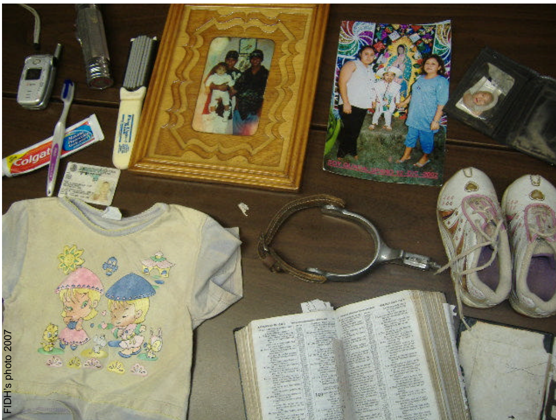
Items found in the desert of Arizona by Humane Borders volunteers

FIDH believes that a deep reform of migration legislations in Mexico and the United States is a must. The challenge will be to put into practice what the authorities’ speeches on human rights proclaim in many ways regarding undocumented migrants crossing the borders. In order to achieve this, the reforms should decriminalize migrants that are in an irregular administrative situation, fight impunity on acts of corruption and violence at the borders, including by officials, stop the systematic detention of migrants, and create an effective right to appeal against deportation orders. Government officials should also take the issue of migrations out of the area of fear and security to place it in the area of development and cooperation.