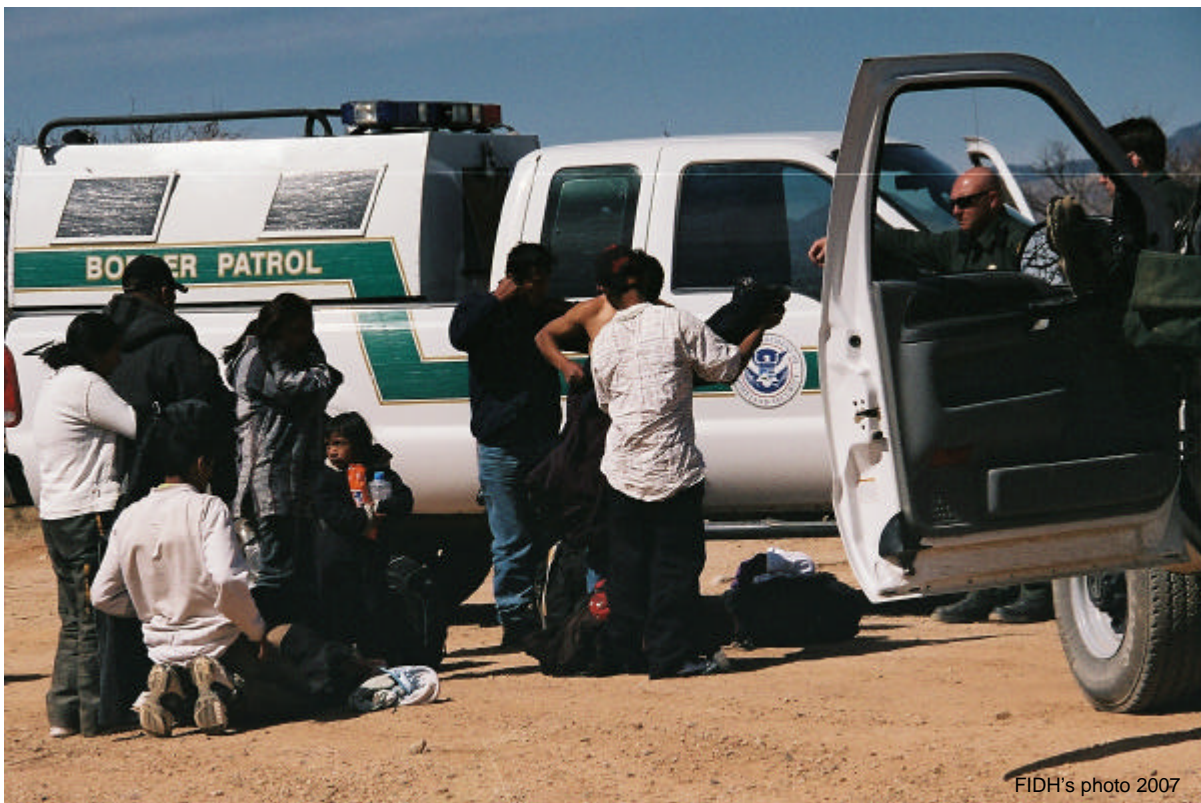
Arrests witnessed by FIDH's mission near Sasabe, Arizona.

In the 1990's, the U.S. Congress mandated that the Border Patrol (B.P.) shift agents away from the interior to deploy them forward to the border, which took place with El Paso Sector's "Operation Hold the Line" (1993), San Diego's "Operation Gatekeeper" (1994) and Tucson's "Operation Safeguard" (1999). Since 1994, the Border Patrol has made more than 15.6 million apprehensions nationwide. In Fiscal Year 2006, the B.P. made 1.1 million arrests, and in 2007 it made 876,704 arrests – all of Mexican nationality but for 68,000 – which represent a decrease of 19.5% 53 .