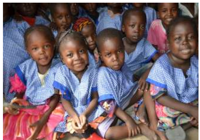
Nursery in the camp of Gore, southern Chad.