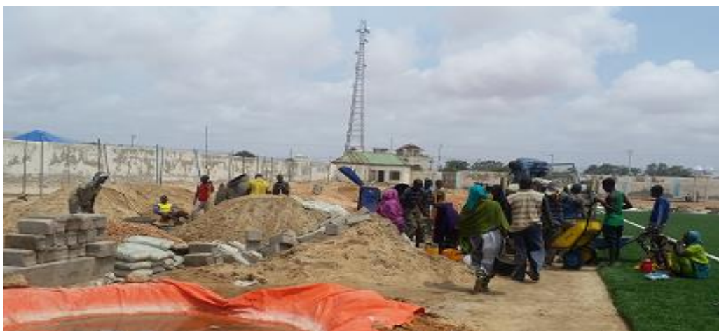
Building an athlete running track. © UNHCR / Lower Juba region, August 2017