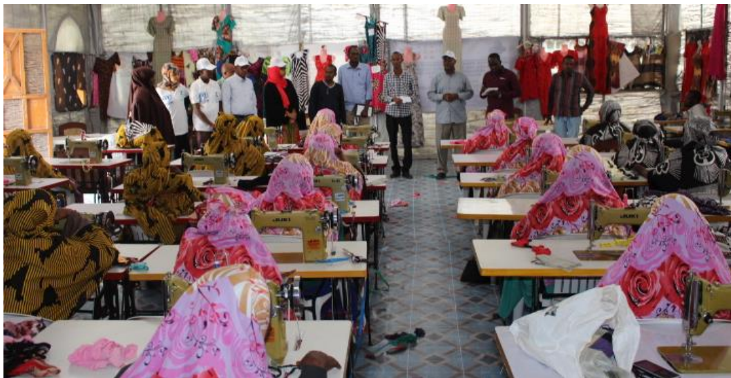
Returnees from Kenya undertaking vocational training for the last month prior to their successful completion of the training © UNHCR / Banadir region, August 2017