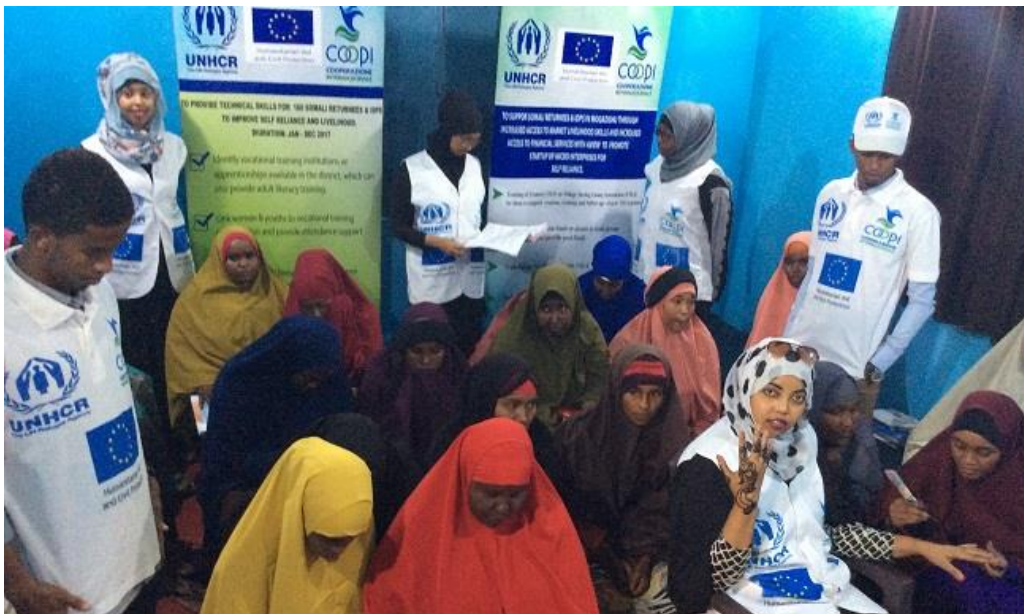
Students of a beauty salon class showing their skills to draw a henna to UNHCR partner during a monitoring visit. © UNHCR / Banadir region, August 2017