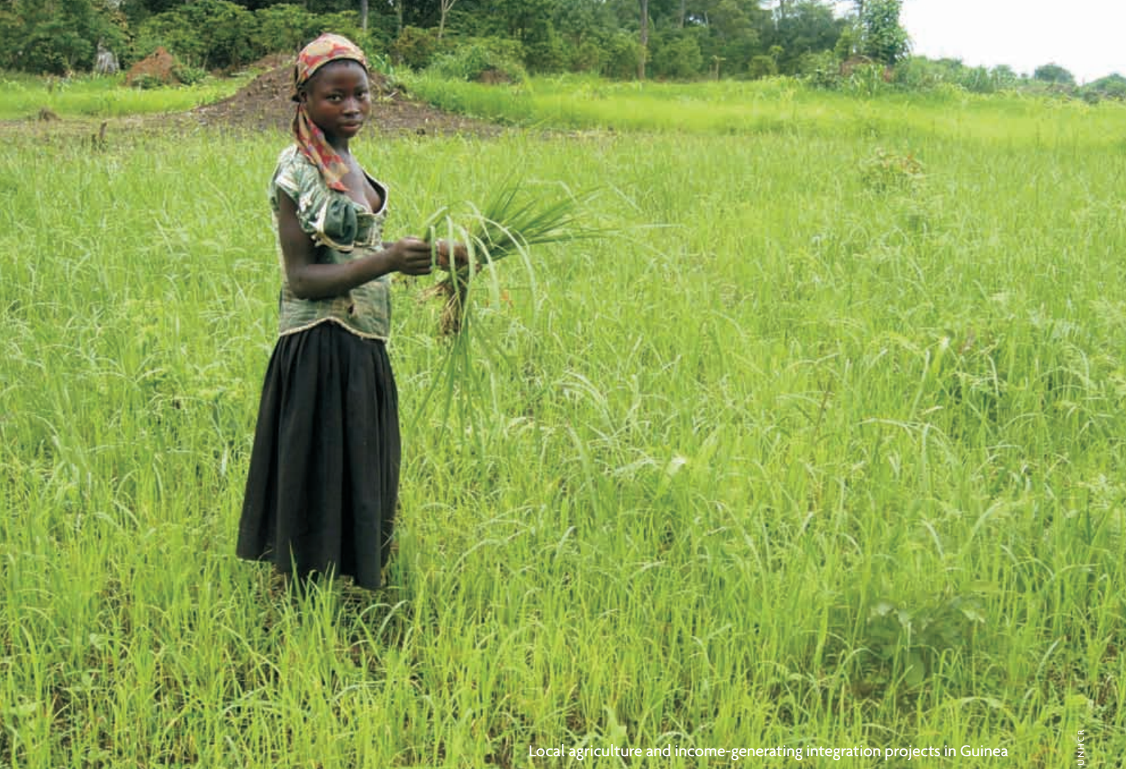
Local agriculture and income-generating integration projects in Guinea