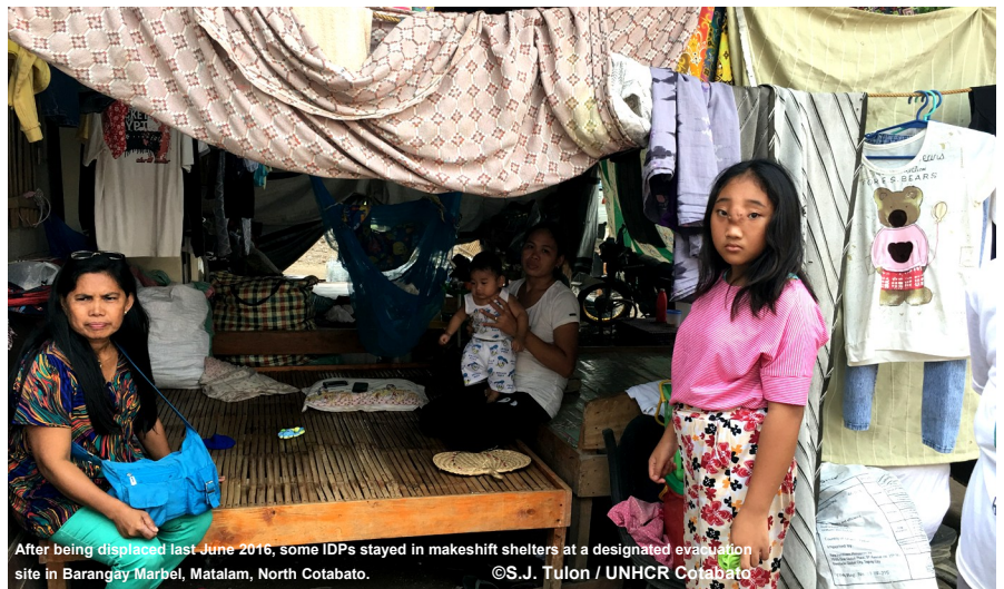
After being displaced last June 2016, some IDPs stayed in makeshift shelters at a designated evacuation site in Barangay Marbel, Matalam, North Cotabato.

Armed encounters between the same parties had earlier triggered displacements in several barangays of Matalam in December 2015 and June 2016 (see: previous editions of the Monthly Displacement Dashboard and the IDP Protection Assessment Report dated June 07, 2016). Efforts are ongoing to peacefully settle the dispute, but so far, to no avail. As of this report, the 172 affected families remain displaced.