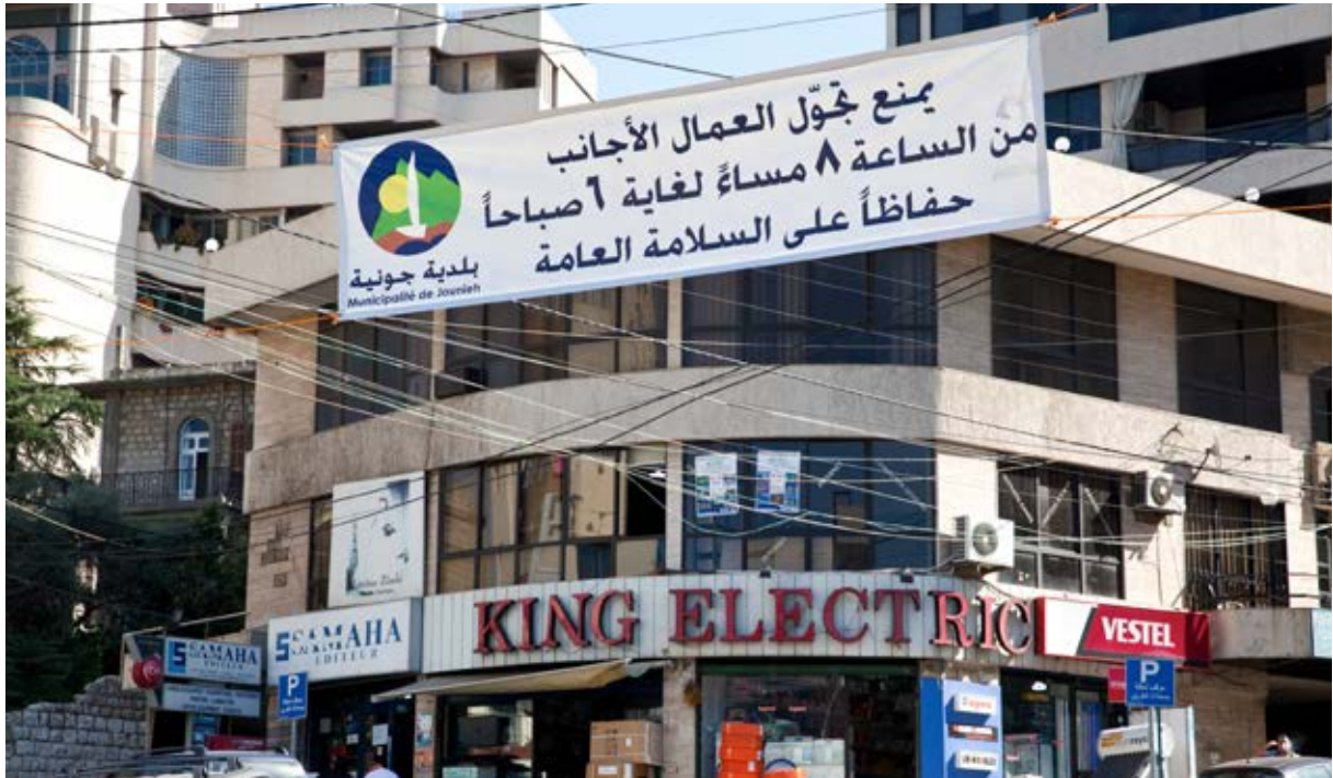
In many areas of Lebanon, curfews are imposed on Syrian refugees. Some refugee children have jobs that do not allow them to return home in time. This sign in a busy street in this suburb of Beirut, Lebanon, reads, “It is forbidden for foreign workers to walk around from 8pm-6am for public safety – Jounieh Municipality.”

Syrian children. One community leader said theft by children had increased in the first half of 2013, sometimes instigated by adults. Some boys in Za’atari allegedly belong to gangs, which instill fear in other refugees living in the camp.