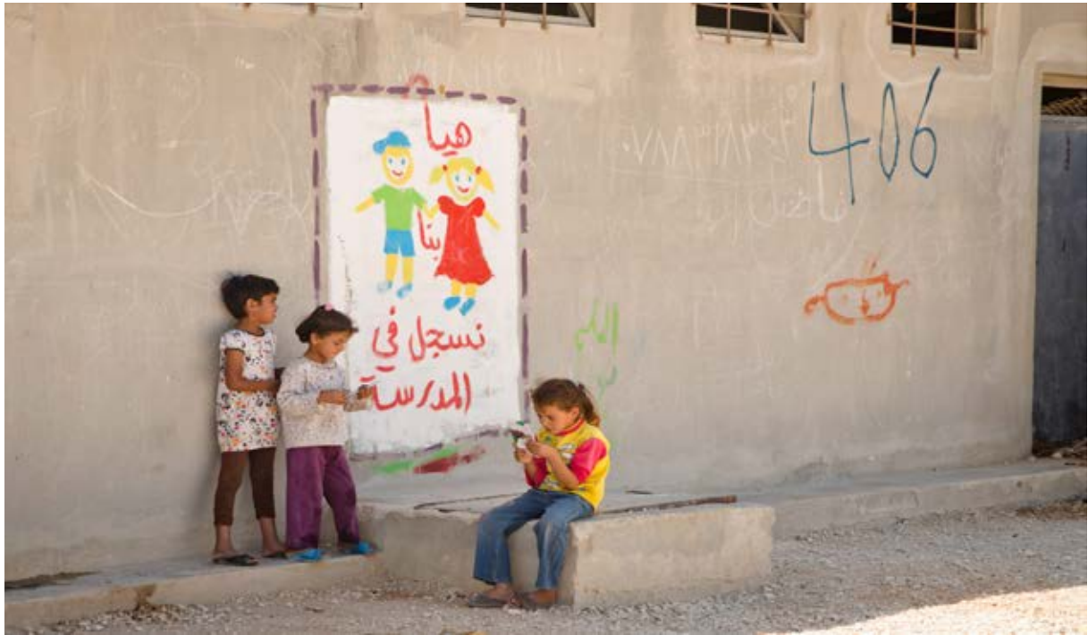
A mural painted by children in Za'atari refugee camp that says "Let's go register for school."

not being educated, and without education there is nothing. We're heading towards destruction."