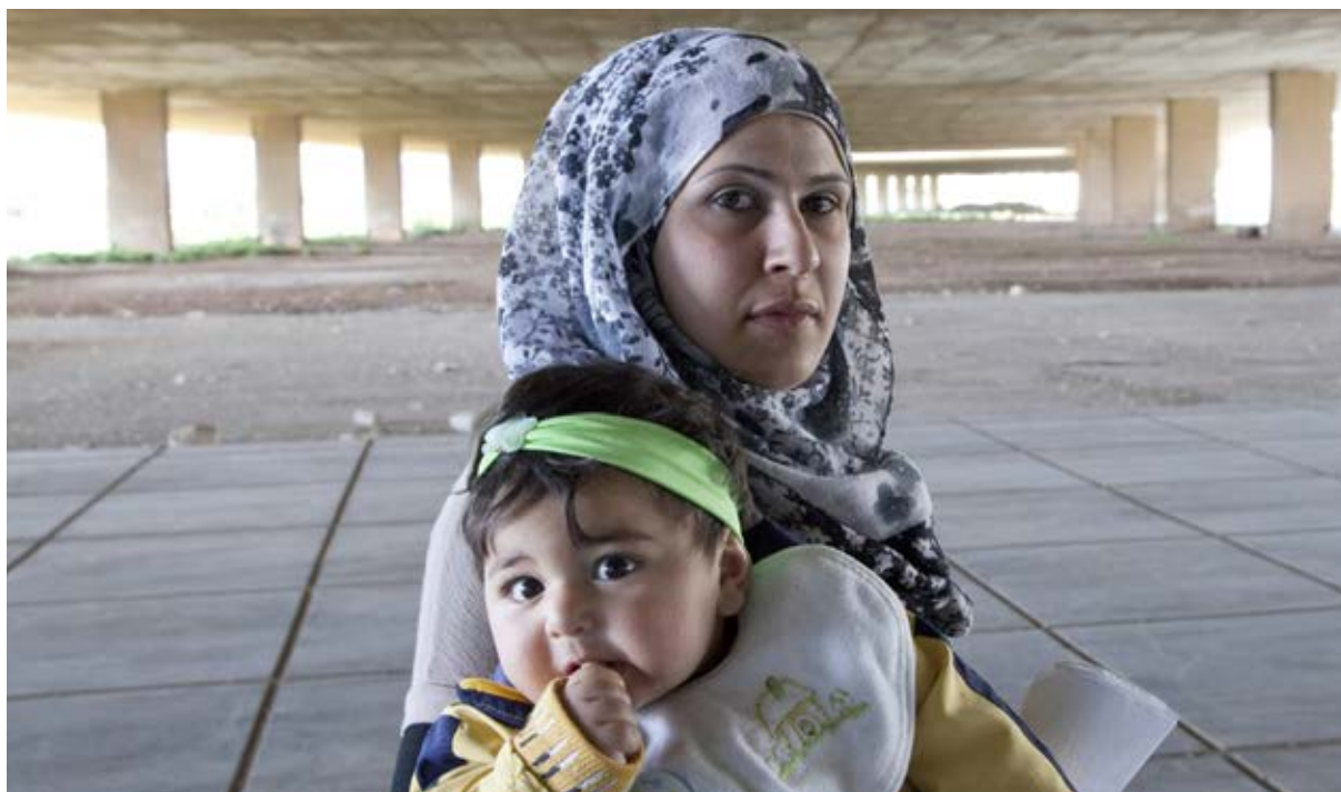
Cradling her daughter, a Syrian mother waits to register for assistance in Tripoli, Lebanon. Her husband is missing.

unaccompanied and separated children. This involved tracing and reuniting children with family members in Jordan or abroad, identifying safe and appropriate care arrangements with extended family or other members of the community, and assessing existing care arrangements to ensure that they were suitable and safe.