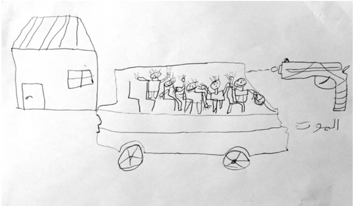
This picture was drawn by a nine-year-old boy while his family were registering as refugees at Tyre registration centre, Lebanon. The bus that he and his family took to flee their home in Syria was stopped and robbed by armed men. To the right of the bus, the boy has written the word “death.”

(IMC) in Irbid, Jordan, has worked with more than 90 Syrian refugee children over the past nine months. She has met a number of children who have not only seen their family members killed before their eyes, but have then helped