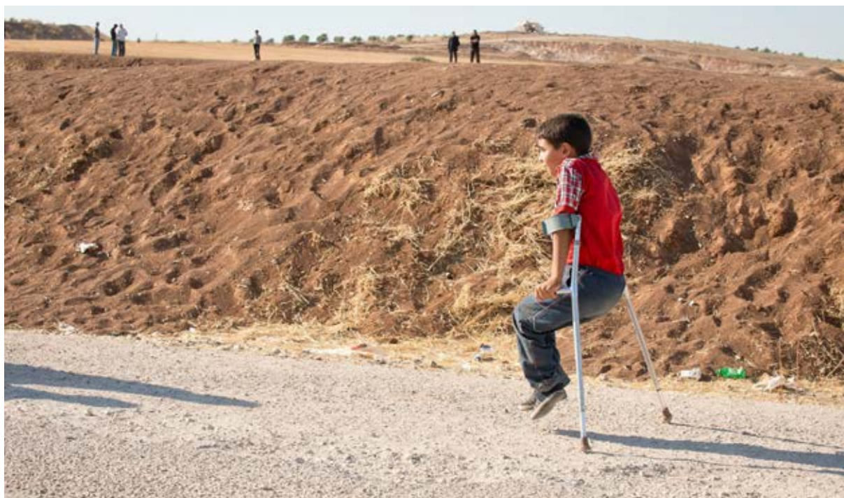
A young Syrian refugee enters Jordan on crutches.

friendly spaces. Children also receive psychosocial support through NGOs and community centers, as well as at UNHCR registration centers.