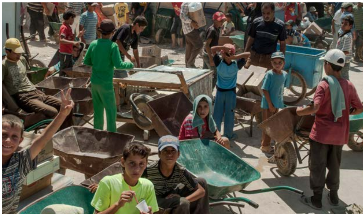
Syrian refugee children line up for work in Za'atari refugee camp in Jordan.