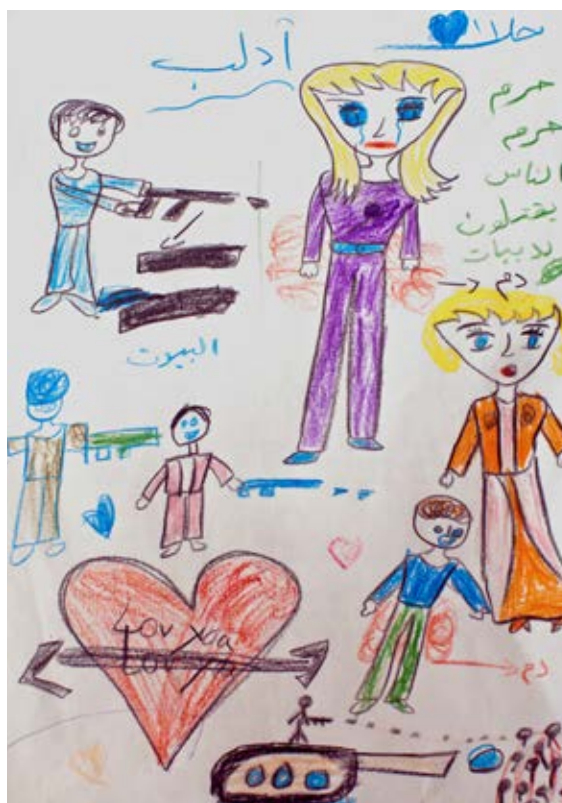
An 11-year-old girl drew this picture while she and her family were registering with UNHCR at the registration centre in Tyre, Lebanon. It portrays an attack on her neighbourhood in Syria in which she lost many friends and neighbours. The text says “Shame, shame, people are killing with tanks.” The arrow from the woman in purple points to the word “blood.”