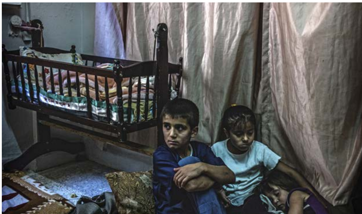
These children live in a tiny apartment in the suburbs of Amman. The television is one of the only sources of entertainment. With family still inside Syria, the parents often follow Syrian channels that show graphic images of violence, destruction and death.

a constant backdrop in Homs—unsettling. He was worried it would start again.