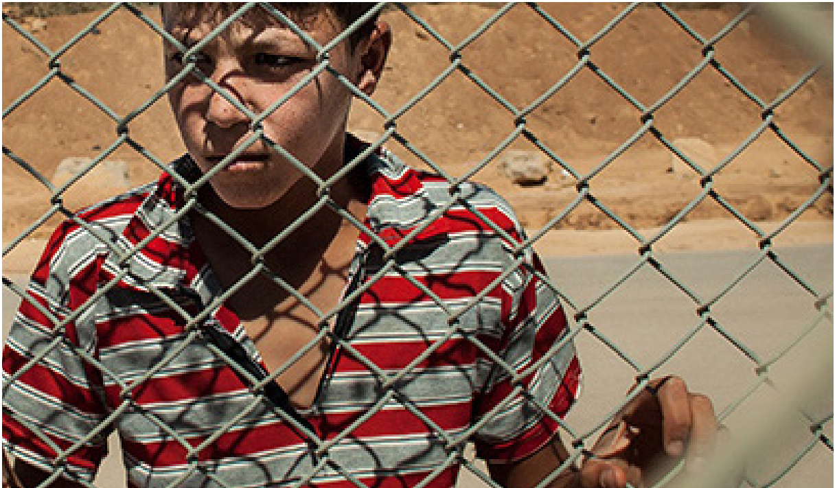
A young boy looking for work in Za'atari refugee camp, Jordan.

in Lebanon, said that “If you go on the street, you see Syrian children working everywhere.”