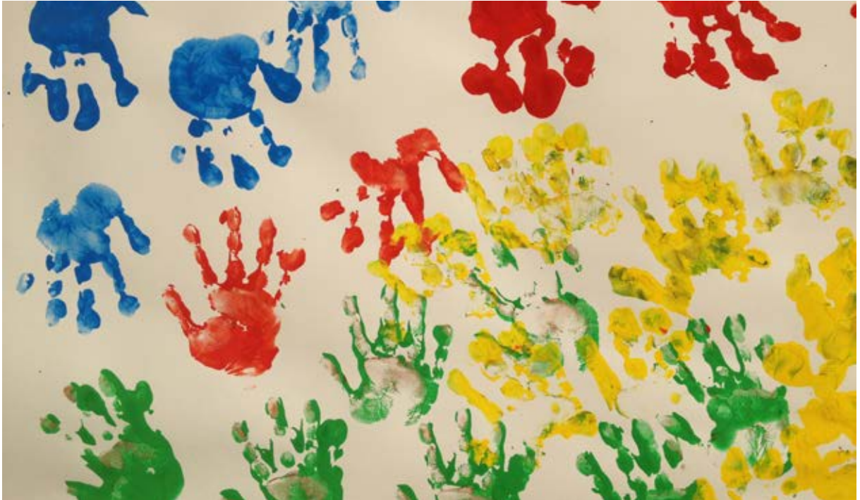
Finger-painting found at the Women's Centre in Tyre, Lebanon.