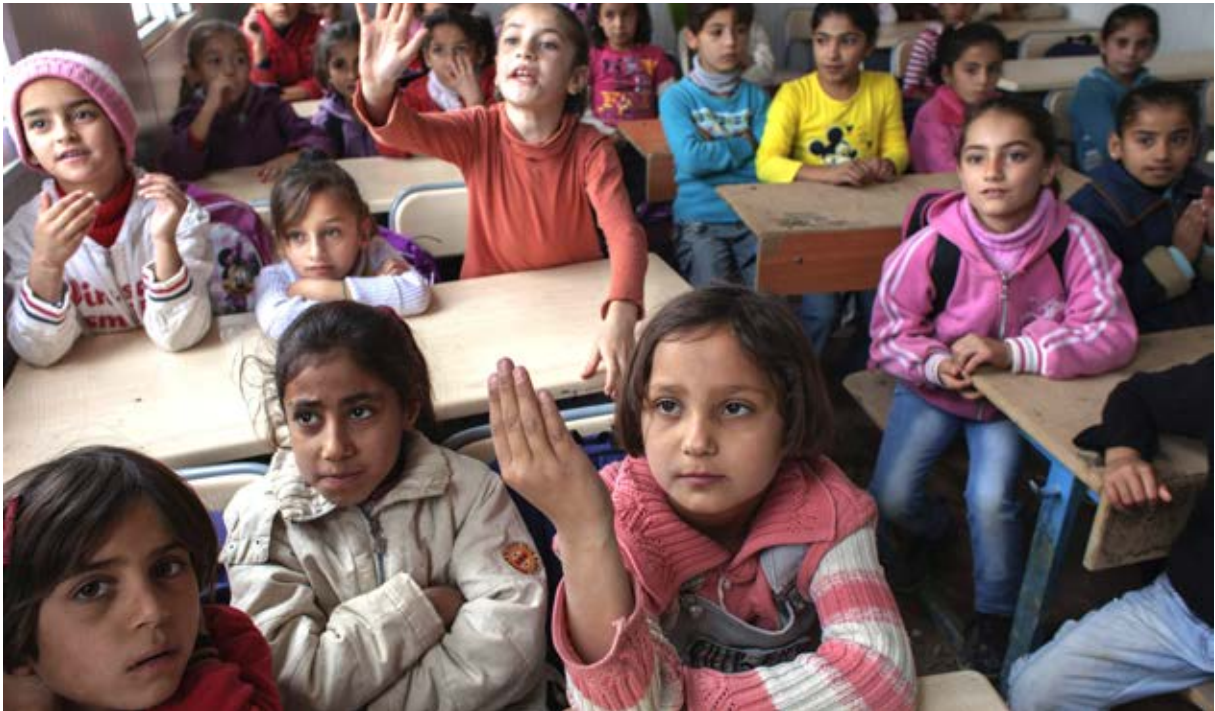
Syrian children attend class at a primary school in Domiz refugee camp in the Kurdistan Region of Iraq. Syrians, even those of Kurdish ancestry, seldom attend public schools in the Kurdistan Region, where the language of instruction is Kurdish, because they are accustomed to attending Arabic-language schools in Syria.

a particular problem for older children. It is easier for younger children to pick up a new language, and their Lebanese peers are also less advanced. Despite the difficulties in learning a new language, a number of Syrian refugee children see this as a valuable opportunity.