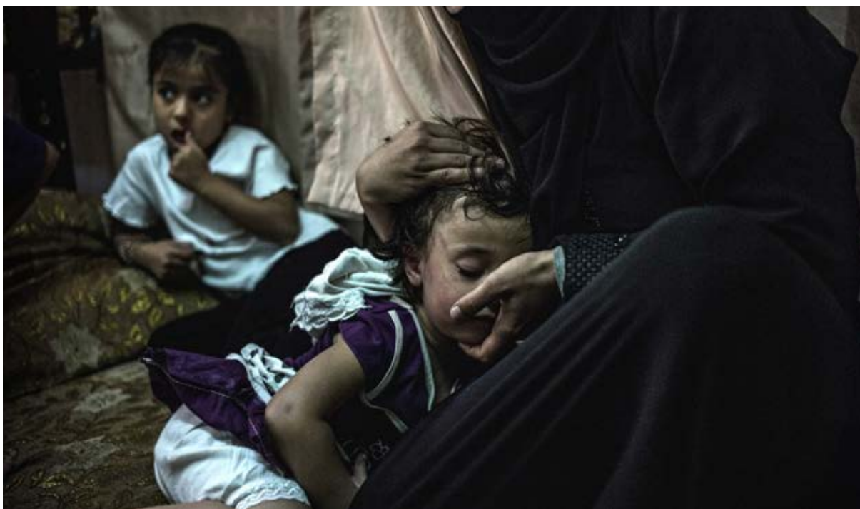
A Syrian refugee mother living in Amman, Jordan, shows the wounds on the face of her young daughter after she was hit by a neighbour.