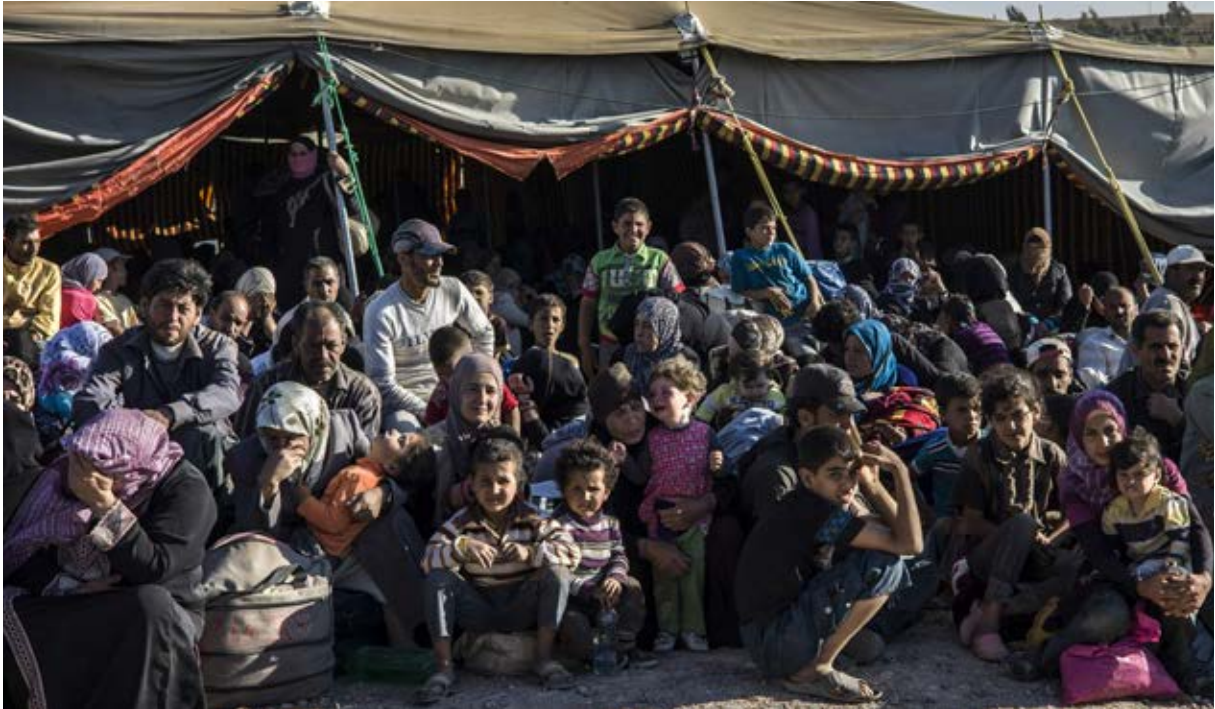
Newly arrived refugees at the Jordan-Syria border await transport to Za'atari refugee camp in Jordan.

UNHCR registration sites in Beirut, Tripoli and Tyre. Some organizations run unique programmes, such as Korea Food for the Hungry International, which offers tae kwon do for children in Za'atari camp.