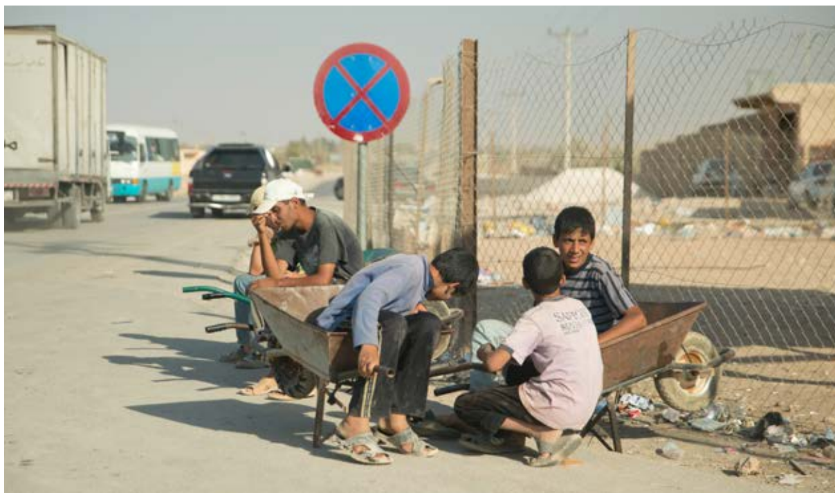
Syrian refugees sit with their wheelbarrows outside the gate of Za'atari refugee camp, waiting for odd jobs pushing loads.

families, it is often not possible to find a way for children to stop working. In such situations, case managers also interact directly with children's employers to minimize the risks they face in the workplace. This can include providing materials to improve their safety at work and negotiating with employers to ensure they can access at least informal education alongside work.