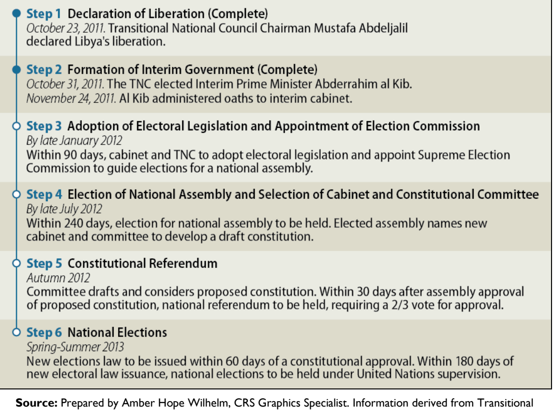
Figure 2. Libya's Proposed Transition Timeline