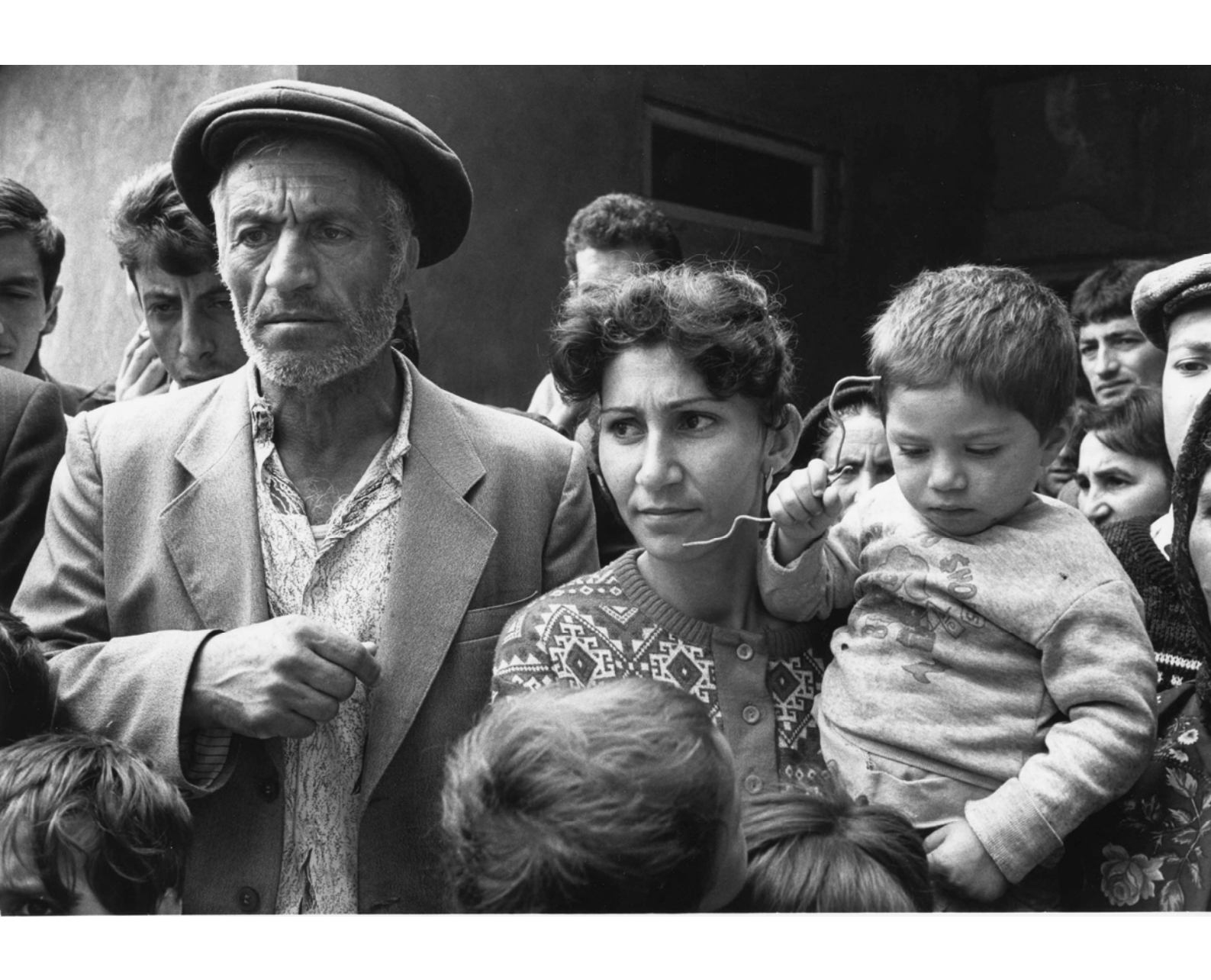
Chapter 16 The right to family unity and the right to respect for private and family life