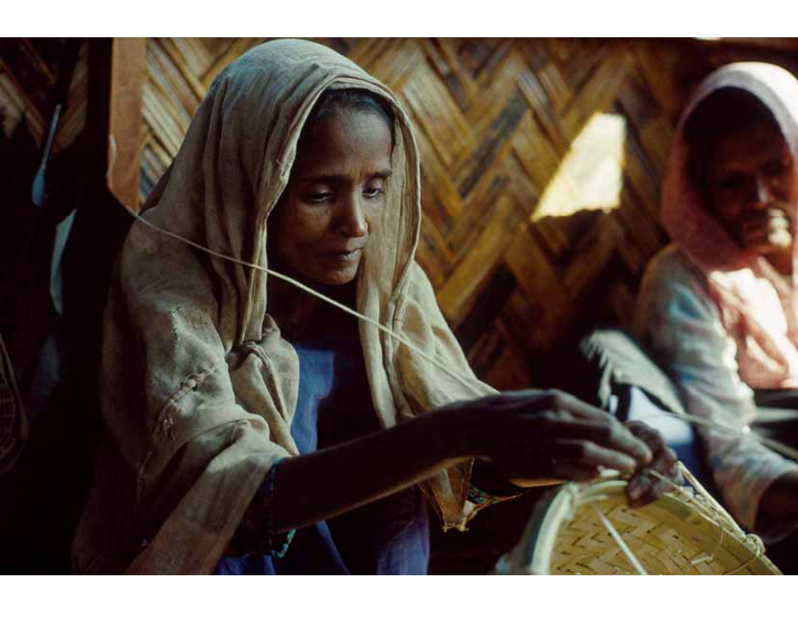
Chapter 4 Elderly persons