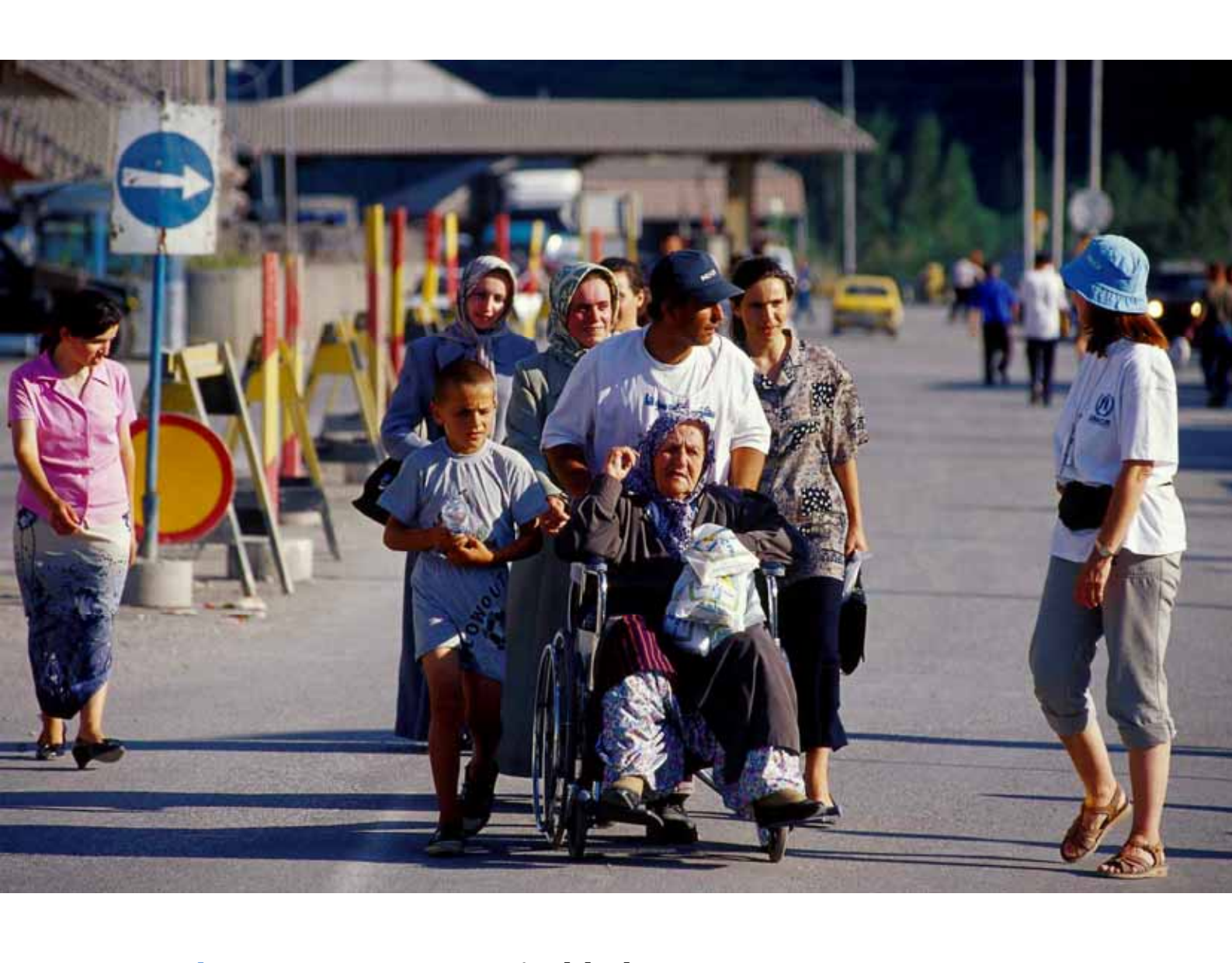
Chapter 5 Disabled persons