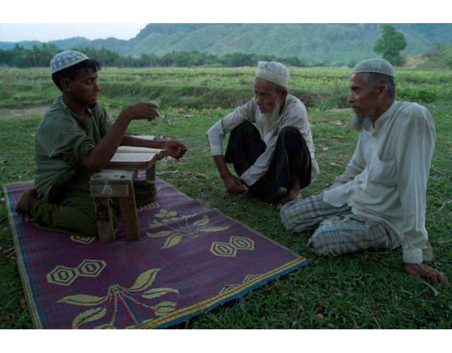
Chapter 18 Selected additional civil and political rights of refugees