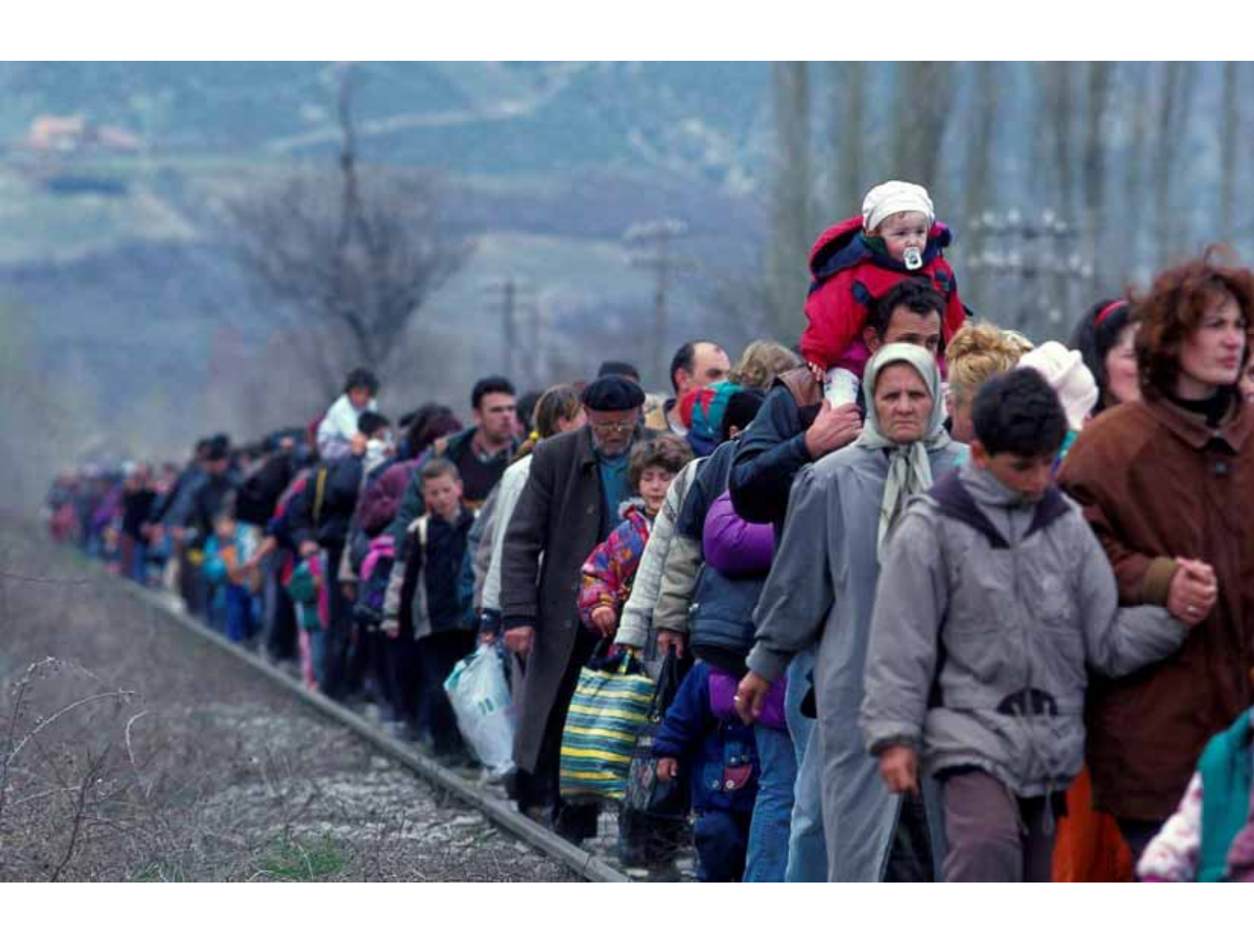
Chapter 8 The right to seek and enjoy asylum from persecution