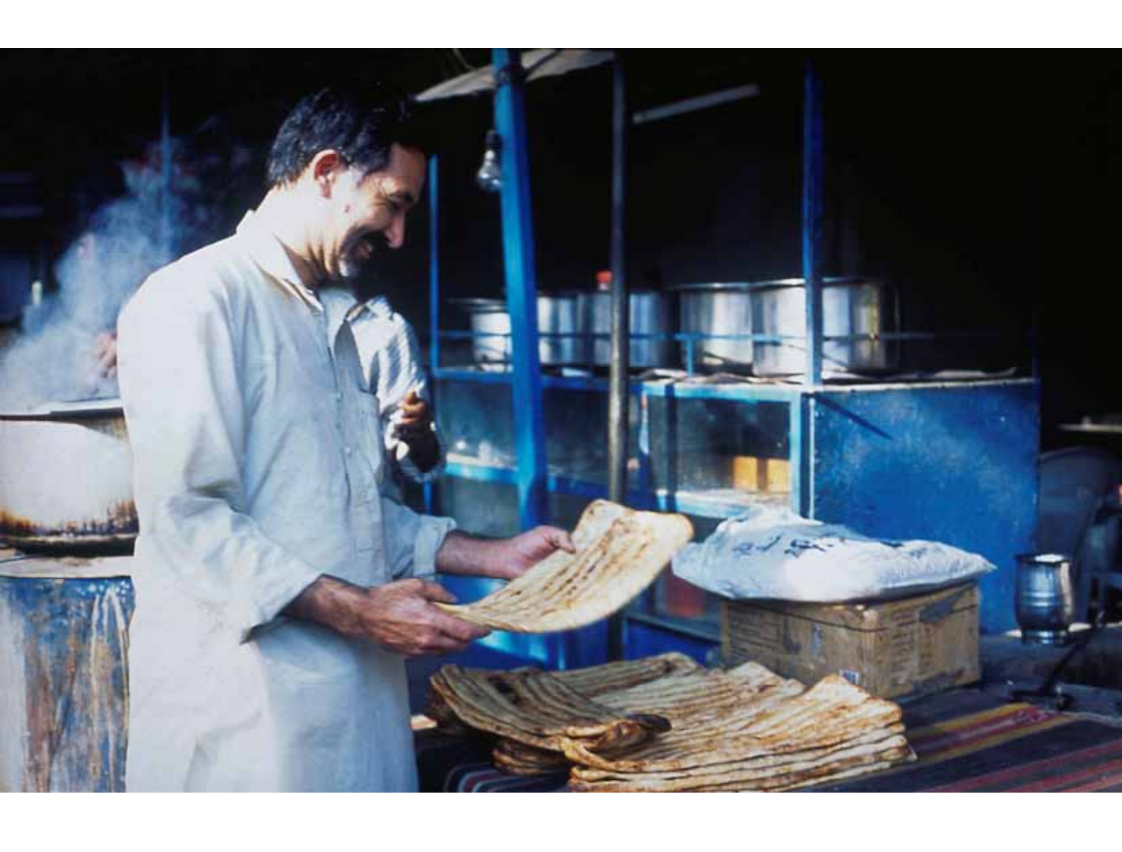
Chapter 17 The right to work