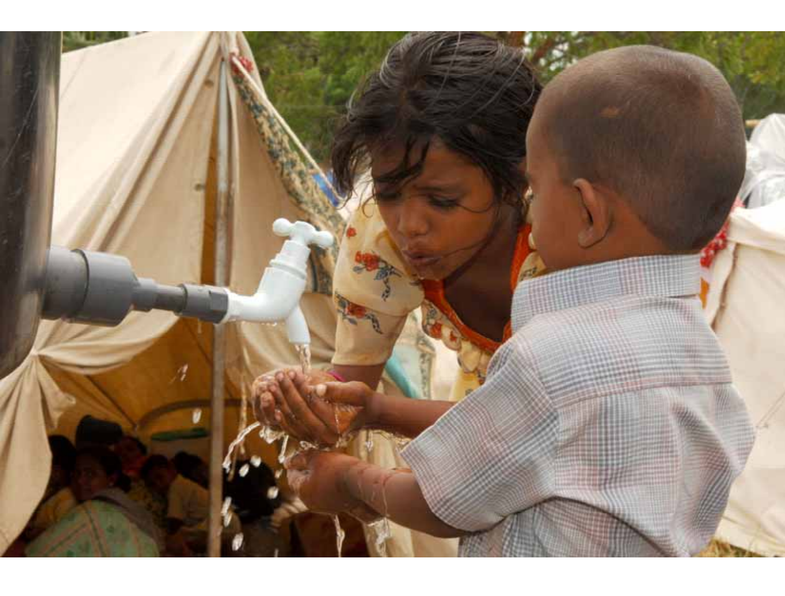
Chapter 3 Children (girls and boys)