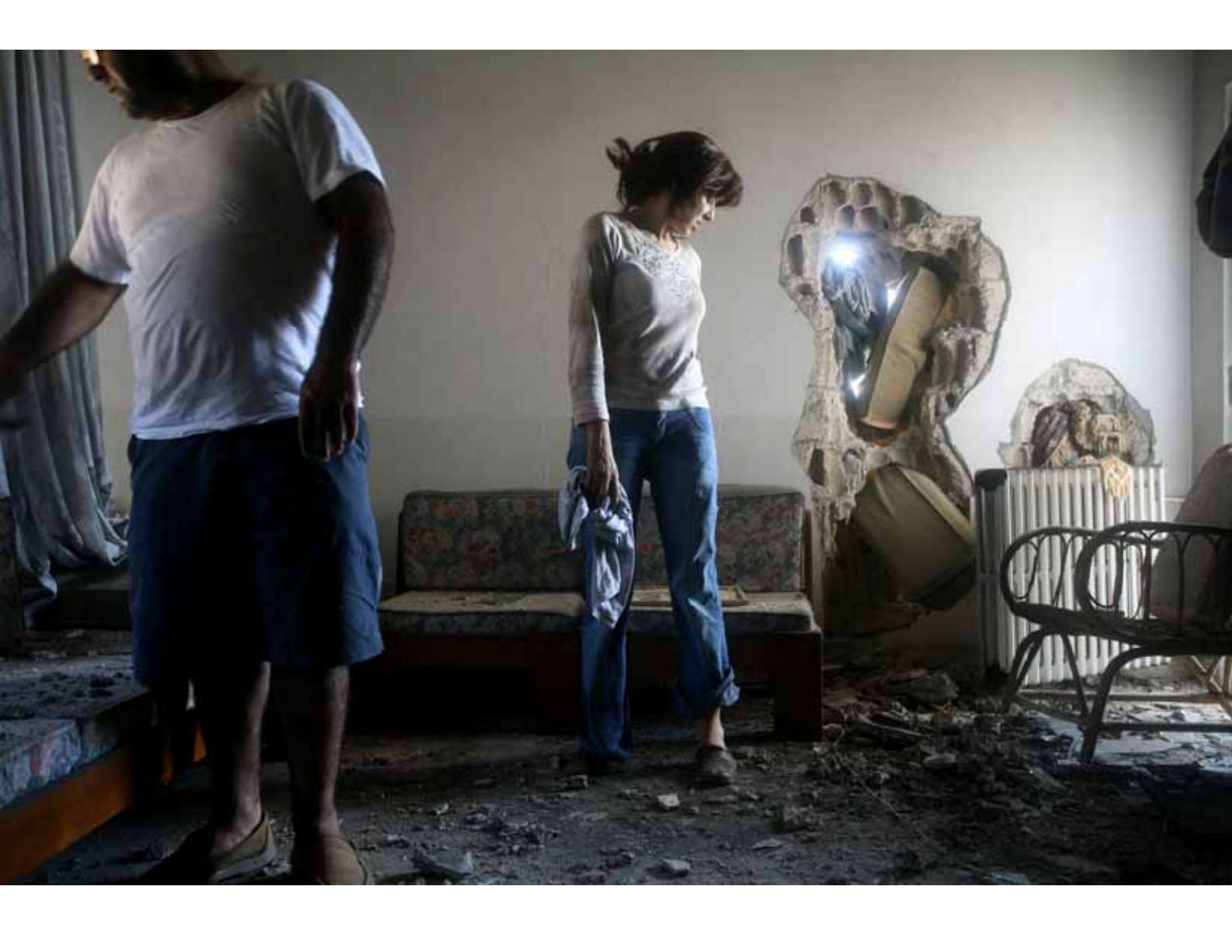
Chapter 20 The right to property and peaceful enjoyment of possessions