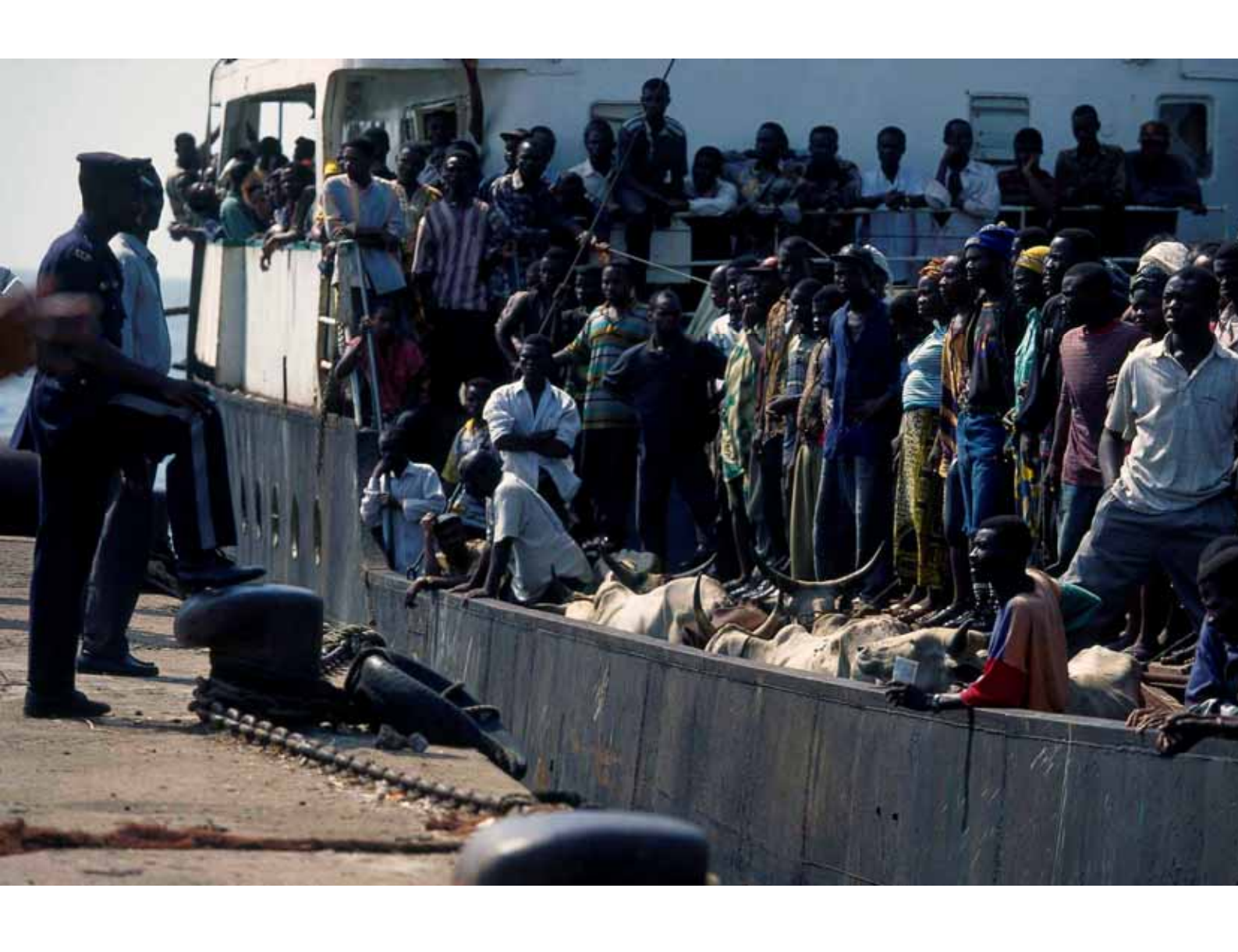
Chapter 9 The principle of non-refoulement