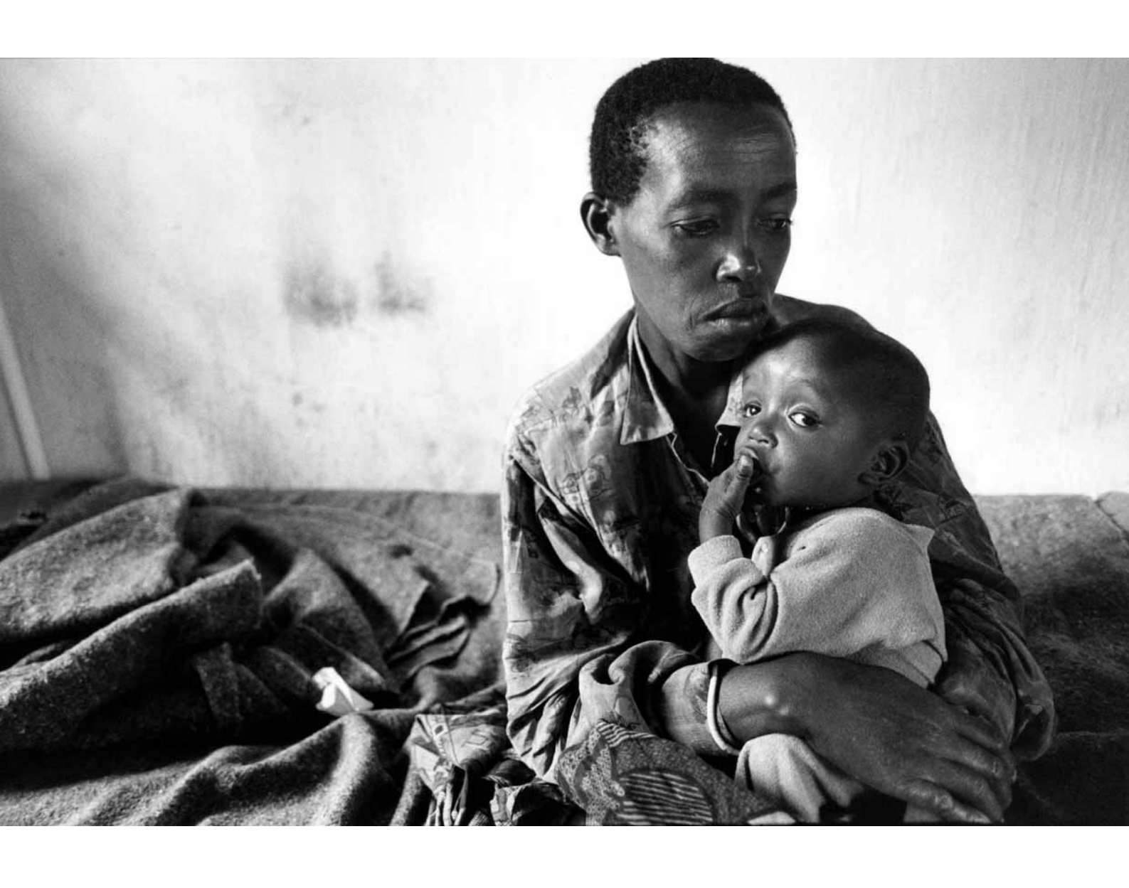
Chapter 6 HIV positive persons and AIDS victims