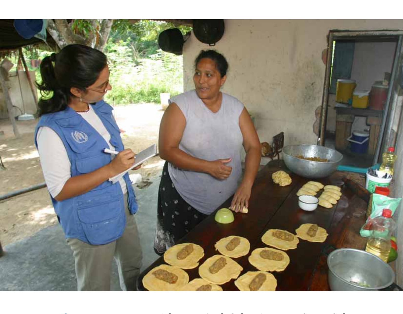
Chapter 12 The survival rights (economic, social and cultural rights)