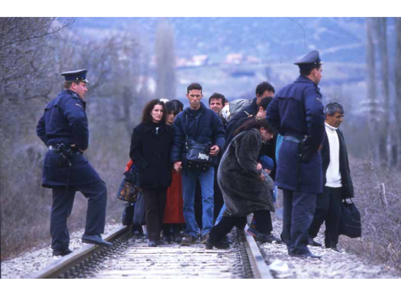
Chapter 10 The principle of non-discrimination