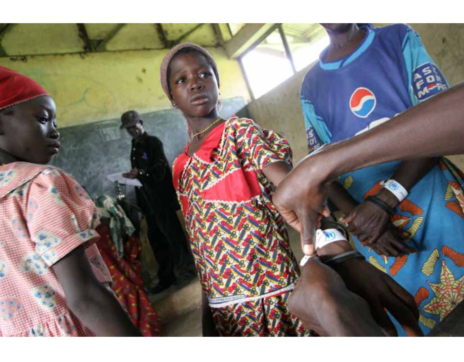
Chapter 13 The right to legal identity, status and documentation