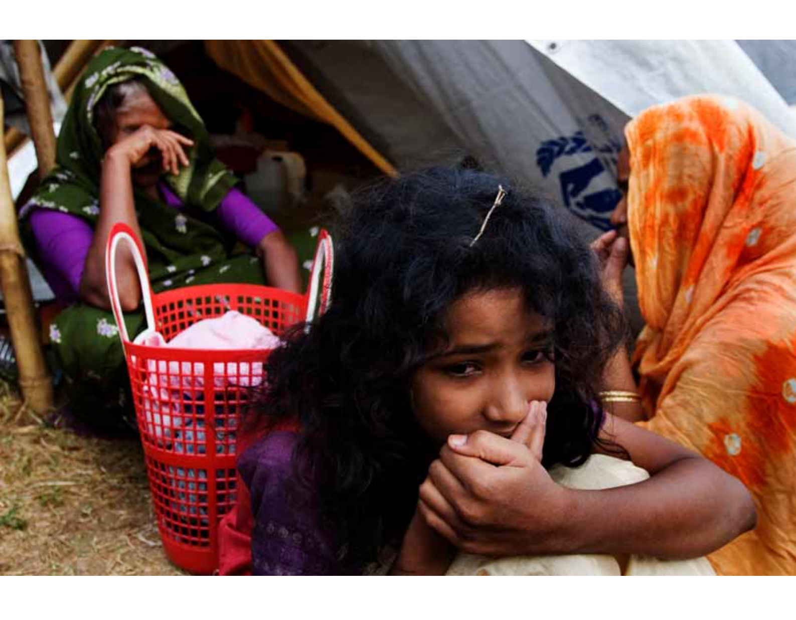
Chapter 2 Women and Girls