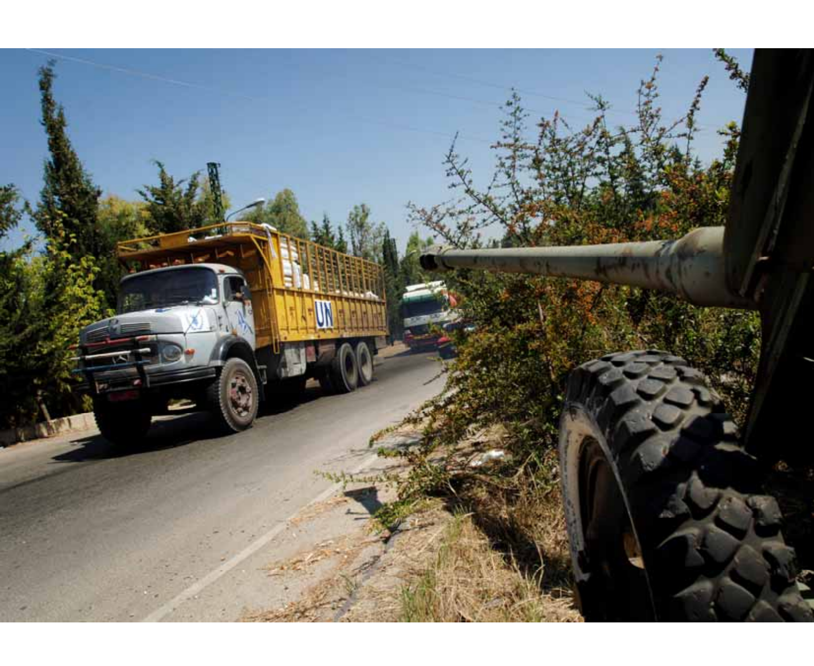
Chapter 1 Introduction: The convergence of international human rights law and international refugee law