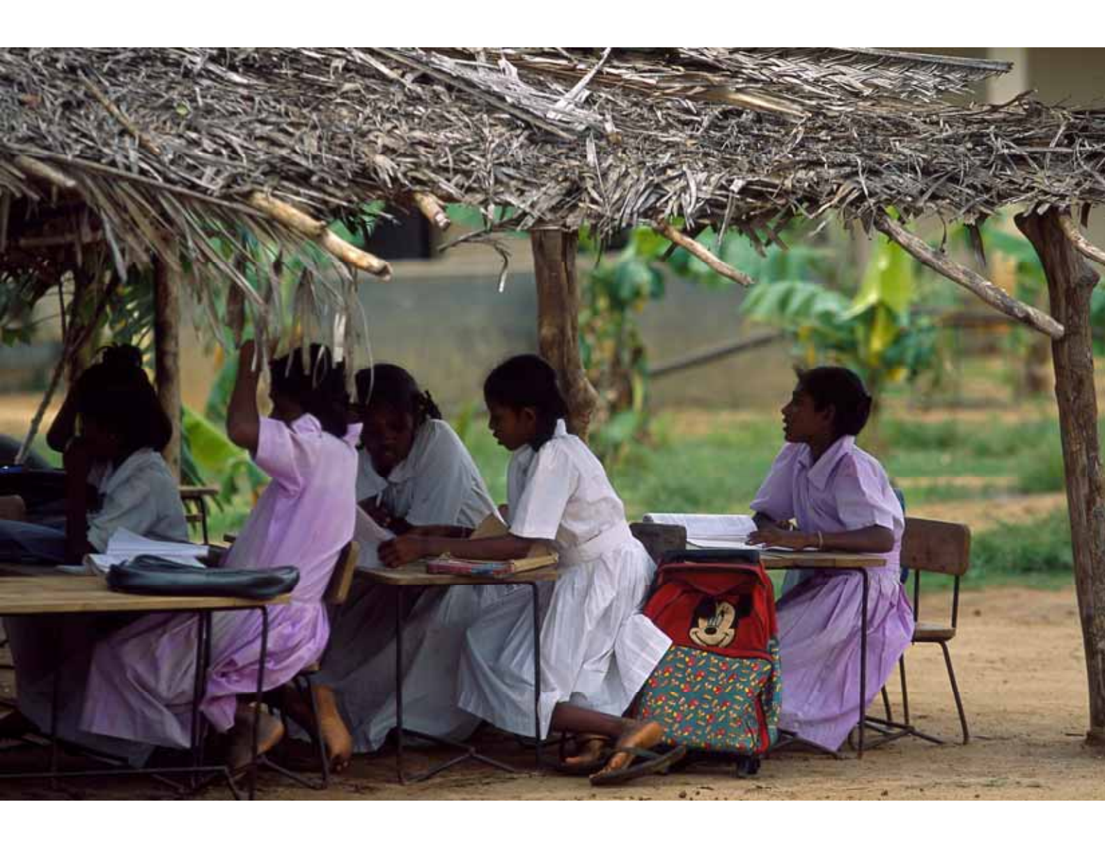
Chapter 19 The right to education