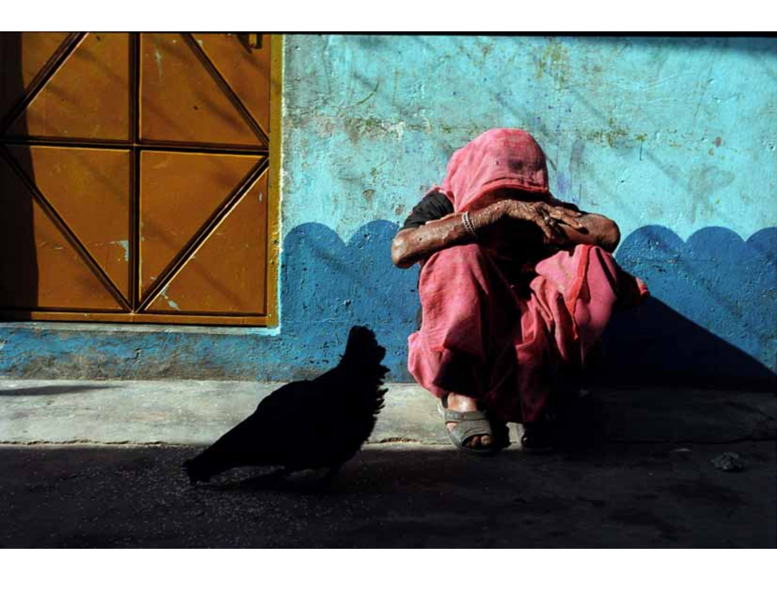
Chapter 7 Non-nationals