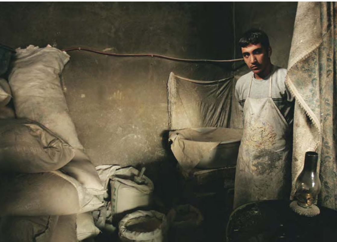
An Iraqi who fled sectarian killings and kidnappings supports his family by working as a baker in another part of Iraq.