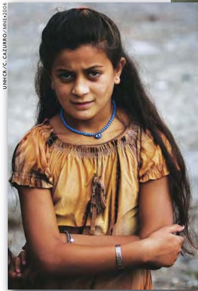
A displaced Roma girl from Kosovo living in a camp in Serbia.

The effort to protect internally displaced people in Darfur, Sudan, has been one of the hardest challenges in recent years.