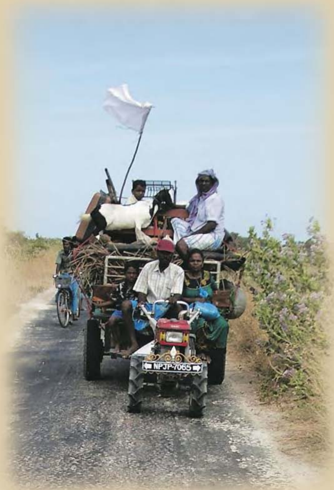
A family flees renewed fighting in Sri Lanka's Jaffna Peninsula.