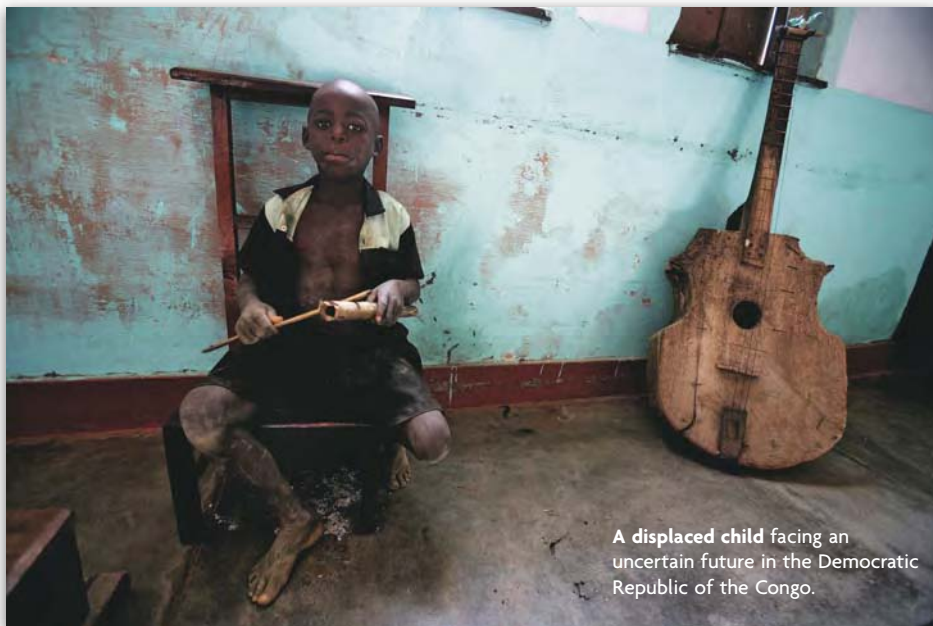
A displaced child facing an uncertain future in the Democratic Republic of the Congo.