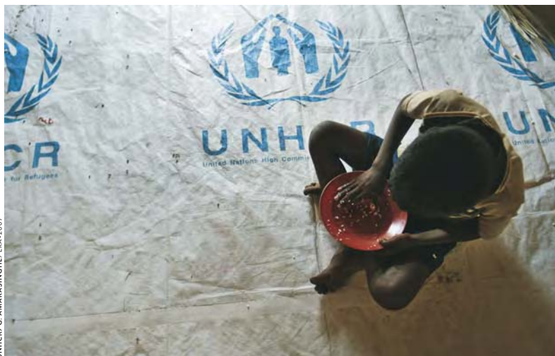
UNHCR provides some IDPs, such as this Sri Lankan boy, with shelter, income generation projects or other forms of assistance.

The overall number of internally displaced has remained relatively stable at around 25 million since the beginning of the new millennium. However, by 2007, UNHCR was caring for 12.8 million IDPs in 24 countries, or double the number just one year earlier. There are three main reasons for this sharp increase: new waves of internal displacement in several countries – notably Colombia, Iraq, Lebanon, Sri Lanka and Timor-Leste; the development of UNHCR's activities in connection with its new responsibilities under the cluster approach; and the upward revision of IDP figures in countries such as Colombia (now 3 million) and Côte d'Ivoire (where the number of IDPs was raised from 38,000 in 2006 to 709,000 in the light of a new, more detailed survey of the situation).