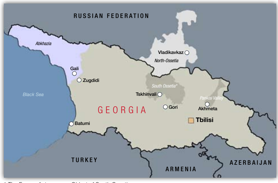
* The Former Autonomous Oblast of South Ossetia