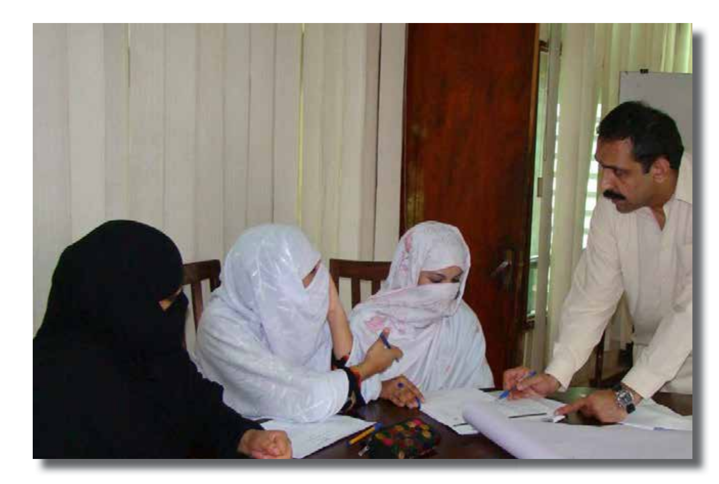
— GROUPWORK DURING THE FOCUS GROUP DISCUSSIONS