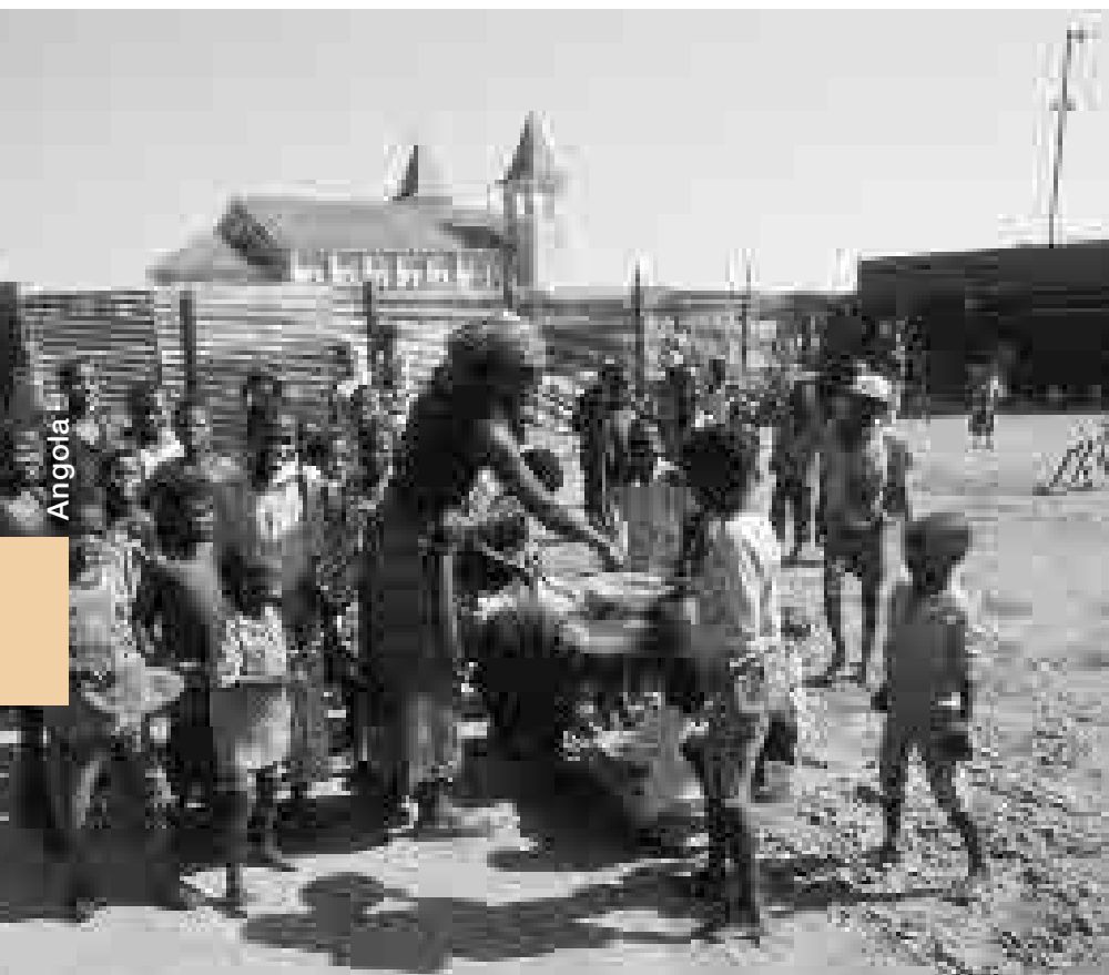
IDPs and refugees in Malanje at a feeding centre.

By increasing access to the rural provinces bordering neighbouring countries (Moxico, Cuando Cubango, Uige and Zaire), UNHCR will contribute to improved monitoring of return processes and the reintegration of all categories of the displaced population. The immediately desired impact includes the reduction of malnutrition, and of maternal and infant mortality rates. During the course of the operation, improved access will result in better situation analysis, which will in turn increase the likelihood of sustainable return and reintegration, and the consolidation of peace. It is expected that former refugees returning after many years of asylum will bring back skills and knowledge which will be an asset to local communities, particularly during the current transitional phase of national reconstruction.