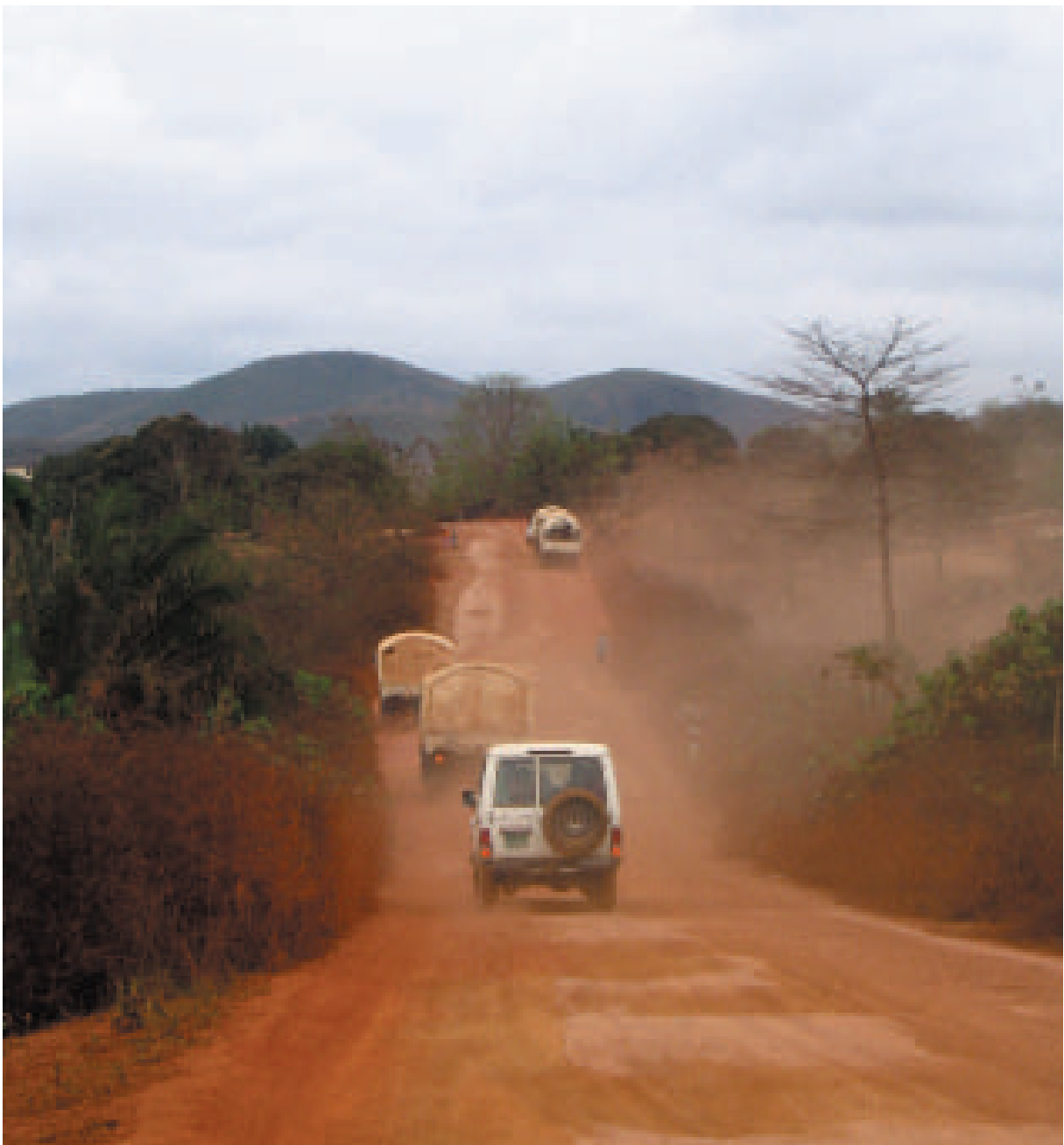
A repatriation convoy sets off from Kiowa reception centre, in northern Angola, which has been used to house transiting returnees from the DRC.

Government of Botswana to review the status of some 480 rejected asylum-seekers, primarily Somali, who are currently still living in Dukwi camp. The infrastructure in one sector of Dukwi camp will be upgraded in line with UNHCR’s minimum standards in anticipation of a consolidation of the remaining population and an eventual handover of the settlement to the Government of Botswana.