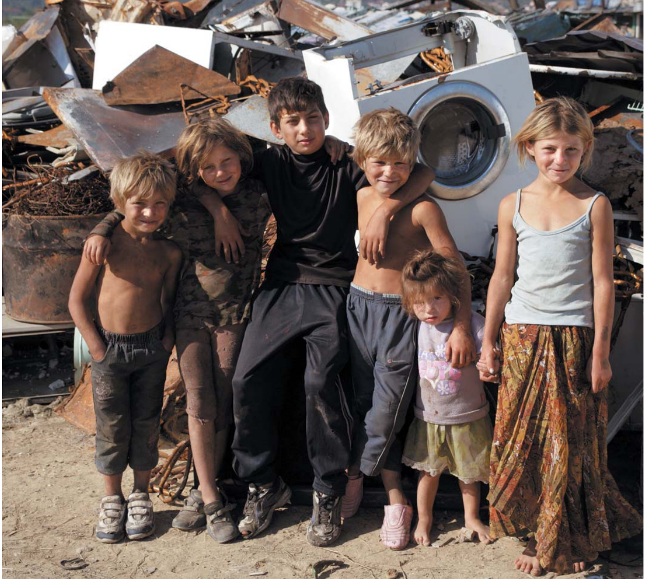
Many people of Roma ethnicity have returned to their homes in Bosnia. Now they must face the challenge of reintegration.

in 2007. UNHCR anticipates that only a small number of refugees will be resettled.