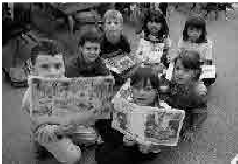
USA: Asylum-seekers of various nationalities attend primary school and learn English.

fund raising plan. In addition, many new donors were added to the database. Angelina Jolie, UNHCR's Goodwill Ambassador, helped to raise UNHCR's profile through public fund raising appearances.