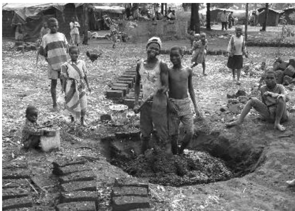
Promoting self-help and self-reliance: refugees from Burundi and Rwanda in Ngara camp producing mud bricks for construction.

of food were transported by the UNHCR fleet to the camps every two weeks. The number of refugees transported increased from approximately 48,000 in 2000 to 82,000 in 2001. The transportation of new arrivals from the border entry points to the camps in the Kigoma Region remained a major task for the fleet with some 15,000 new refugees arriving in Tanzania from the DRC. Throughout 2001, 35,000 refugees were transported to or from camps and trucks continued to transport construction and rehabilitation materials for the establishment of new structures.