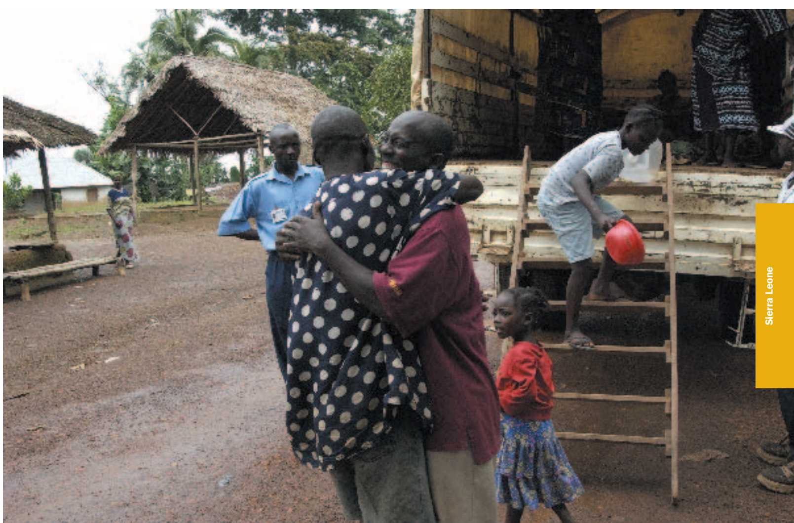
Sierra Leone: On 21 July 2004, the final UNHCR convoy from Liberia crossed over the Mano River bridge into Sierra Leone carrying 286 refugees. This convoy carried the last of some 272,000 refugees who returned home after Sierra Leone's brutal 11-year civil war ended in 2000.

Seed rice, groundnuts, cassava cuttings and agricultural tools were provided and 240 farmers received agricultural training. Processing facilities such as cassava grinding machines were constructed for use by 2,000 refugee families in camps.