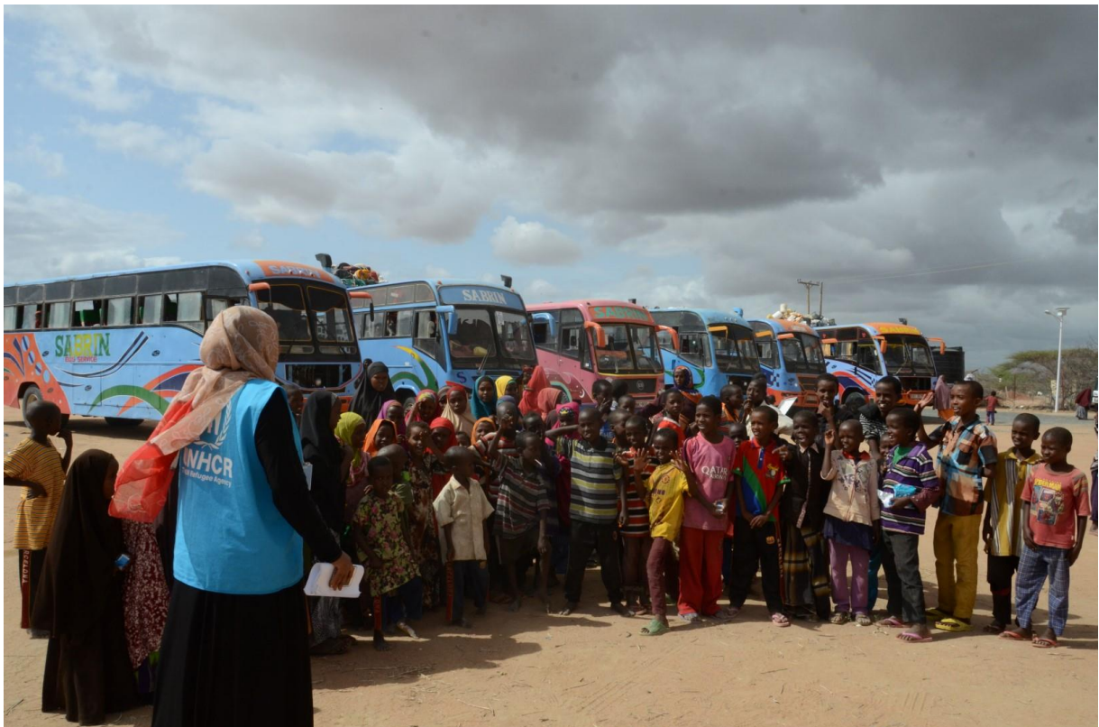
Refugee children gather at the Dadaab airstrip before departure to Somalia.