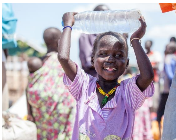
A new arrival minor holds a bottle of safe drinking water at Nadapal Transit Centre. UNHCR trucks water weekly to the the transit centre at the Kenya - South Sudan border. 70% of new arrivals registerde in 2017 are minors.

The above figures show the overall refugee population registered in the UNHCR database as at 15 August 2017. The figure is inclusive of the refugee population hosted at Kalobeyei Integrated Settlement.