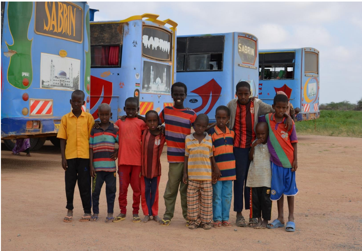
Refugee children from Somalia pose for a photo at Dadaab airstrip before embarking on their return journey.