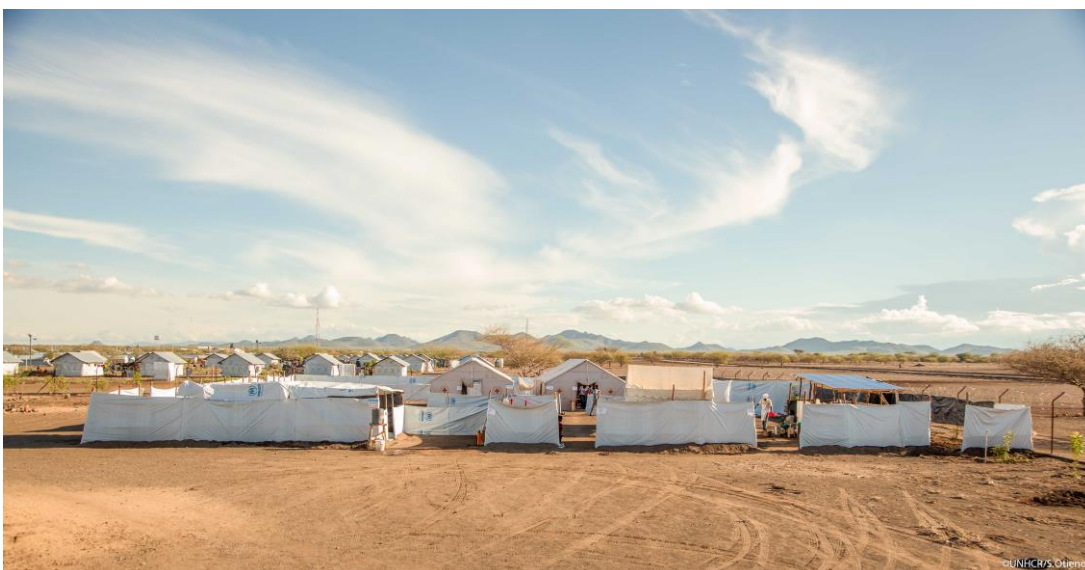
PHOTO: An aerial view of Kalobeyei CTC set up by UNHCR and Kenya Red Cross.