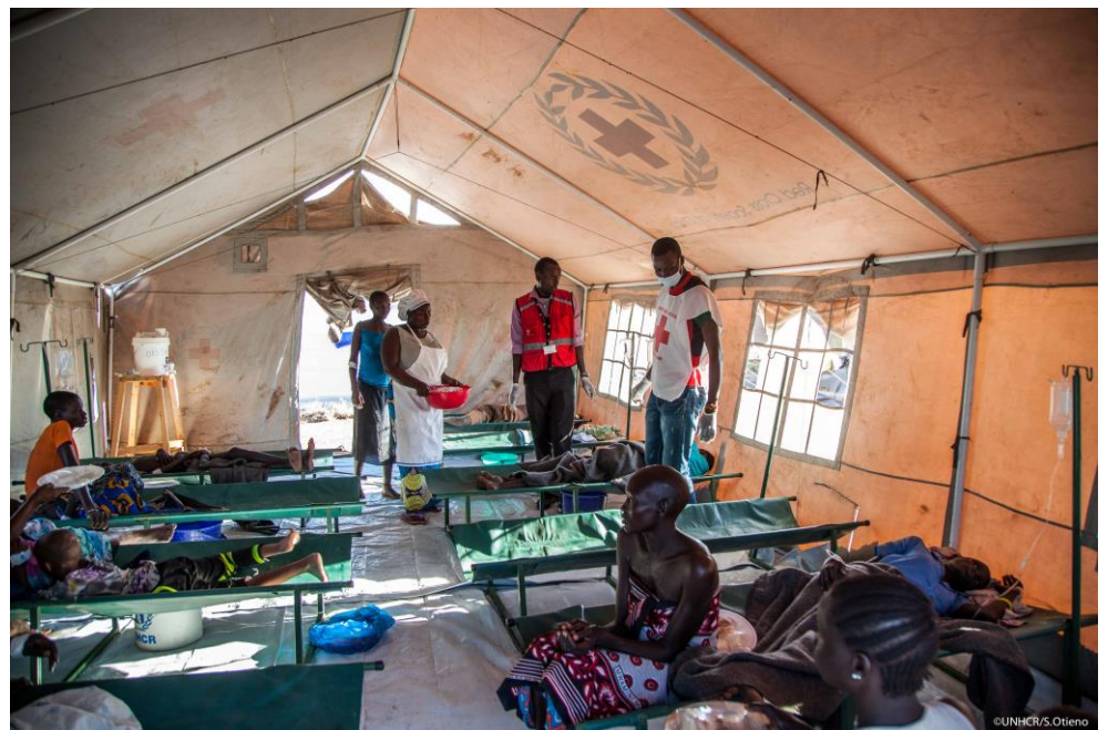
PHOTO: Patients recovering from Cholera at Cholera Treatment Centre (CTC) in Kalobeyei, Kenya Red Cross doctor (in red visibility vest) attends to a patient.