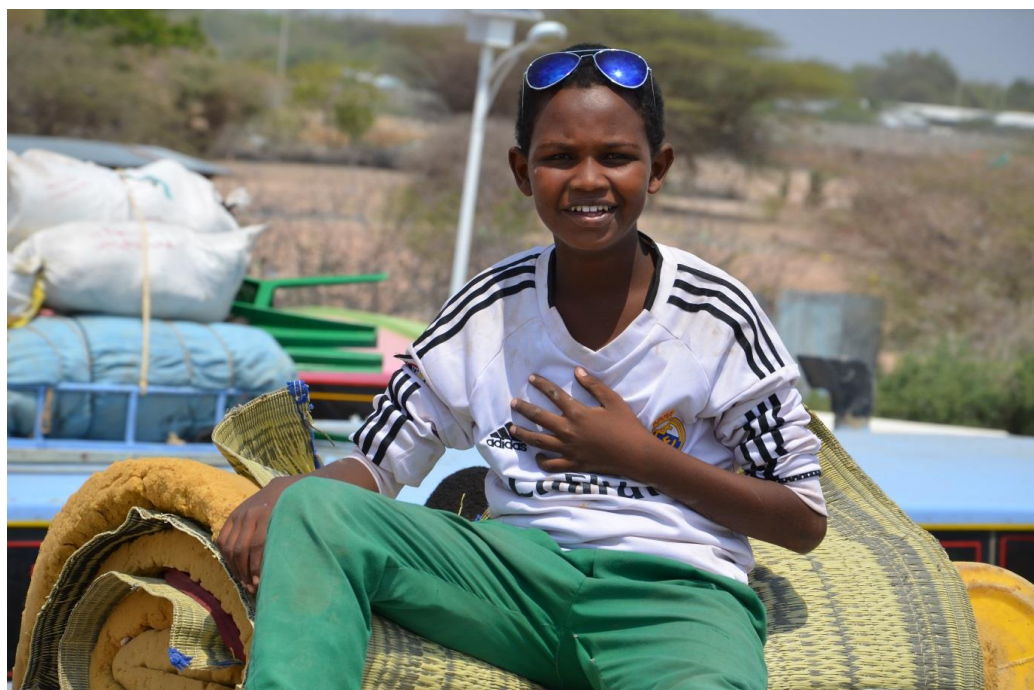
A child checks on his family's luggage before the Voluntary Repatriation journey to Somalia begins.