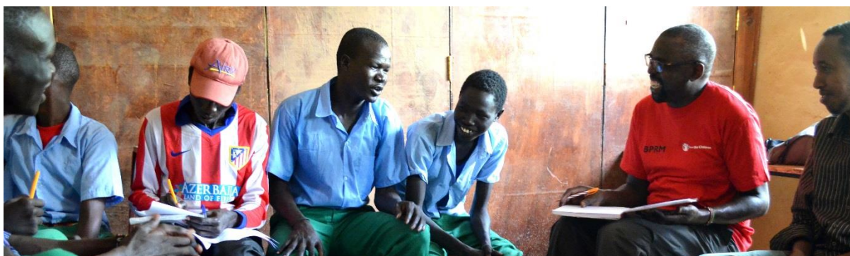
Young people share their views at a forum organized by UNHCR's partner, Save the Children, in Dadaab.