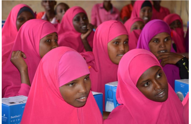
School girls listen attentively at a classroom in Dadaab refugee camp