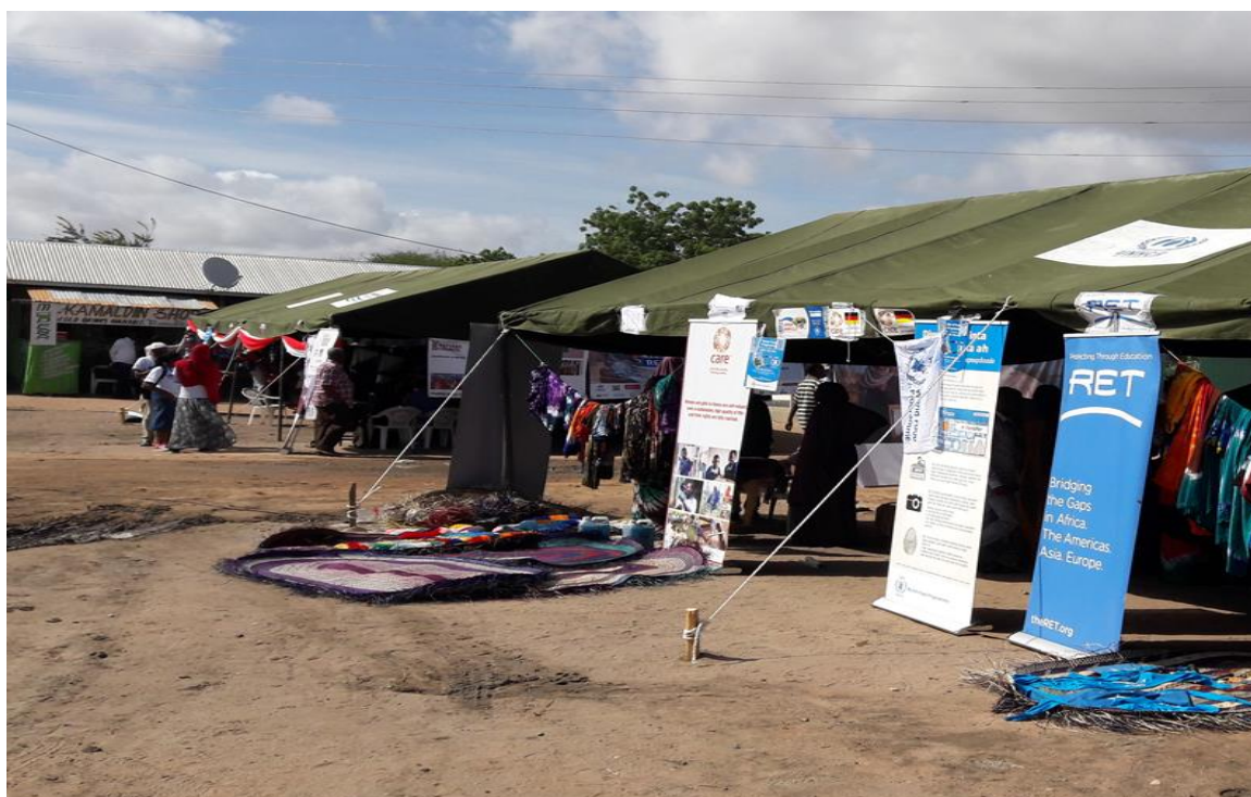
Refugee wares on display during the Market Day event in Dadaab as part of World Refugee Day celebrations.

Clothes, electrical equipment, beauty products, some traditional Somali food, and household items, were among some of the items on sale. The event is one among many that are organized ahead of World Refugee Day.