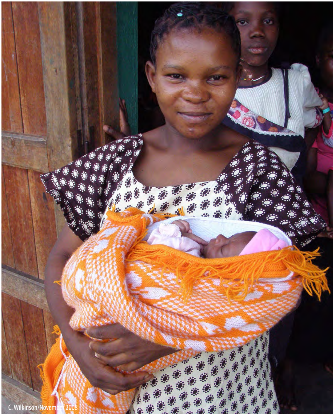
C. Wilkinson/November 2008

Young child: a child aged between 12 and <24 months (sometimes referred to as 12-23 months).