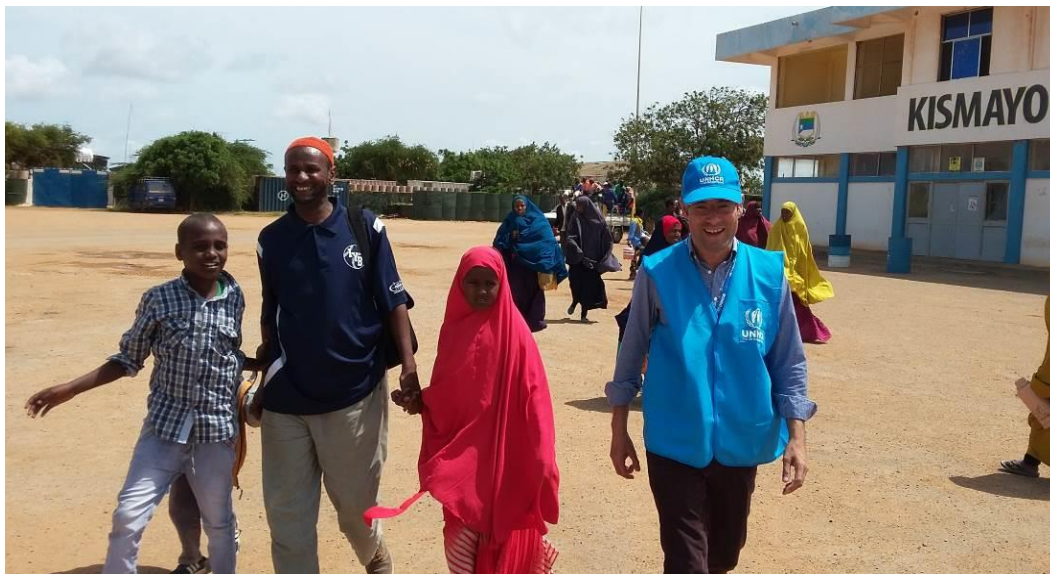
Somali refugee returnees from Kenya welcomed by the UNHCR staff in Kismayo, Somalia.