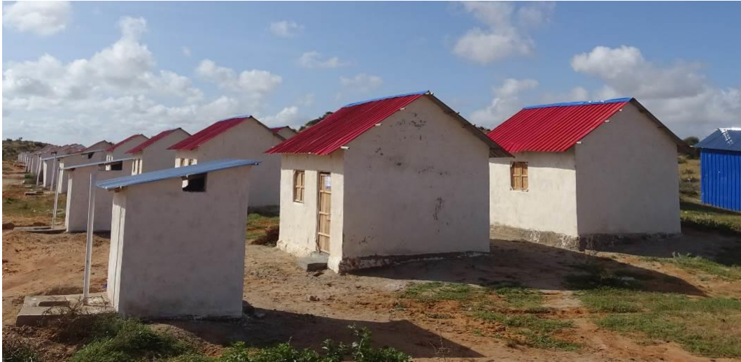
Newly constructed shelters and latrines in Kismayo. Shelters will become new homes for returnees to help them to restore their lives in Somalia. © UNHCR / July, 2017