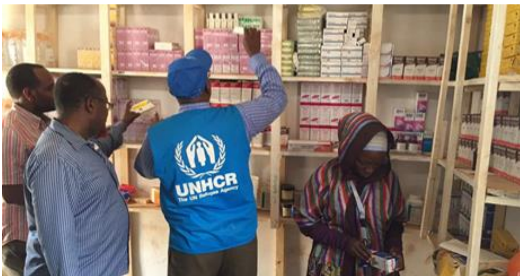
UNHCR supplied the MCH centre in Baidoa with medical drugs.