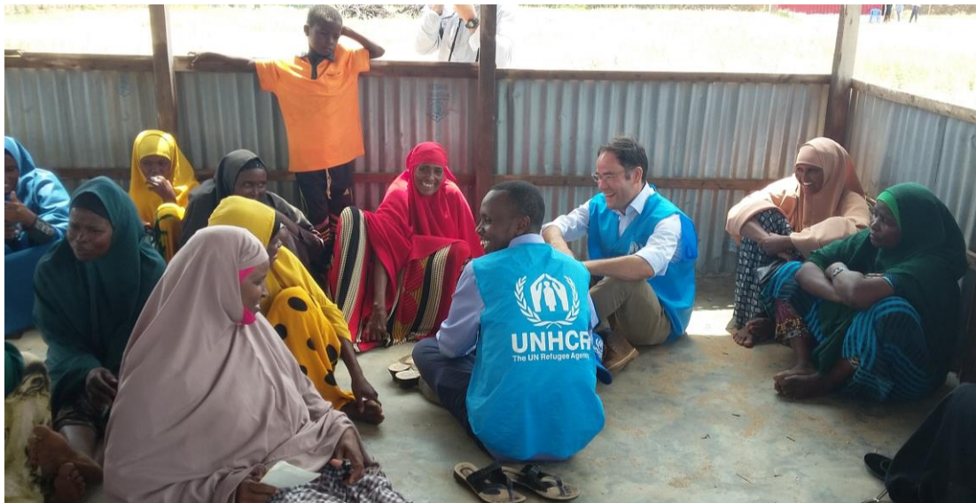
UNHCR staff briefed returnees about the assistance and services in Somalia. © UNHCR / July, 2017