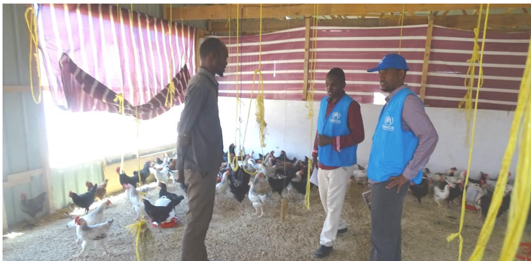
UNHCR staff together with partner monitored poultry project in Kismayo. Around 10 to 20 chickens will be distributed to each of 220 beneficiaries. © UNHCR / July, 2017