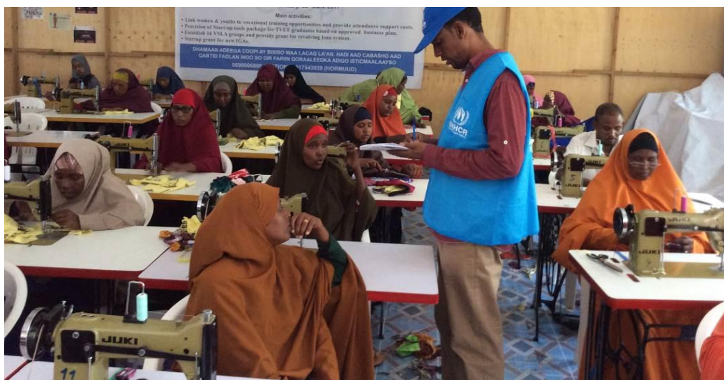
Somali returnees and IDPs in Mogadishu obtaining skills in tailoring for the second month. © UNHCR / July, 2017