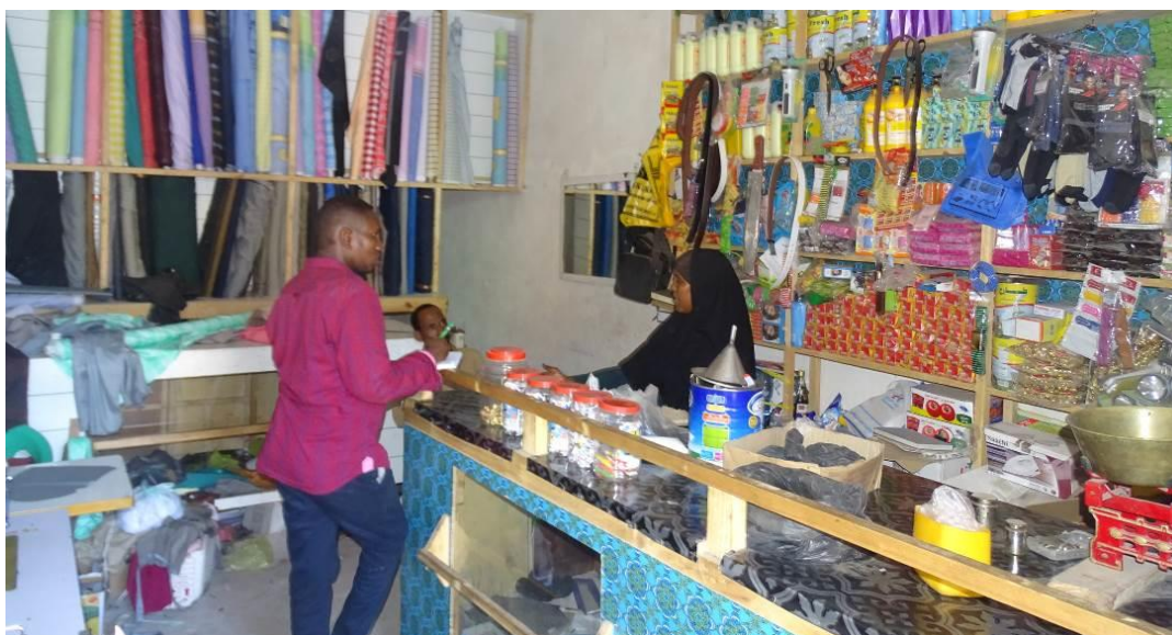
Somali returnee opened a retail shop in Kismayo after received training on business and microfinance. © UNHCR / July, 2017