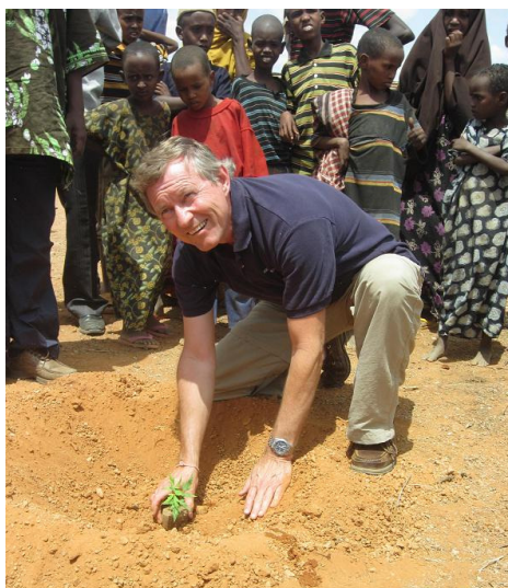
IKEA FOUNDATION CEO PLANTING A TREE AT THE SITE OF A PROPOSED MARKET PLACE, KOBE CAMP.