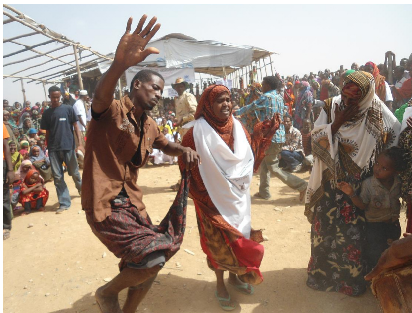
BOKOLOMANYO REFUGEES PERFORMING TRADITIONAL DANCE, WORLD REFUGEE DAY 2012.