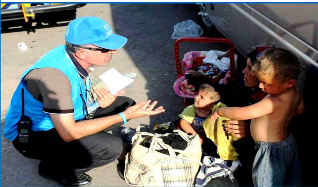
A UNHCR field officer interacts with a family from Syria in Iraqi Kurdistan.