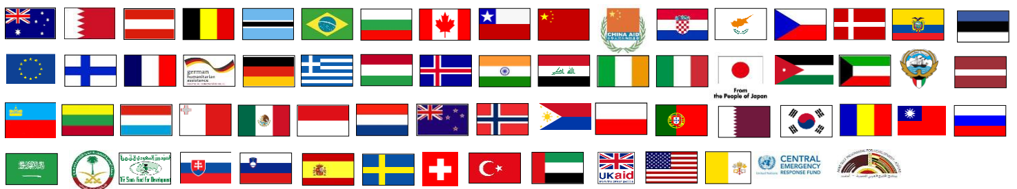
Funding also received from private donors, foundations and corporation