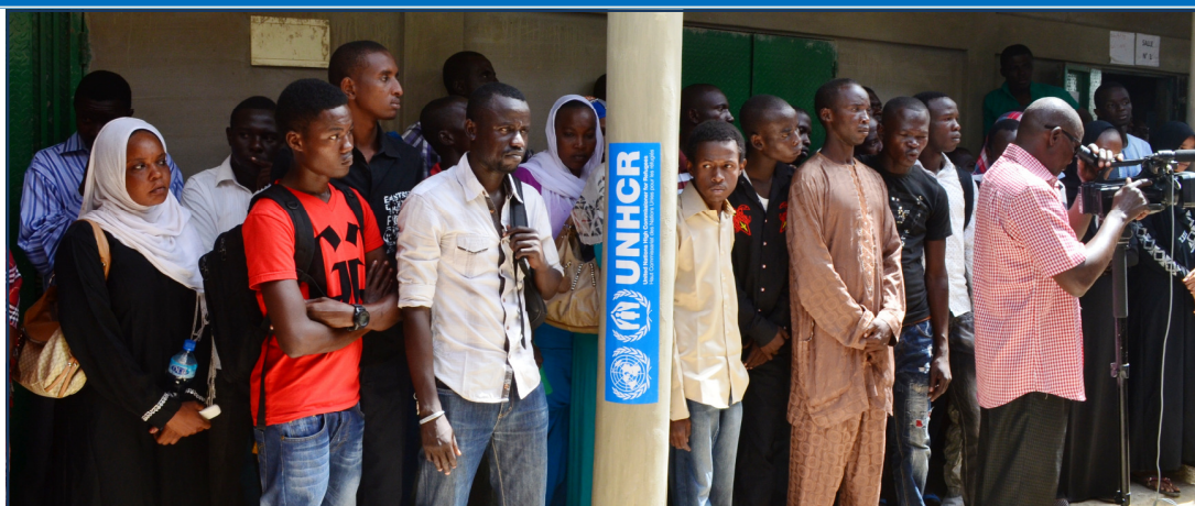
Ceremony at the EPICA granting newly-arrived CAR refugee students a scholarship, April 2014.

*Hosting villages: Koldaga, Bekourou, Dilingala & Doubadene