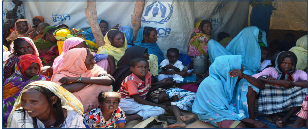
Sudanese refugee women and children at Abgadam Camp, eastern Chad. November 2013.