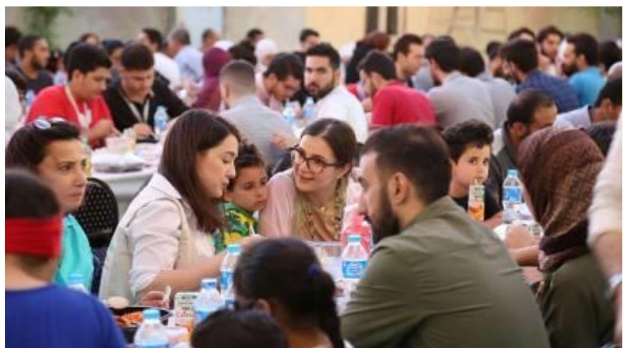
Syrian actress Kinda Alloush breaks fast with refugees on World Refugee Day

World Refugee Day 2017 took place during the Muslim fasting month of Ramadan. A World Refugee Day Iftar (breaking the fast) for refugee families was held at Fard Foundation in Cairo in collaboration with UNHCR. Children and parents learned about the culture of other refugee groups through different activities including storytelling, musical performances, and painting workshops, as well as presentations of traditional dresses and decoration. Syrian, Sudanese and Yemeni women participated in a cooking competition coached and judged by Egyptian celebrity chefs, including Wesam Masoud and Moustafa El Refaey, and Syrian actress Kinda Alloush.