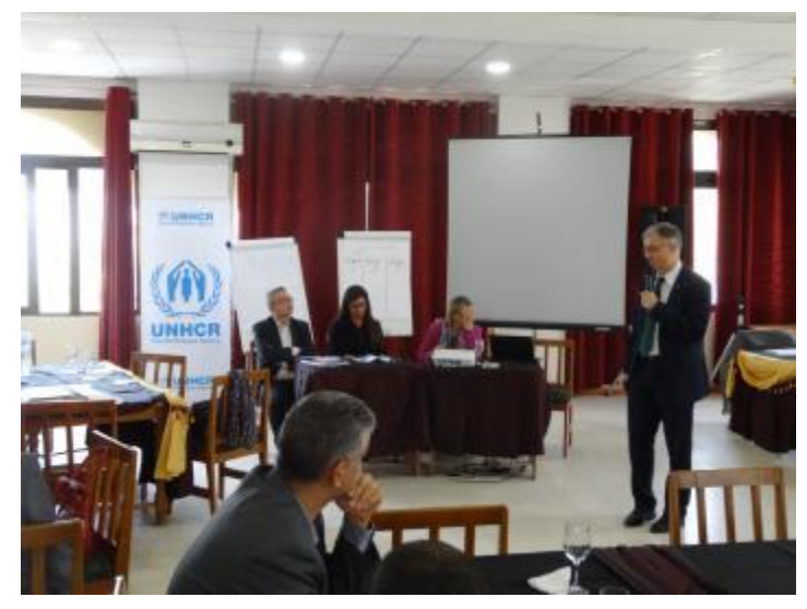
One week refugee law course "Le Maghreb protège 2"