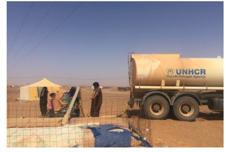
Water distribution at household level.

disposal facilities. According to the preliminary results of the 2016 WASH Knowledge, Attitudes and Practices (KAP) survey conducted, 21% of the camp population interviewed stated that trucks do not collect garbage from the street, with the remaining population confirming that trucks very rarely pass to collect waste.