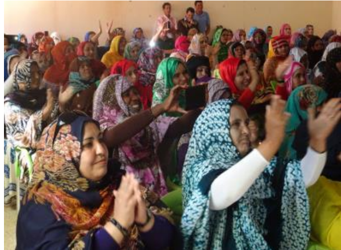
Sahrawi refugee women celebrating International Women's Day.