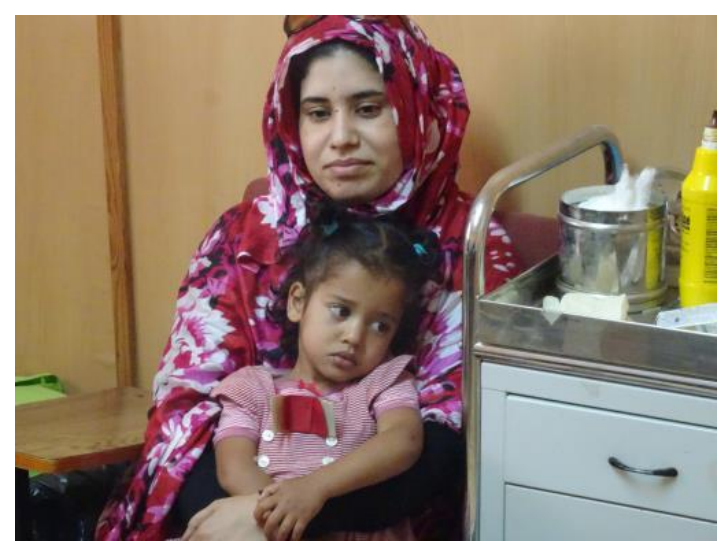
A mother comforts her daughter after a painful vaccination shot – Rabouni hospital.