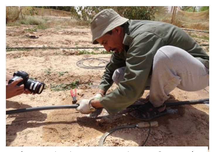
Oxfam Agricultural project at 9 June location.