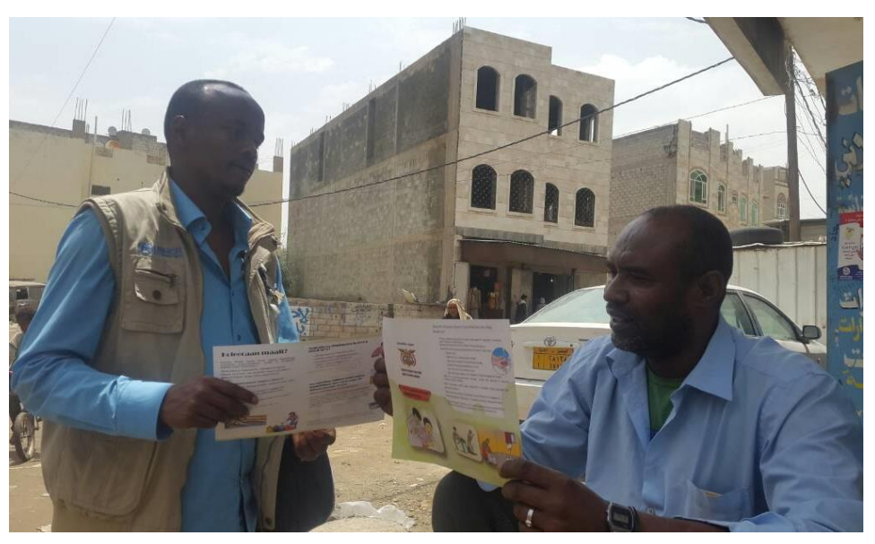
Cholera prevention and awareness activities are underway countrywide, equipping populations of concern with accurate information to protect themselves and their families from the epidemic.

The crisis in Yemen has been further compounded by the outbreak of cholera since April 2017, which has put much of the population at risk, including persons of concern. UNHCR efforts have largely focused on placing the refugee community at the centre of prevention efforts, providing them with accurate information on the spread of cholera, coupled with early case detection and surveillance, and the timely referral of suspected cases to UNHCR-supported health and community centres. Members of the UNHCR-led Protection Cluster also boosted cholera prevention efforts through the community based protection network (CBPN), tasking volunteers equipped with printed materials to reach out to communities in 25 districts, beyond areas with refugee populations. The prevention and awareness activities are currently taking place in public places including mosques, schools, hospitals and markets and are carried out in close coordination with authorities, and WASH and Health Clusters.