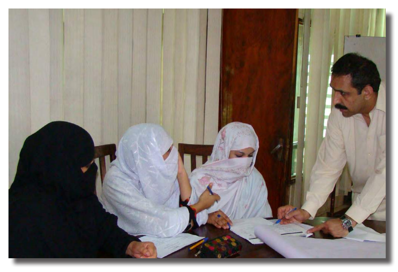
— GROUPWORK DURING THE FOCUS GROUP DISCUSSIONS