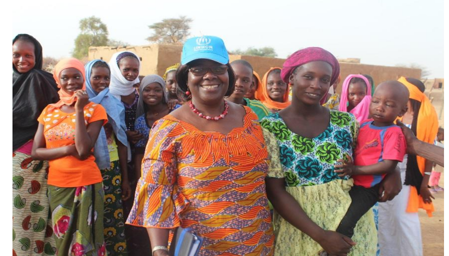
The Regional Representative in Ando, Ndioum, during her visit in the Senegal Valley region from 21-27 June 2017