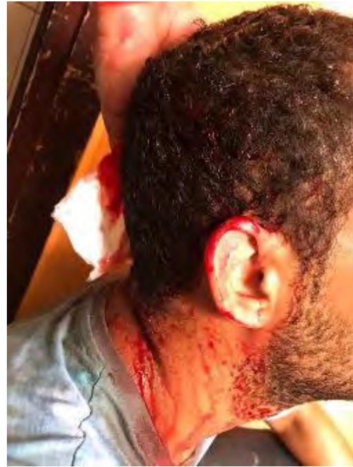
↑ Head injury of protester in Duraz, 23 May 2017