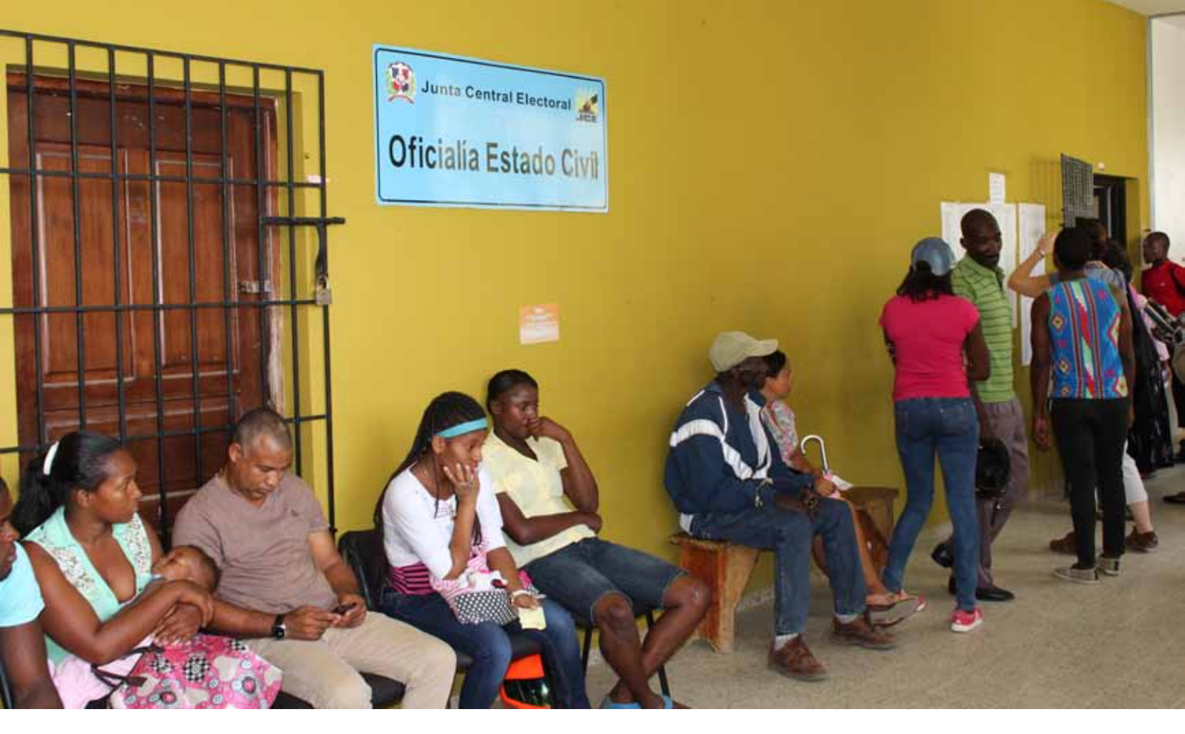
Civil Registry Office, El Seibo, June 2015. Dominicans of Haitian descent often have to queue for hours to enquire about their requests for identity documents. Their wait at local civil registry offices often ends with officials telling them to go to the Central Electoral Board headquarters in Santo Domingo, which in turn refers them back to the local offices.