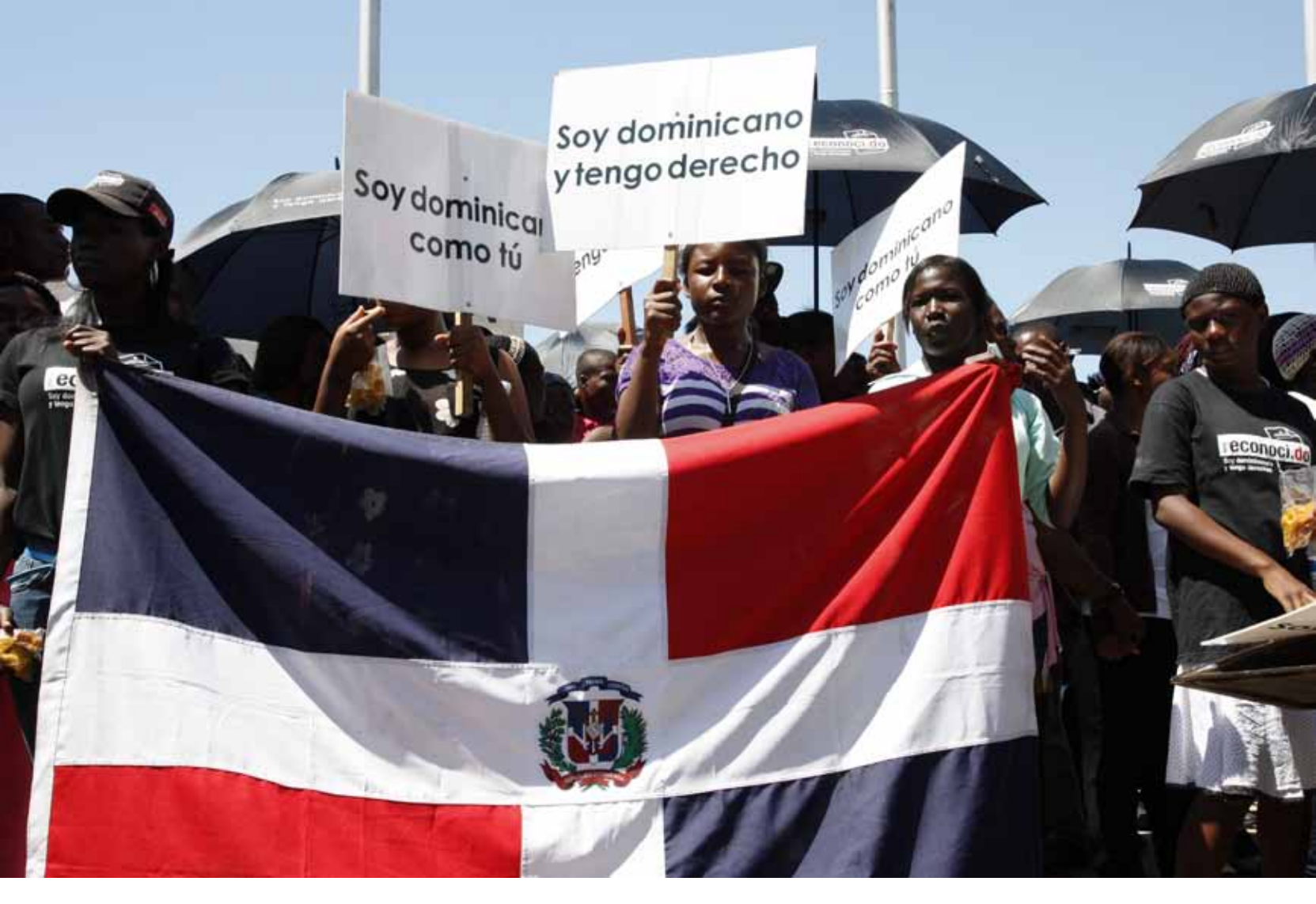
Demonstrators holding the Dominican flag urge the authorities to restore their Dominican nationality, Santo Domingo, March 2014. The signs read: "I am Dominican like you" and "I am Dominican and I have rights"