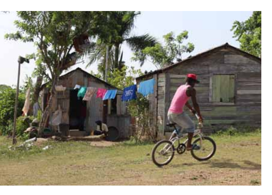
Batey in El Seibo province, June 2015.