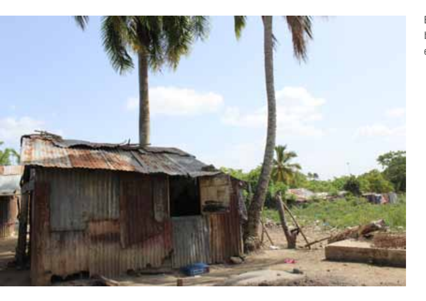
Batey Prado, El Seibo, March 2014. Living conditions in the bateyes are harsh. Residents often have no access to water, electricity or other essential services.

Dwelling where a Haitian mother and her 10 children live, El Seibo, June 2015. All the children were born in the Dominican Republic and were refused registration at birth. Their mother could not afford to enrol them on the naturalization plan.