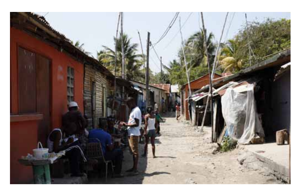
Batey Cangrejo, Puerto Plata, March 2014.