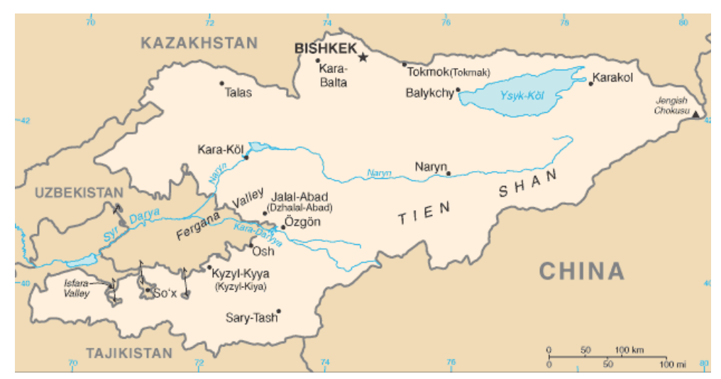
Map of Kyrgyzstan