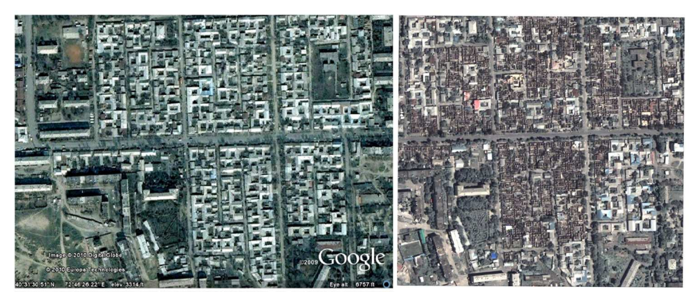
Comparison of buildings in the Cheremushki neighbourhood - 2007 vs. 2010 in Osh, Kyrgyzstan. Houses without roofs indicate destruction by fire.