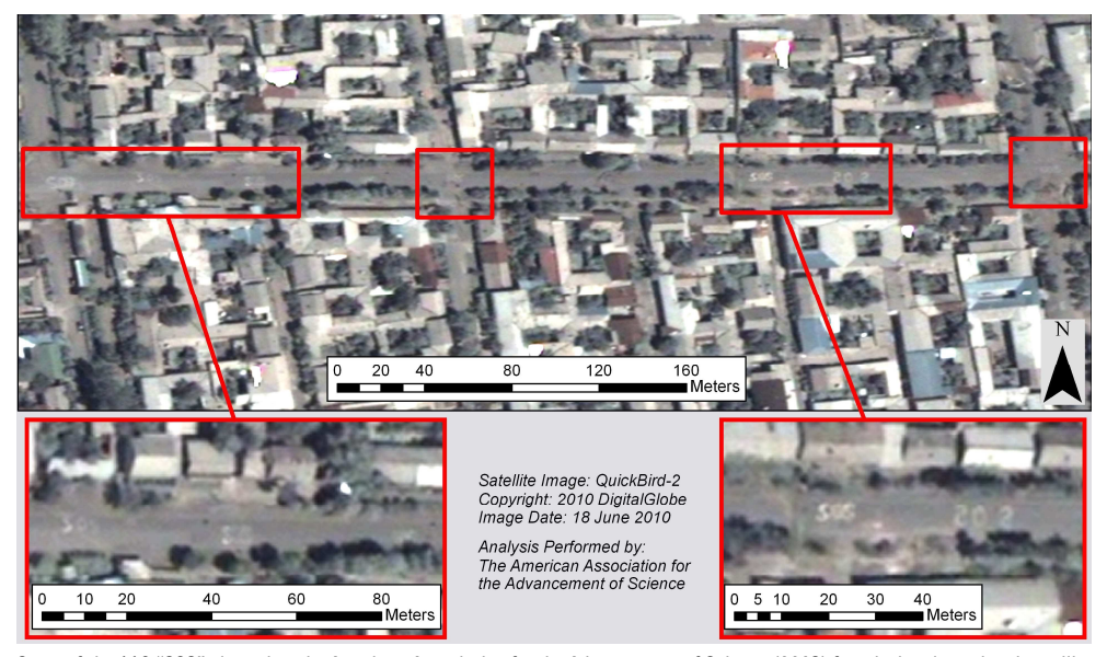
Some of the 116 "SOS" signs that the American Association for the Advancement of Science (AAAS) found when it analyzed satellite images of Osh, Kyrgyzstan, 18 June 2010.