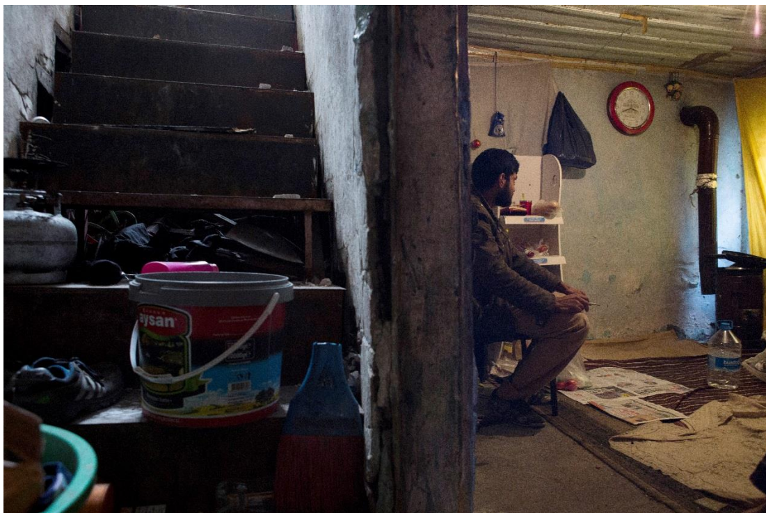
An Afghan asylum-seeker living in Istanbul. Afghans have no realistic prospect of either being integrated in Turkey or resettled to another country.

This chapter discusses the second requirement for the return of asylum-seekers and refugees to Turkey under the EU-Turkey Deal, namely that people are able to access what are known as “durable solutions.” UNHCR has identified three possible ways in which this obligation can be met: repatriation (when safe to do so) to countries of origin, integration in host countries, and resettlement to third countries. In the absence, to date at least, of a large scale resettlement programme from Turkey, and with little prospect of safe return for Syrians, and indeed many other refugees, the question of the long-term status and attendant rights of persons in need of international protection becomes particularly important. Turkey’s ability to provide durable solutions to refugees is severely compromised, however, by the continuing denial of full refugee status to non-Europeans.