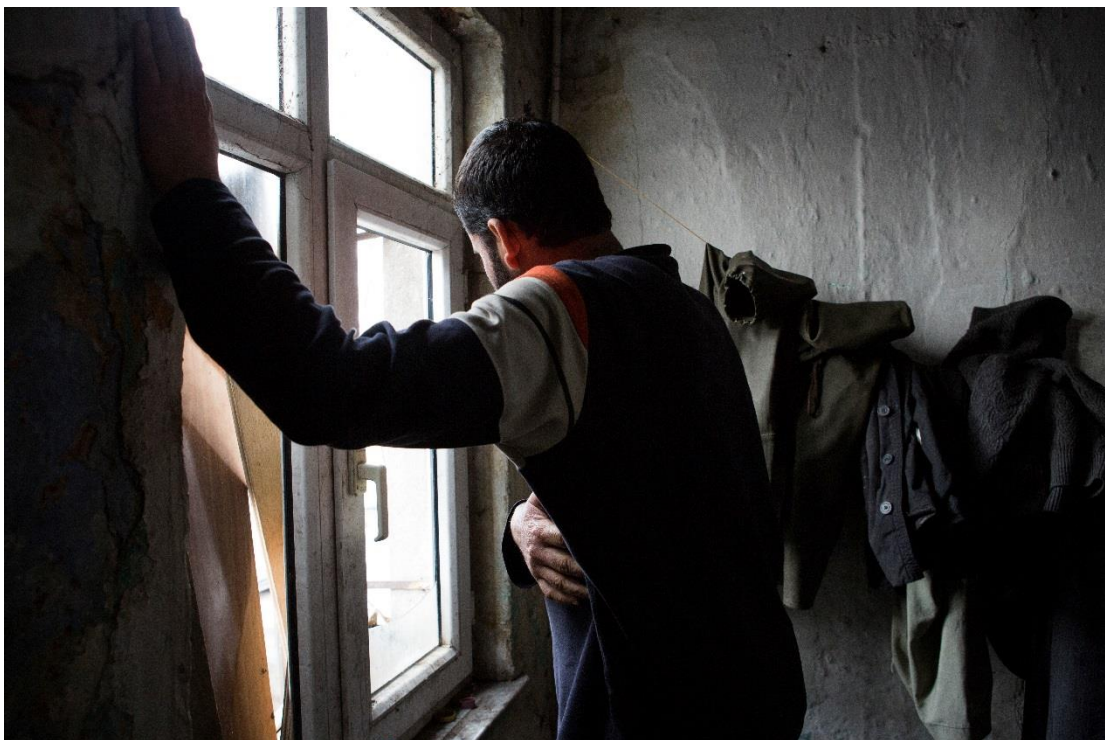
An Afghan asylum-seeker looking out from his flat in Istanbul.

EU member states should be looking at activating such a scheme, in meaningful numbers, without delay.