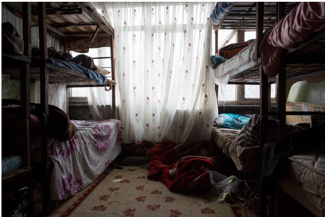
About 12 asylum-seekers from Afghanistan live in this room in Istanbul, below which is an industrial operation where the recyclable materials that they collect from the garbage are weighed and sorted.

This chapter assesses whether Turkey meets the third criterion for effective protection: access to means of subsistence sufficient to maintain an adequate standard of living. With state authorities unable to meet people’s basic needs – in particular shelter – combined with the significant barriers that people experience in achieving self-reliance, the reality is that Turkey is failing to provide an environment where asylum-seekers and refugees can be guaranteed the ability to live in dignity.