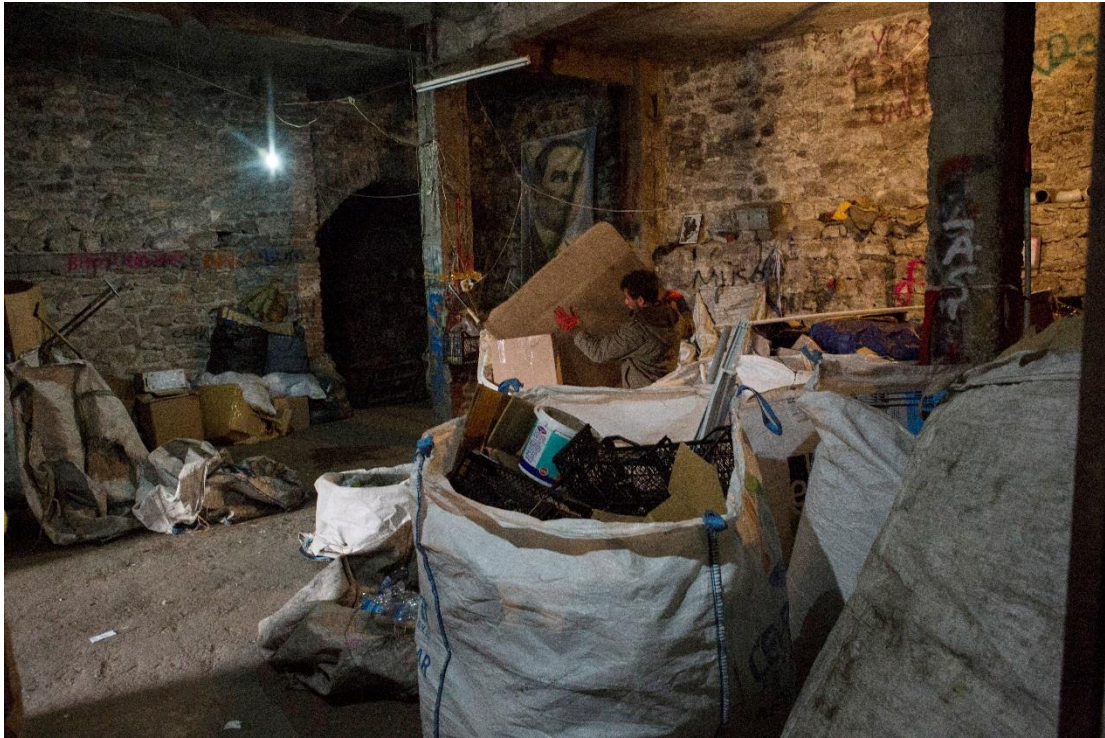
Many Afghan asylum-seekers support themselves in Istanbul by selling recyclable materials they collect from garbage bins, which is later weighed and sorted in depots such as this operation.

Children needing to work to meet the basic needs of their families is a widespread problem, despite this being contrary to Turkey's domestic and international legal obligations. 130 UN agencies report that among Syrian refugees in the country, "child labour is a common phenomenon." 131 In a 2015 survey of over 700 Syrian refugees in Istanbul, the most common reasons for children's non-enrolment in school were that the children needed to work to support the family (26.6%) and that the family could not afford the school fees (20.3%). 132 A Syrian mother of three boys, living in Gaziantep, told Amnesty International that the shrapnel injuries her husband sustained in Syria prevent him from working, and that the entire family of seven survives on the 5-10 Turkish Lira per day (about 1.75 to 3.50 USD) that her nine-year old son earns working at a grocery store. 133 An Iraqi man from Dohuk, living in Istanbul, said that his three children – a daughter aged 18 and two sons aged 17 and 16 – cannot attend school but must work instead. He said: "They must work; otherwise we cannot survive." The 18-year old daughter told Amnesty International that she and her brothers work in a textile factory five days a week, from 8 a.m. until 7:30 p.m., and each make 250 Turkish Lira (about 88 USD) per week. The father said that he was unable to find a job that did not require very long hours, which he is unable to do because he says he is old and tires easily. 134