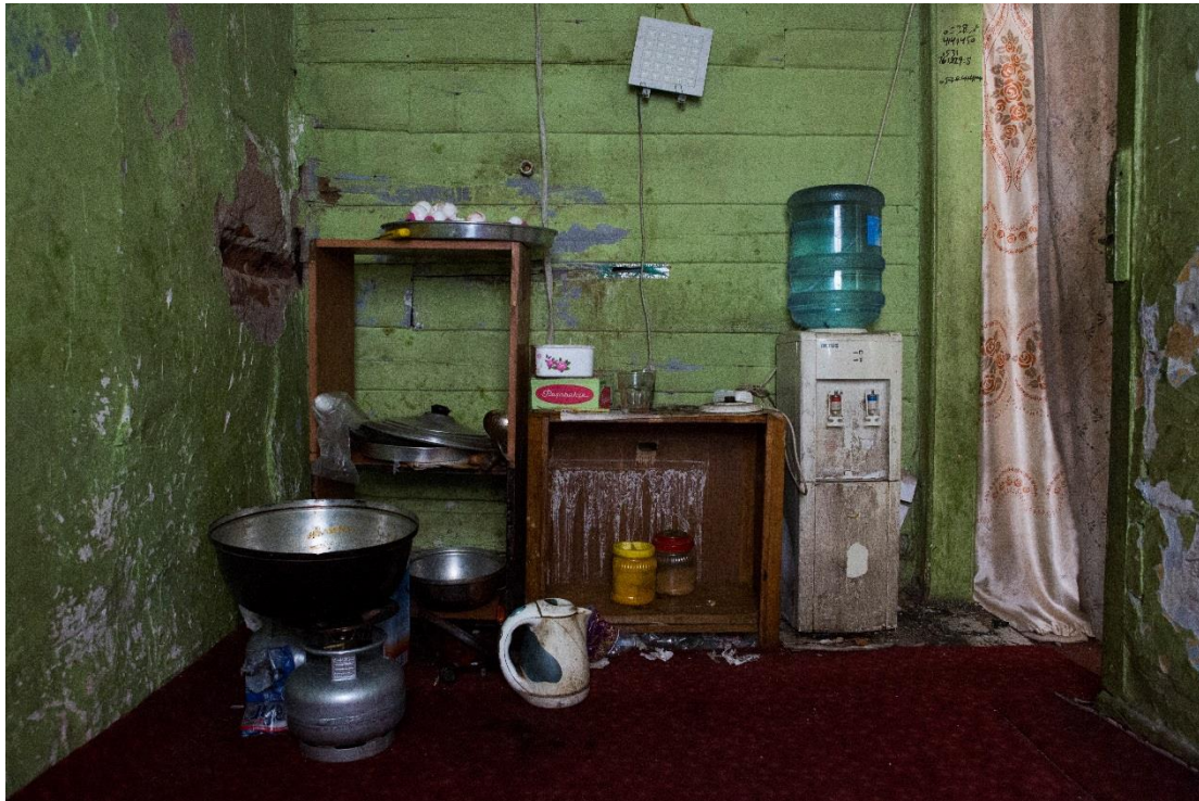
The kitchen for 15 Afghan and Pakistani asylum-seekers living in Istanbul.

living in one small and partly underground room; two single beds, a table, and a refrigerator occupied virtually the entire space. 95