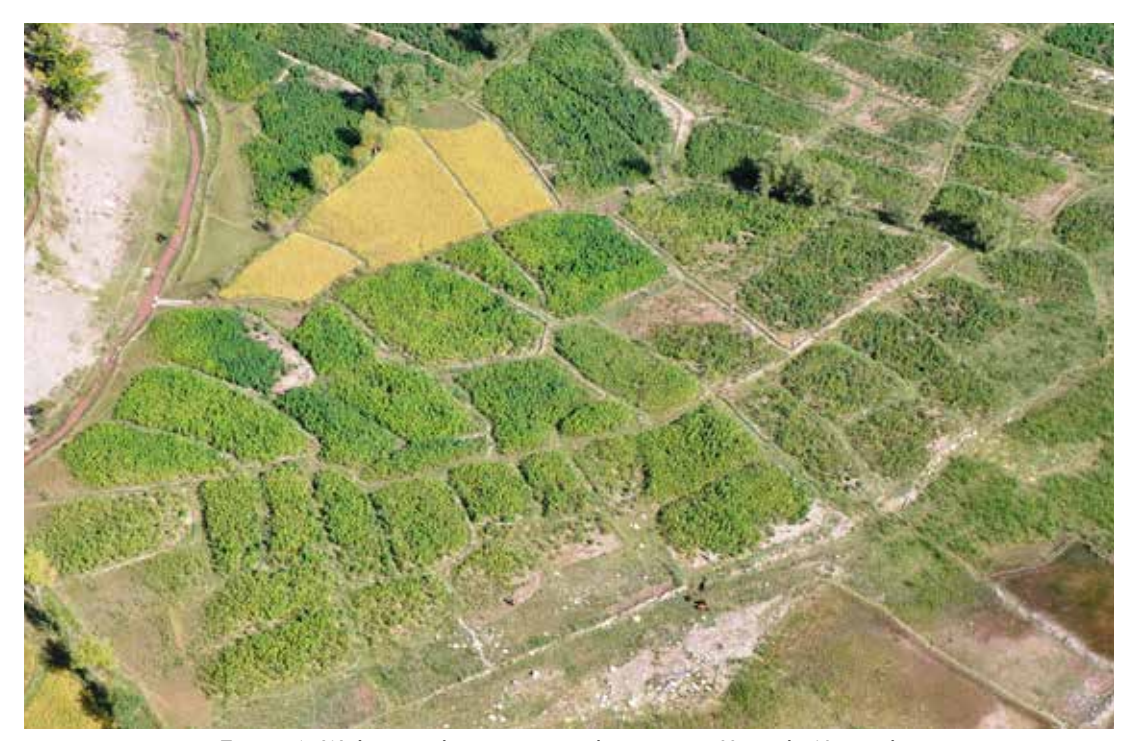
Figure 1: Widespread marijuana cultivation in Hisarak, Nangarhar

long conflict<sup>3</sup>. These have largely followed incursions by militants fighting under the banner of Islamic State (IS), known locally as Daesh. The Taliban and Daesh are now engaged in a fight over territory in the southern districts bordering Pakistan; a fight that has also led to the formation of an armed militia that, until recently, completely bypassed central government and linked rural elites from the upper valleys of Achin <sup>4</sup>with the parliamentarian and deputy speaker of the Wolesi Jirga, Hajji Zahir Qadir<sup>5</sup>. This same militia stands accused of beheading Daesh fighters and mounting their heads by the roadside in Achin in revenge for the execution of their comrades<sup>6</sup>.