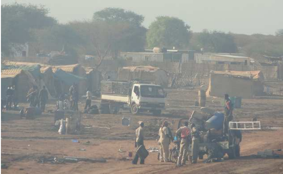
Looters in Abyei, 23 May 2011.

Former UNMIS staff told Amnesty International that on 21 May SAF overran Abyei town with T-55 tanks and multiple-rocket launchers and that five artillery shells landed in the UNMIS compound, injuring two Egyptian peacekeepers and destroying a UN vehicle. SAF looted the World Food Programme (WFP) warehouse, bringing in heavy trucks to remove two UN Development Programme (UNDP) generators and the food. UNMIS asked for the food to be returned but the SAF commander said he had instructions to distribute the food to Misseriya leaders.