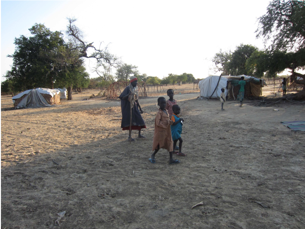
Displaced Abyei residents in Malual Achot camp, 23 November 2011.

More than six months after the May 2011 clashes the displaced Abyei residents are still living in dire conditions in hastily set-up camps or crowding in with relatives in host communities who have little or nothing to share. They are dependent on international humanitarian organizations for shelter, food, water and health care.