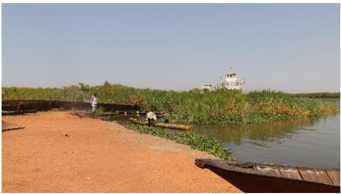
The river in Adok payam, Leer county, South Sudan, 6 February 2016.

"[After the attack began] we went to the river. The attackers came and found where she was hiding...but they didn't see the rest of us...They forced her to call out: 'The attackers left, come out,' but we knew she had been taken so we kept hiding ourselves...We heard when she was shot. When we did come out we found her and she was still alive. She told us what happened. She said they raped her before shooting her. She said: 'those people raped me,' and...she asked that we take care of her kids."<sup>71</sup>