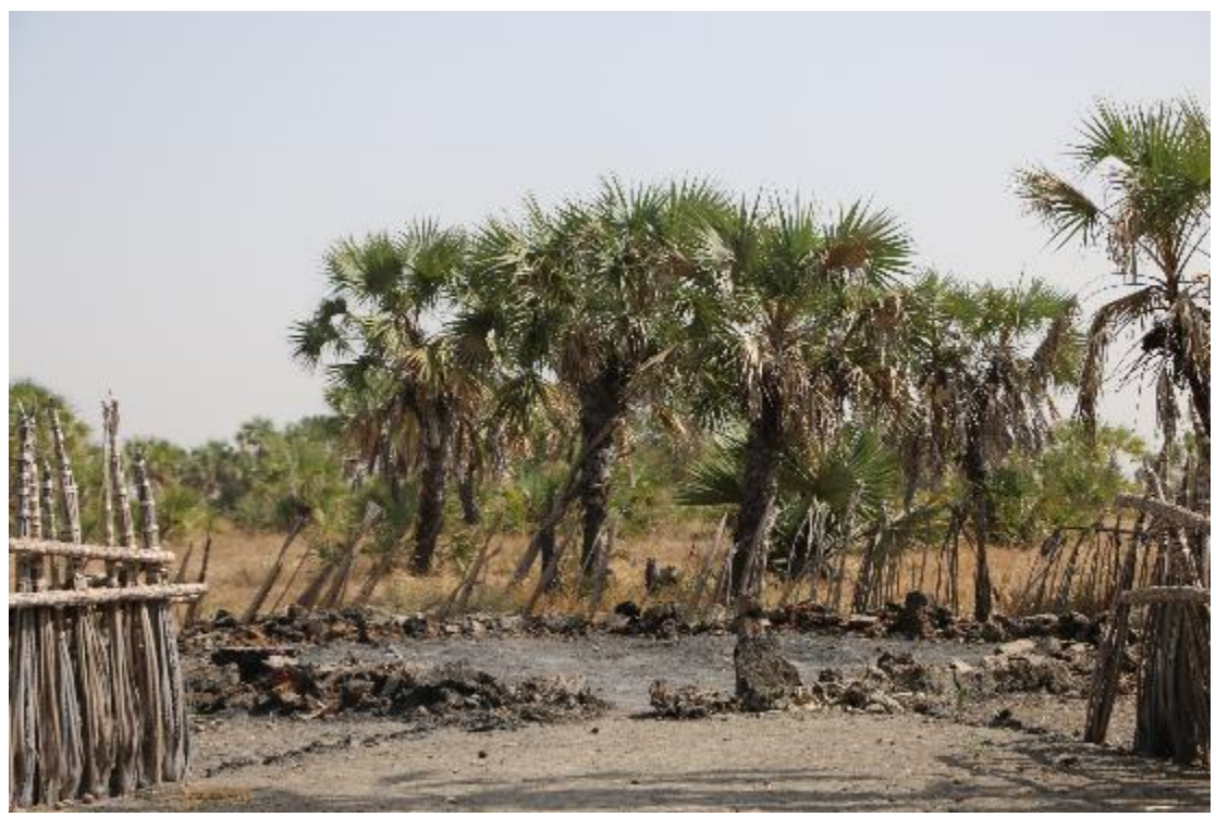
A home, burnt and looted by government and pro-government forces, Gandor payam, Leer county, South Sudan, 8 February 2016.

While physical insecurity no doubt contributed to the displacement of the civilian population from their villages in Leer county, many civilians explained that it was the burning of their homes, and the theft and destruction of food sources that caused them to eventually flee.