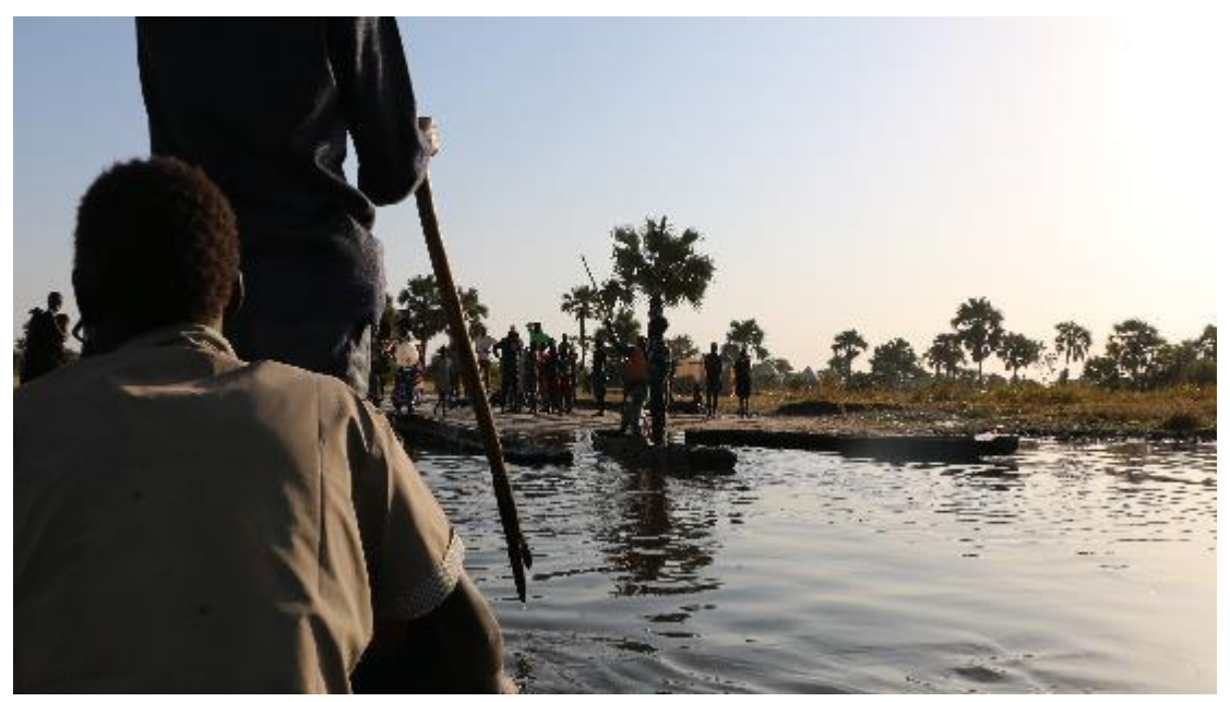
The swamp residents had to wade through between Toch Reah island and Thonyor to escape, which is traversed by boat even during the dry season, 10 February 2016.

In Leer I was raped every day, anytime they wanted. Even if you are milking cattle they call the girl inside and sleep with her."85