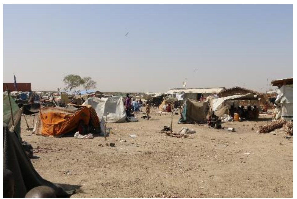
Fleeing violence and starvation, large numbers of Leer county residents have fled to the Bentiu Protection of Civilians camp, 29 January 2016.

After I was raped, I didn't leave [for the PoC] immediately. We used to hide ourselves in the swamp. When we left [for the swamp] we would hide our durra [in the ground] but soldiers sometimes find it and dig it up."80