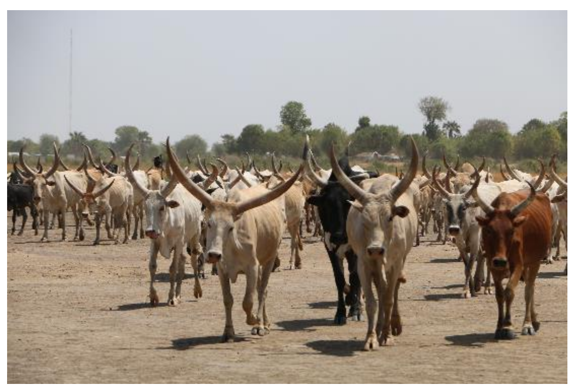
Cattle scarce in opposition controlled parts of Leer county, in Leer town, Leer county, South Sudan, 12 February 2016.