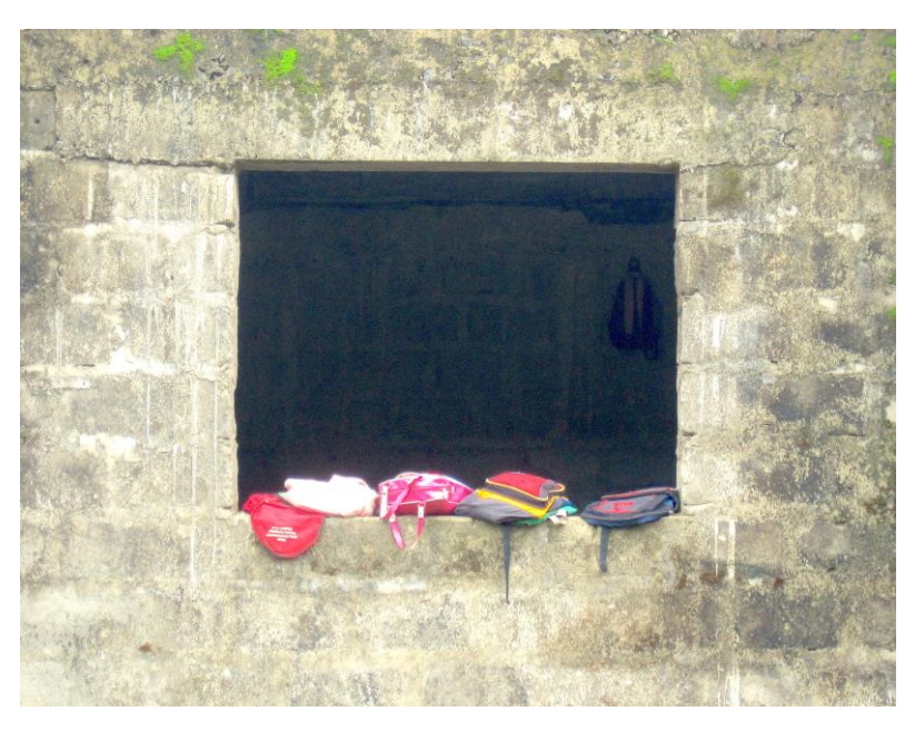
One of many emergency measures put into place as a strategy to reduce infection rates and get the spread of Ebola under control was to close borders and schools in June 2014. The schools remained closed from June due to the Ebola outbreak and re-opened on 14 April 2015.

Girls in Sierra Leone were particularly hit by the closure of schools between June 2014 and April 2015, one of many emergency measures put into place as a strategy to reduce infection rates and get the spread of Ebola under control.<sup>8</sup> With the Ebola crisis, girls also became more targeted for sexual violence including abusive and exploitative relationships. This trend was highlighted in a joint statement by expert organizations working in Sierra Leone in May 2015.