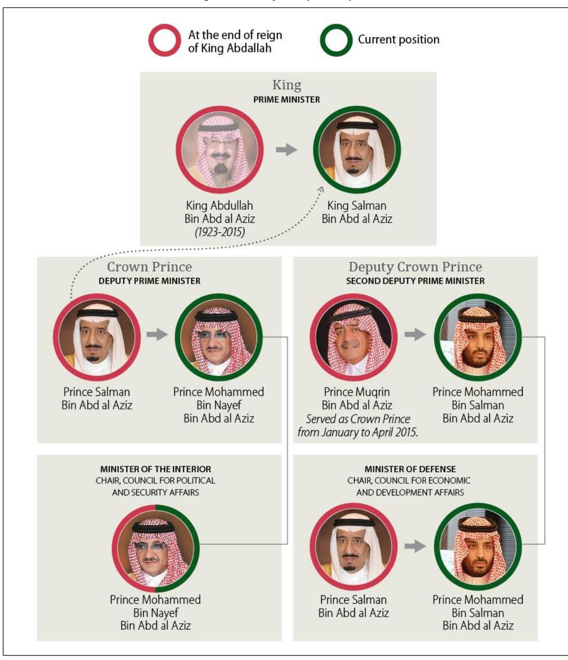
Figure 1. Saudi Leadership and Succession Changes

Changes Effective January and April 2015