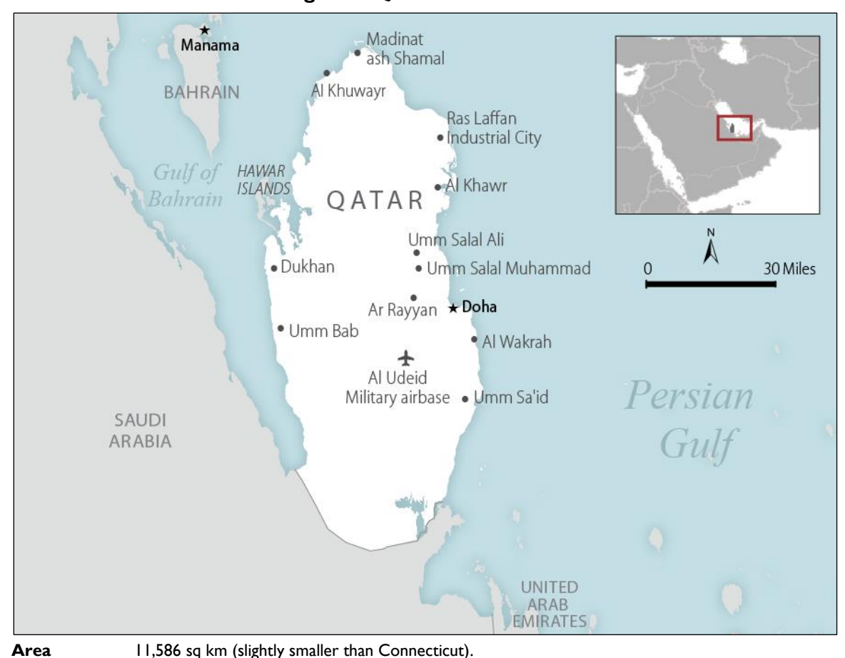
Figure 1. Qatar At-A-Glance

People Population: 2.2 million (July 2015 estimate), of which about 80% are expatriates.