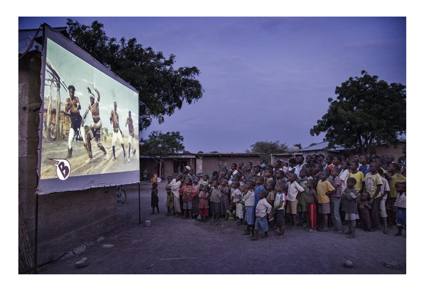
Children watch a video at an outreach event held by Agape AIDS Control Program, a nongovernmental organization working to end child marriage. Shinyanga, Tanzania. August 4, 2014.

For example, in Malawi, various government entities, officially coordinated by the Ministry of Gender, Children and Community Development, are mandated to tackle violence against women, including child marriages. The Ministry of Justice is responsible for the prosecutors, the Ministry of Gender, Children and Community Development for child protection workers, and the Ministry of Interior for the police. However, there is little communication or formal referrals on specific cases among these entities.