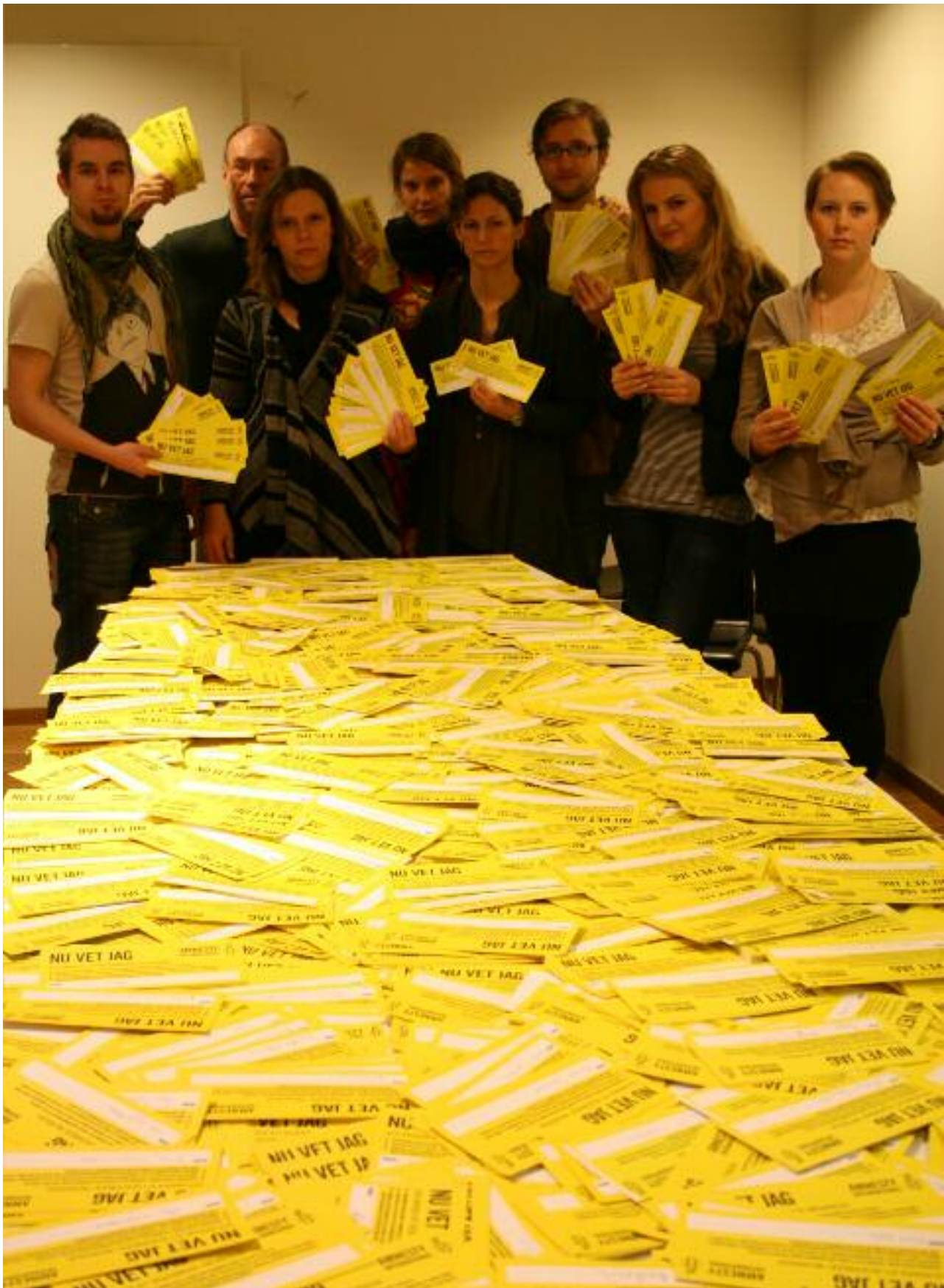
Amnesty International Sweden staff and volunteers with signed petitions to the Nicaraguan authorities.