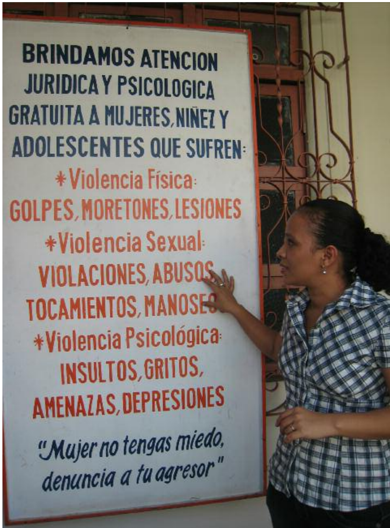
A psychologist at the entrance to a non-governmental women's centre run by the "Movement of Women, Chinandega". The sign reads:

"We provide free legal and psychological support to women, children and adolescents who suffer: