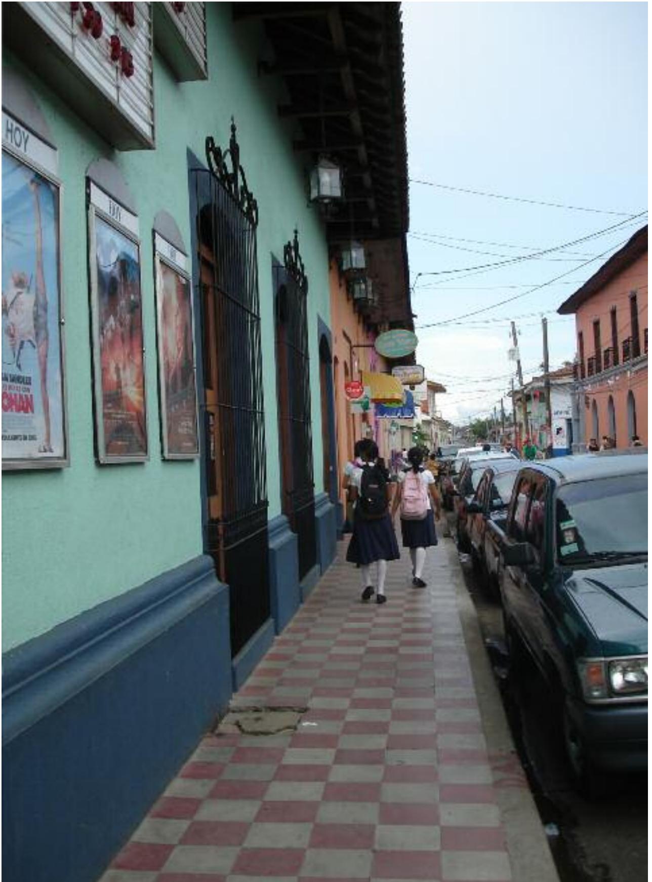
Schoolgirls walking down a street in León. Survivors of rape and sexual abuse must be free to make their own decisions about how to manage the consequences of rape and begin to rebuild their lives. Rape must not be the event that defines the rest of their lives.