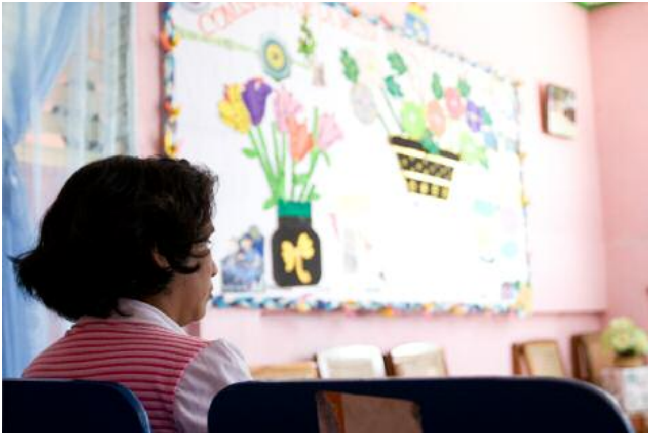
A woman waits in the reception area at the Women and Children's police station, Bluefields. The network of 37 Women and Children's Police stations across Nicaragua was established to provide specialist services for women, children and teenagers.