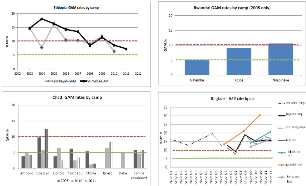
Figure 1: GAM rates among surveyed population groups

13. SAM rates in Chad and Ethiopia were brought below the 1% threshold (see Figure 2), except for in the Kunama ethnic group among Eritrean refugees in Ethiopia. Rates in Ethiopia were similar to or considerably better than those prevailing in the regions where the camps were located. In contrast, in Bangladesh, although they improved, SAM rates in the camps remained above the World Health Organization (WHO) threshold for emergency (2 percent). 6