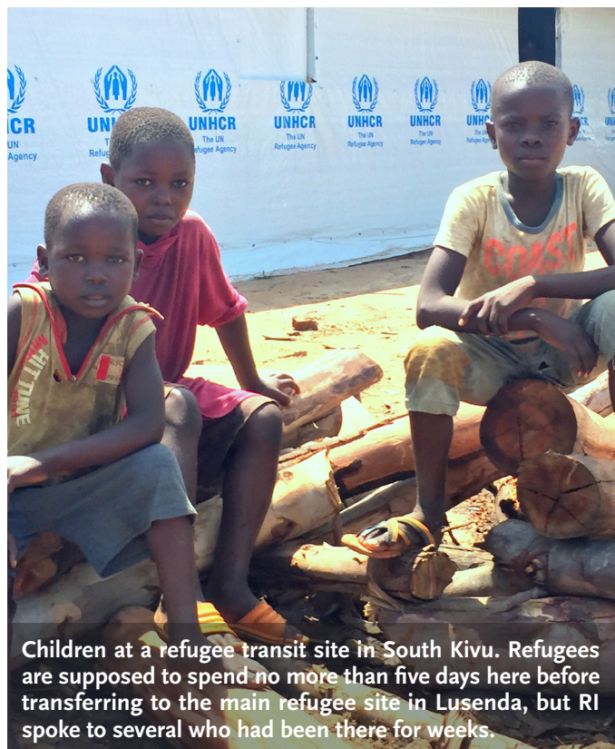
Children at a refugee transit site in South Kivu. Refugees are supposed to spend no more than five days here before transferring to the main refugee site in Lusenda, but RI spoke to several who had been there for weeks.

A month after this visit, RI was informed that registrations and onward movements from transit centers were happening more frequently. This is a welcome change, and every effort must be made to ensure refugees continue moving through transit centers in a timely manner. One way of doing this