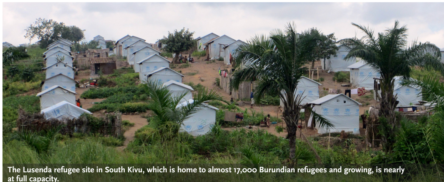
The Lusenda refugee site in South Kivu, which is home to almost 17,000 Burundian refugees and growing, is nearly at full capacity.

First, there is a need for more intensive and consistent training of Congolese security personnel in refugee law and refugee rights. This is necessary both for police around the Lusenda site, as well as PNC and FARDC forces serving in other refugee-hosting areas. Some humanitarians and UN officials told RI that Congolese security forces view refugees primarily as a threat, and are therefore quick to act aggressively toward them. Training officers about refugees’ rights – to receive protection, to move freely, and to be treated in accordance with due process – may help alter their perceptions and behavior. UN officials and the CNR told RI that they do conduct training for PNC and FARDC officers on refugee rights and law, but