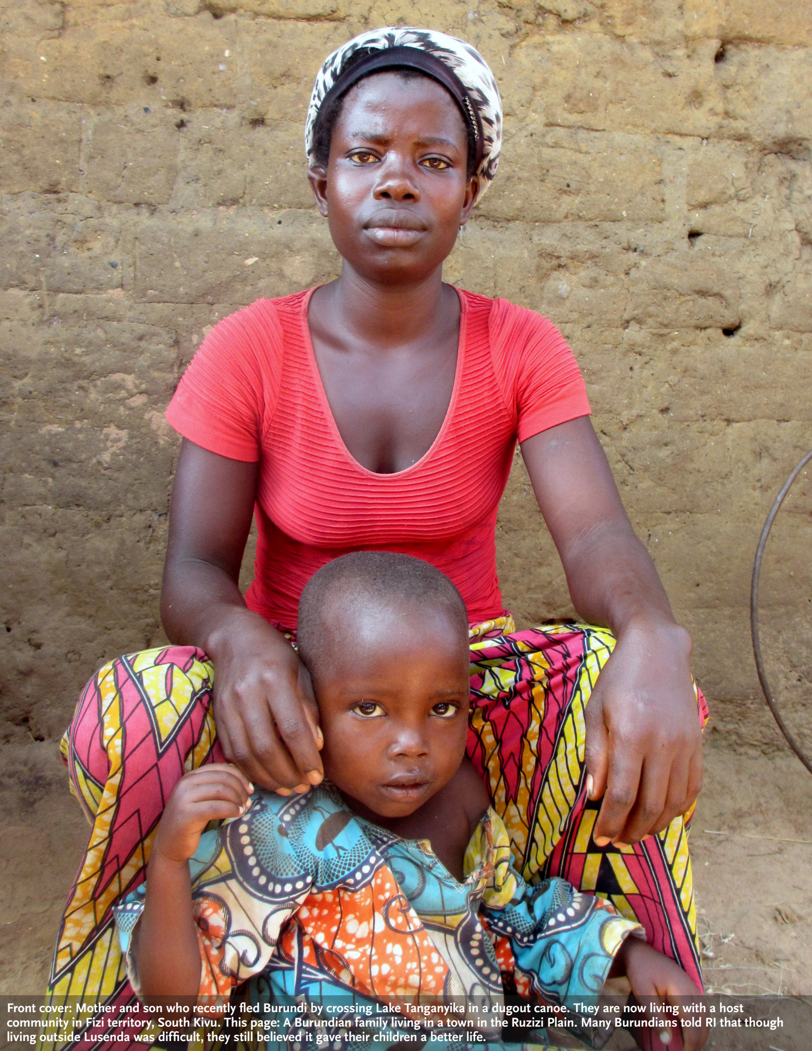
Front cover: Mother and son who recently fled Burundi by crossing Lake Tanganyika in a dugout canoe. They are now living with a host community in Fizi territory, South Kivu. This page: A Burundian family living in a town in the Ruzizi Plain. Many Burundians told RI that though living outside Lusenda was difficult, they still believed it gave their children a better life.