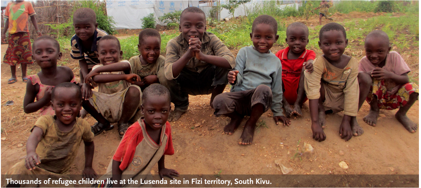
Thousands of refugee children live at the Lusenda site in Fizi territory, South Kivu.

they acknowledged this training does not keep pace with the officers' rotation schedule, leaving some untrained at any given time. Greater effort and resources must therefore be dedicated to such training, preferably by building up the training capacity of CNR.