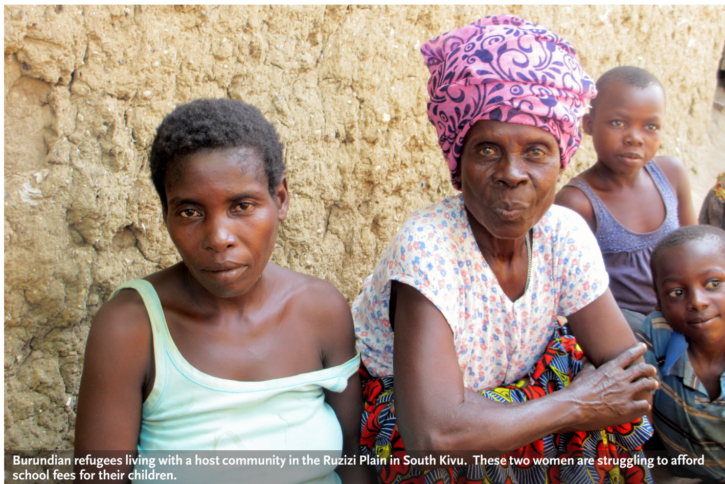
Burundian refugees living with a host community in the Ruzizi Plain in South Kivu. These two women are struggling to afford school fees for their children.

At the time of RI’s visit, UNHCR’s presence beyond Lusenda was limited and shrinking. The agency’s overall staffing resources in South Kivu were declining, due to reductions in funding.