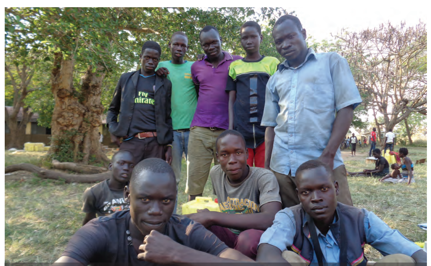
Young men from South Sudan's capital, Juba, wait to receive shelter kits in Palorinya refugee settlement. One told RI, "The world should sit our leaders down to talk peace. If not, then we need to get new leaders."

According to multiple senior humanitarians with whom the RI team spoke, OPM exercises tight control over where NGOs can intervene and in which sectors they can work. NGOs are obliged to obtain permission from OPM in order to operate in refugee settlements. Further, OPM is a signatory to all partnership agreements between NGOs and UN agencies. Such measures are not unusual in refugee situations; however, humanitarians told RI that OPM personnel had used these measures as a means to interfere in decisions about partnerships and contracting. RI was told of multiple cases in which OPM personnel had requested