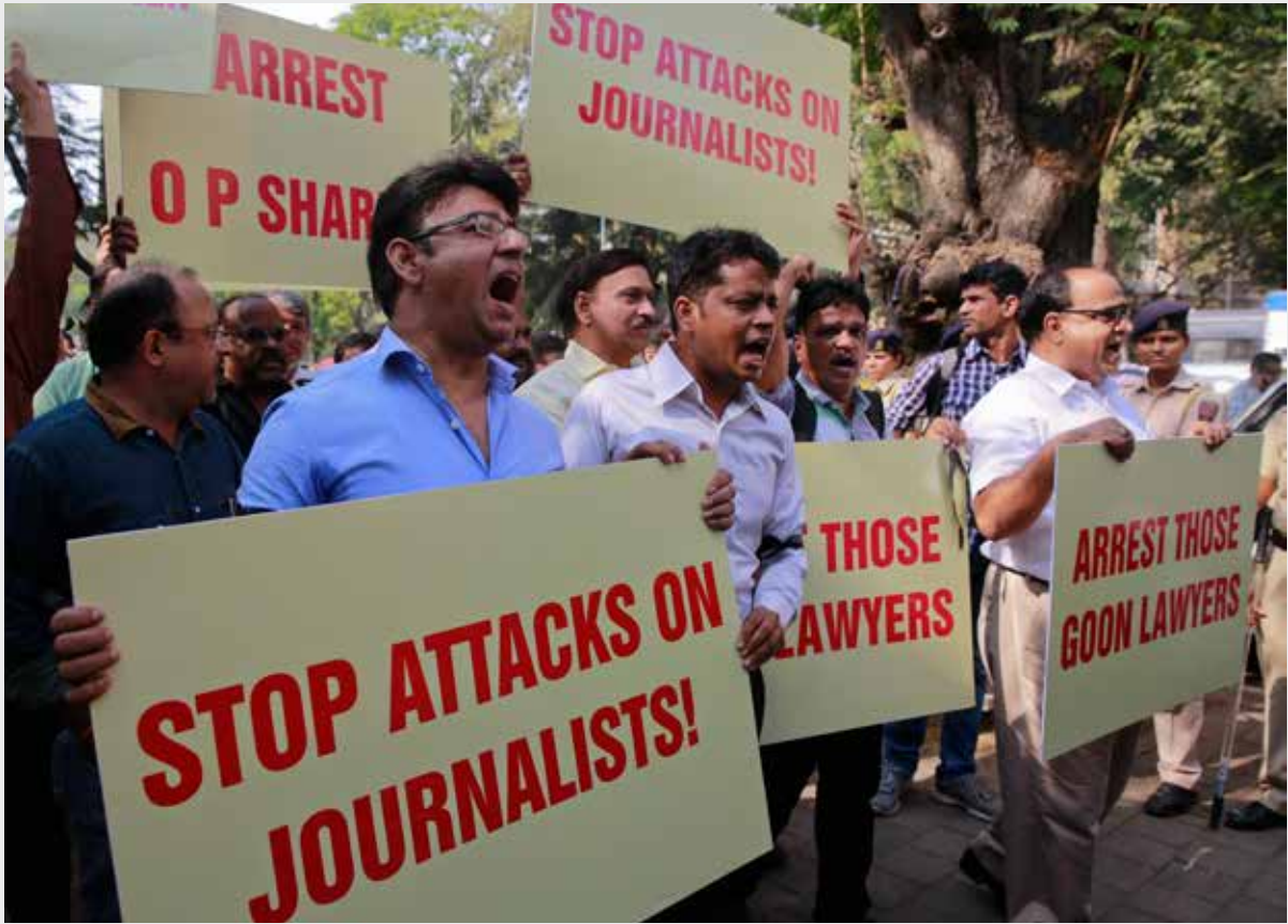
In a rare show of solidarity, journalists march together in protest after lawyers attacked members of the press outside a Delhi court house in February 2016.

by police and other government institutions makes daily headlines.