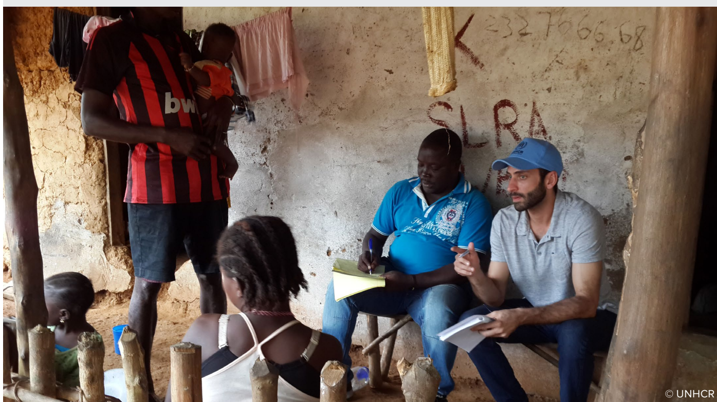
Fact finding mission on Statelessness in Yenga, Sierra Leone

From 22-24 September in Trinidad and Tobago , UNHCR coordinated the 5th Regional Course on Statelessness . 65 participants from 28 countries and territories came together to discuss the implementation of UNHCR's Global Action Plan to End Statelessness and the Brazil Plan of Action .