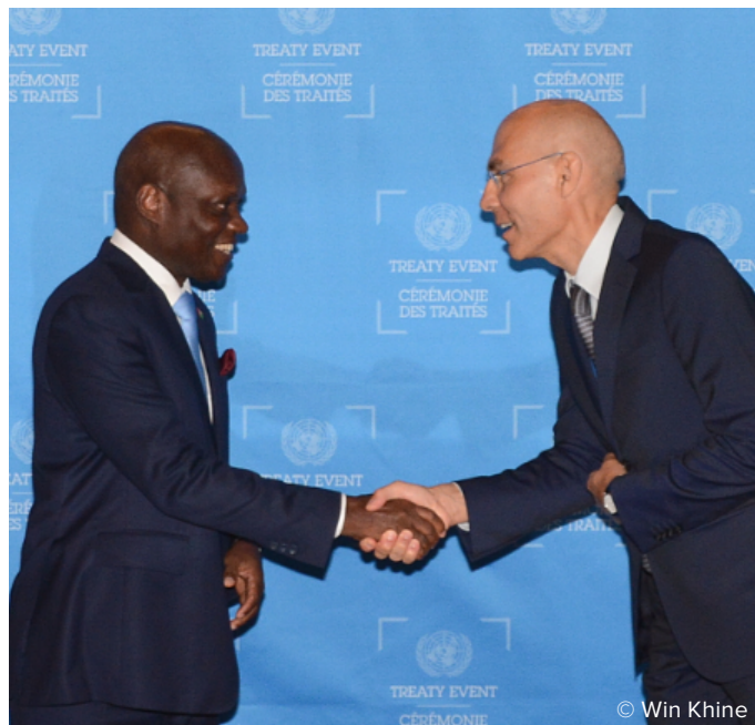
H.E. Mr. José Mário Vaz, President of the Republic of Guinea-Bissau depositing the Instruments of Accession to both Statelessness Conventions in the presence of Mr. Volker Türk, Assistant High Commissioner for Protection, UNHCR.

On 9 August in Tajikistan , a roundtable brought together some 20 government officials from relevant line ministries and agencies and leading experts to discuss the financial and legal feasibility of Tajikistan's accession to the 1954 and 1961 Statelessness Conventions. This meeting was followed by a Regional Conference on Statelessness on 15-16 September in Ashgabat, Turkmenistan , organized by UNHCR in collaboration with the government to advocate with Central Asian countries to accede to the two Statelessness Conventions.