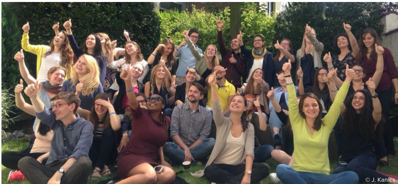
Youth Ambassadors at the Maastricht University Campus in Brussels during the First Youth Congress on Statelessness